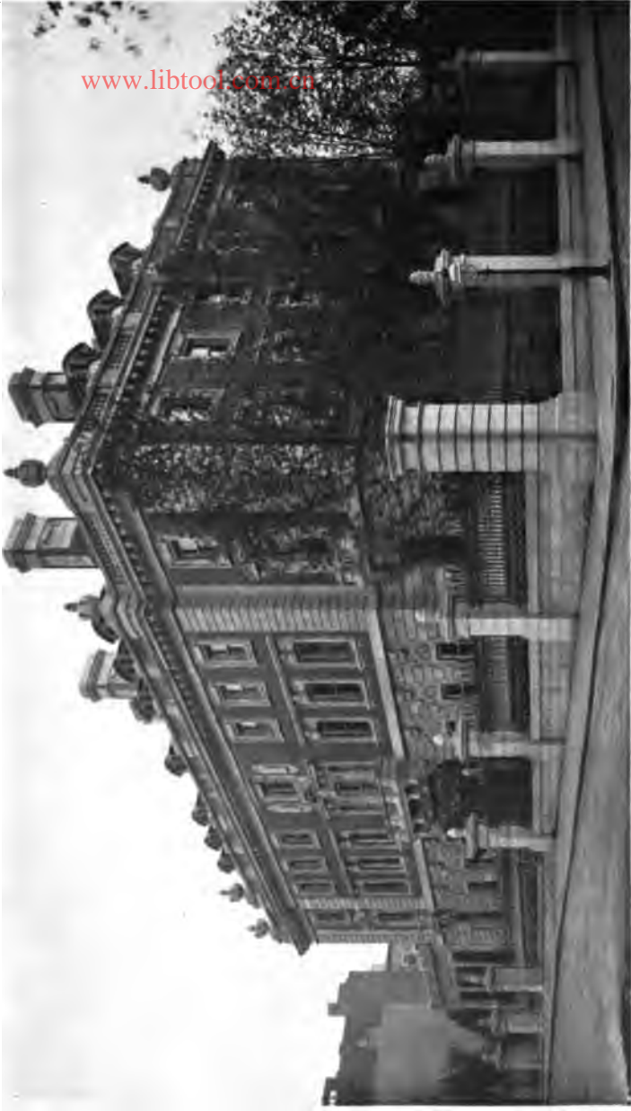
MR. CARNEGIE'S NEW YORK HOME—FRONT VIEW