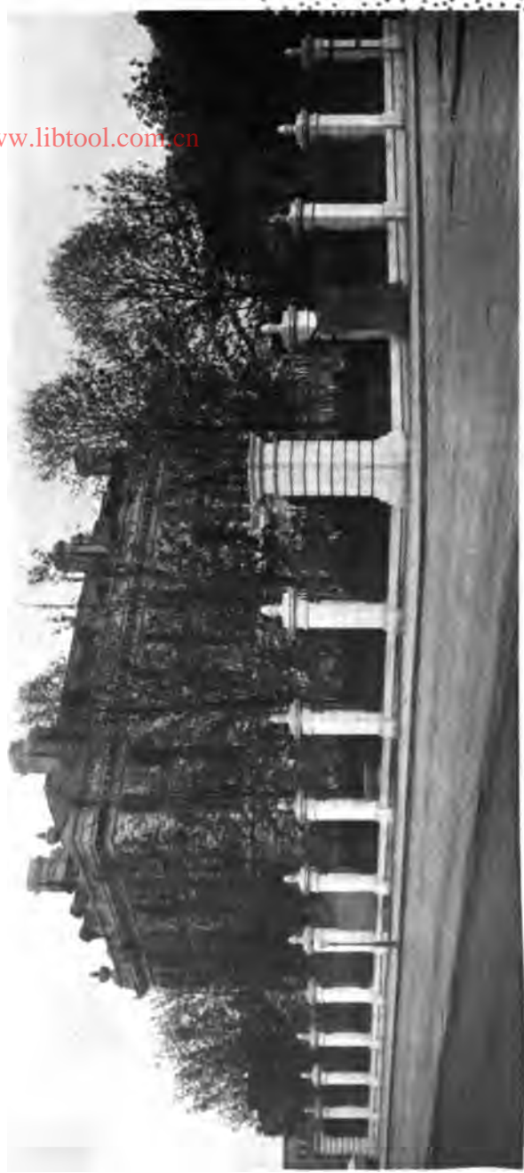
MR. CARNEGIE'S NEW YORK HOME, SHOWING THE GARDEN,