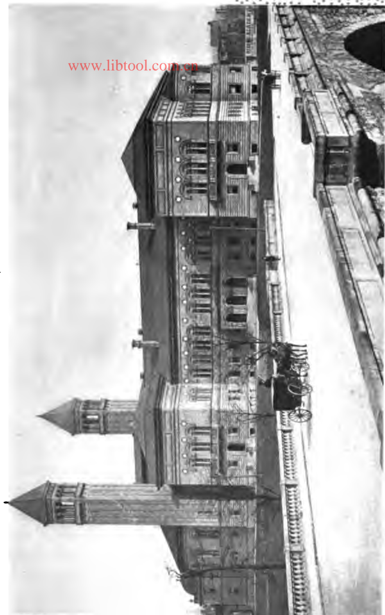
CARNEGIE INSTITUTE, PITTSBURGH, PA.