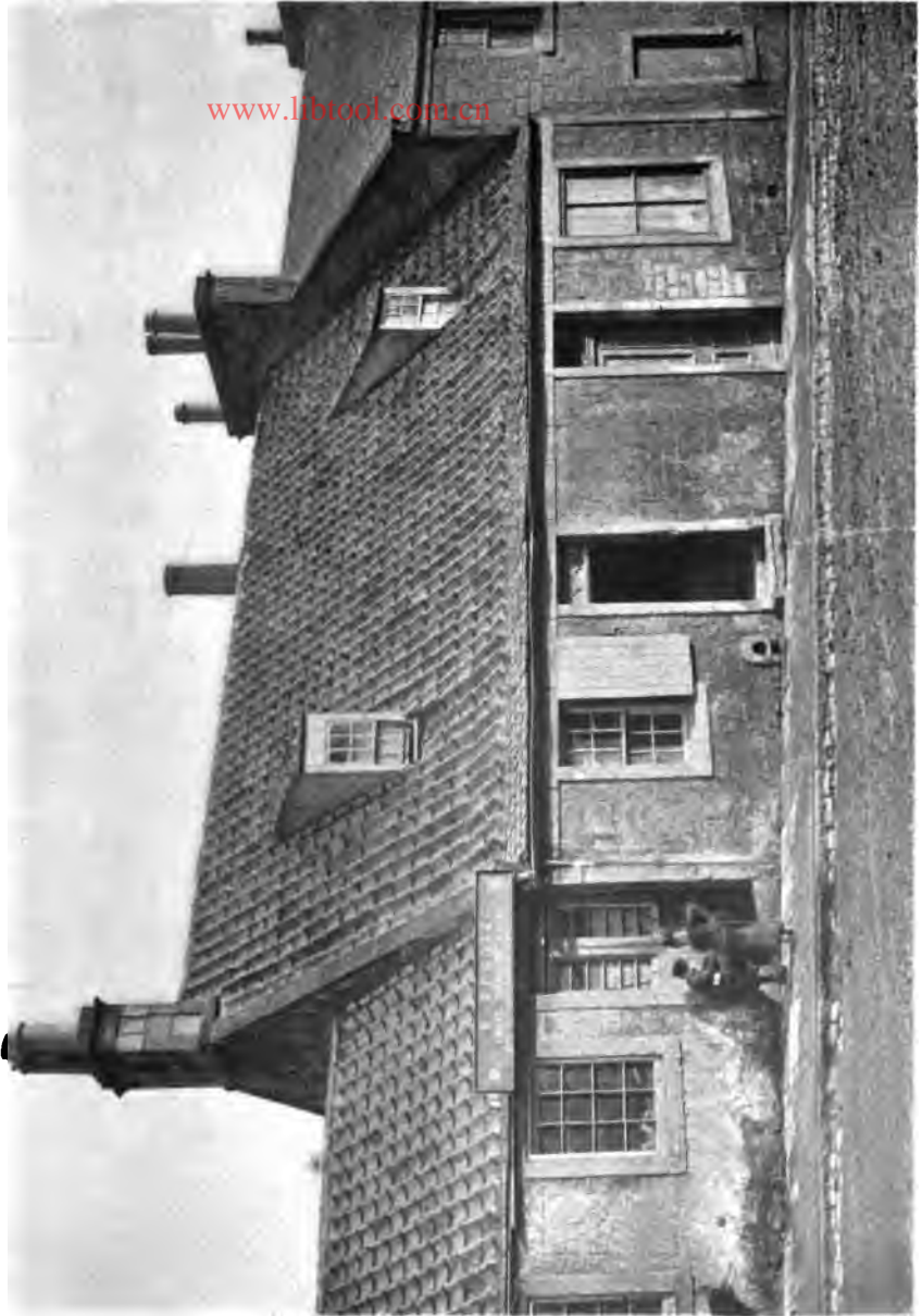
THE CARNEGIE HOME AT DUNFERMLINE, SCOTLAND The upper left-hand window marks the room in which Andrew Carnegie was born