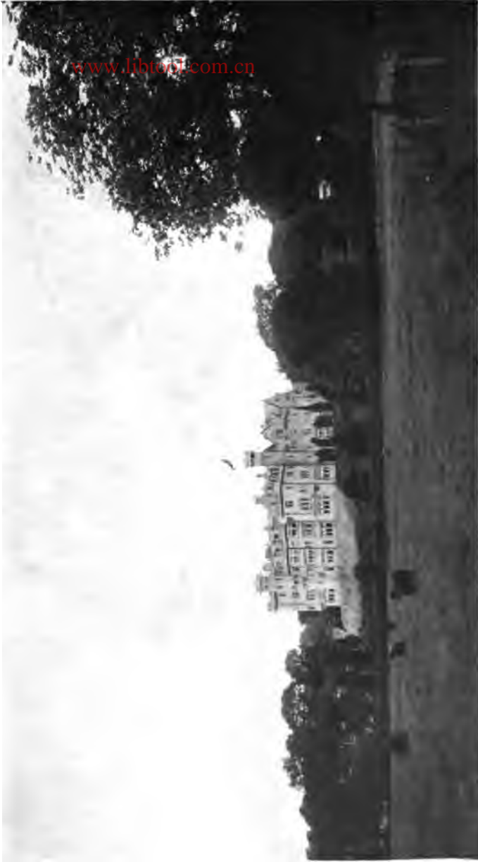
SKIBO CASTLE. MR. CARNEGIE'S HOME IN SCOTLAND