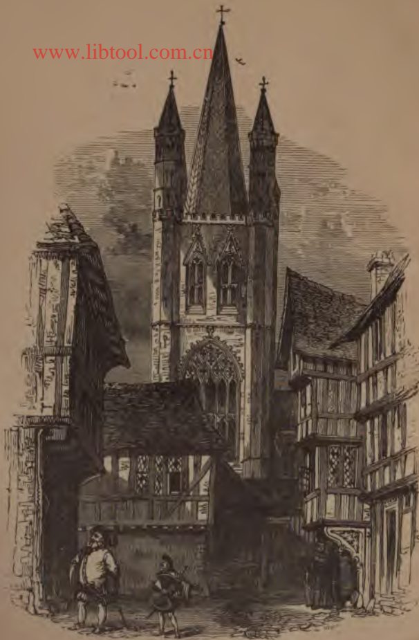
EASTCHEAP, WITH THE CHURCH OF ST. MICHAEL, CORNHILL.

Falstaff. Wait close: I will not see him (i. 2. 53).