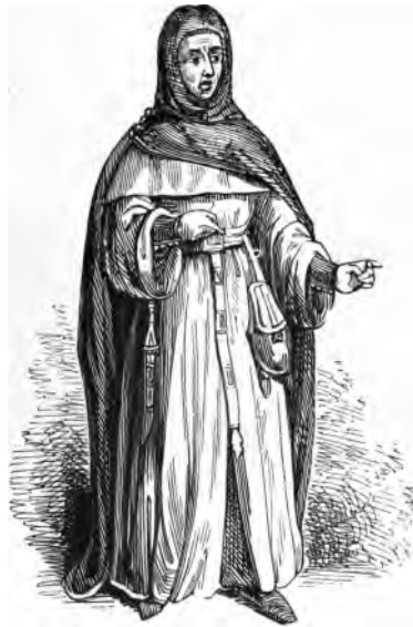
CHIEF-JUSTICE SIR WILLIAM GASCOIGNE.