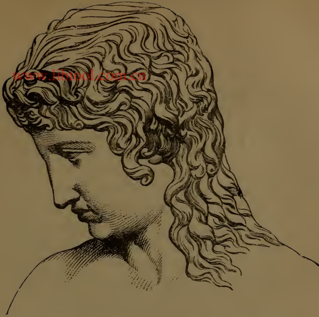
HEAD OF EROS (CUPID), FROM THE ANTIQUE.