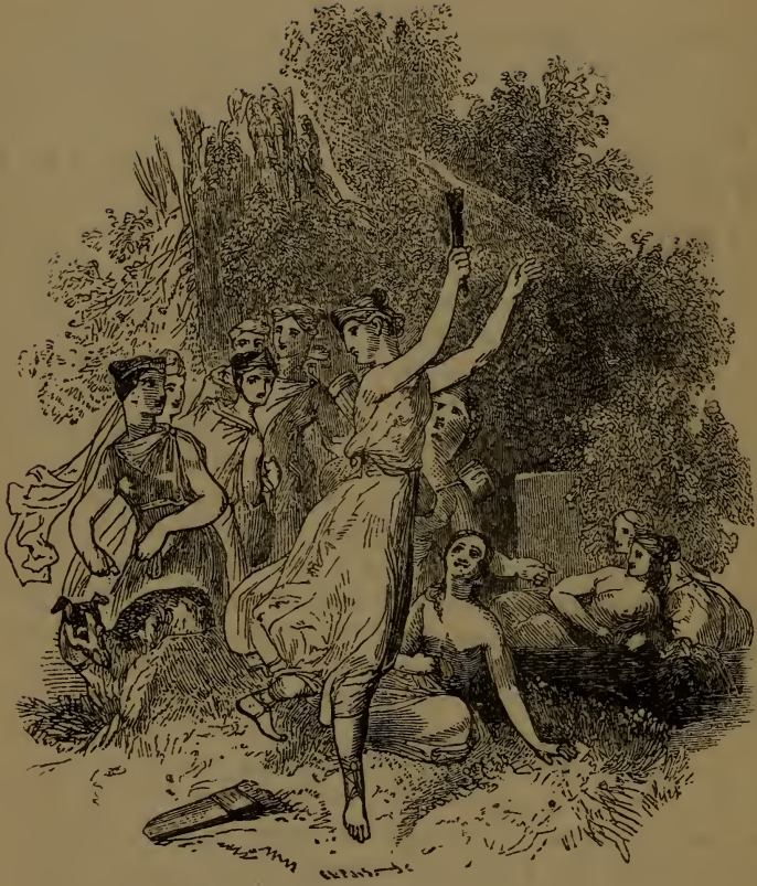
in her maiden hand The fairest votary took up that fire Which many legions of true hearts had warm'd ( Sonn. 154).