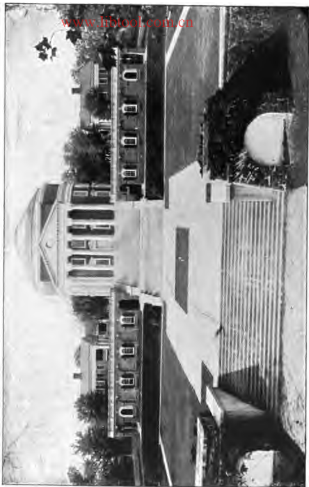
The Rotunda, north front