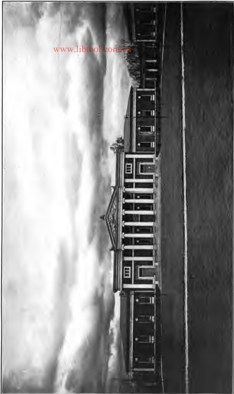
The Academical Building