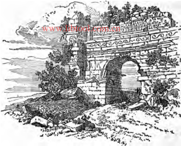
REMAINS OF GATE AT EPHEBUS