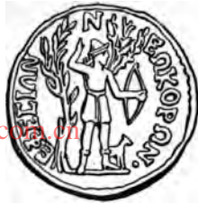
MEDAL OF EPHEBUS