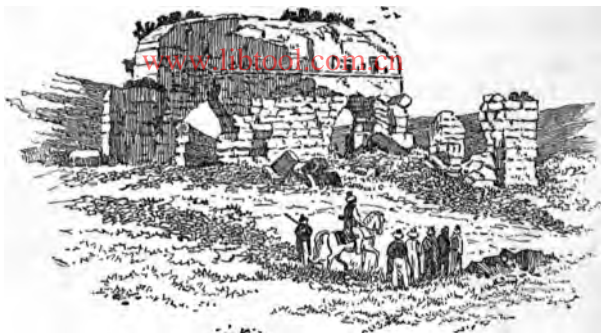
REMAINS OF GYMNASIUM AT EPHEBUS