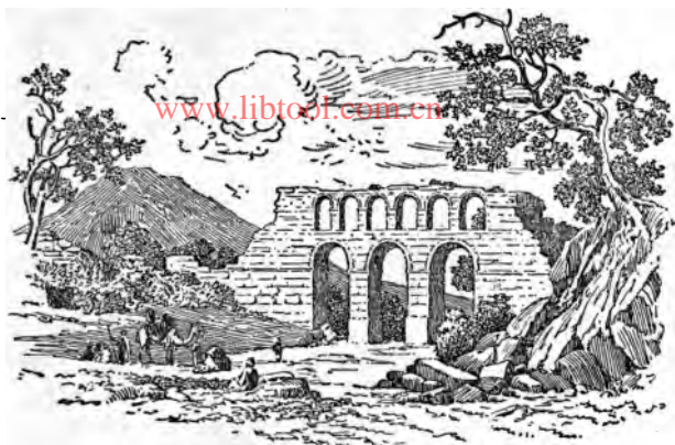
RUINS OF AQUEDUCT AT EPHEBUS