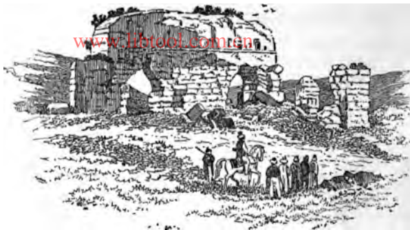
REMAINS OF GYMNASIUM AT EPHEBUS