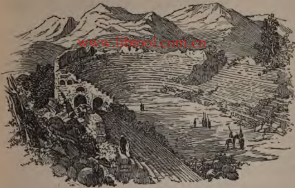
REMAINS OF AMPHITHEATRE AT EPHEBUS