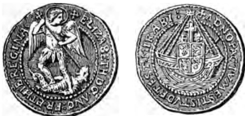
GOLDEN ANGEL OF QUEEN ELIZABETH

Angels . The angel was an English gold coin, worth about ten shillings. It had on one side a figure of Michael piercing the dragon, whence its name. The device is said to have originated in Pope Gregory's pun on Angli and Angeli , and it gave rise to a good many puns. See M. W. i. 3. 60, Much Ado , ii. 3. 35, M. of V. ii. 7. 56, and 2 Hen. IV. i. 2. 187.