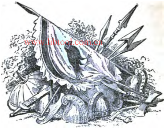
DANISH STANDARD AND ARMS