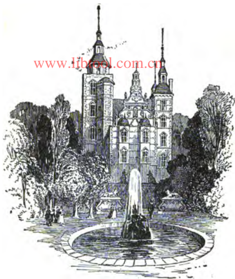
PALACE AT ROSENBERG