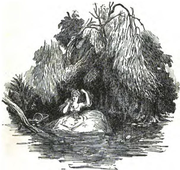
DEATH OF OPHELIA.