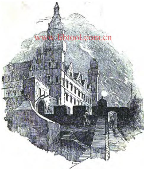
PLATFORM AT ELSINORE