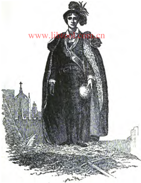
KEMBLE AS HAMLET ( Sir T. Lawrence )