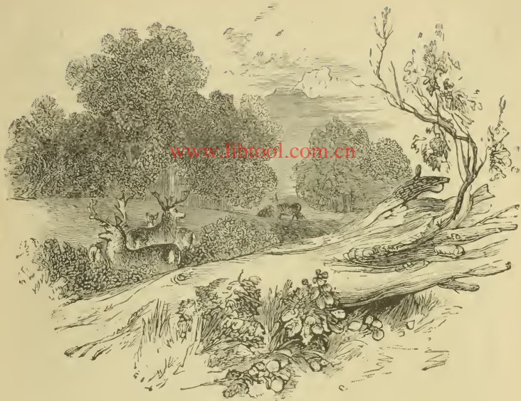
THE FOREST OF ARDEN.