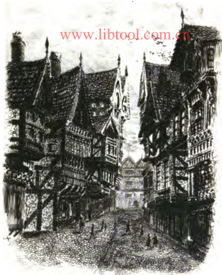
Old London Street