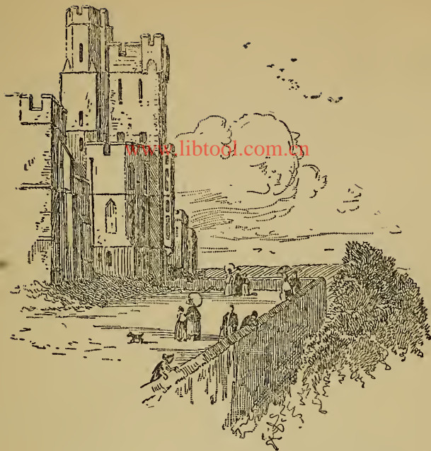
WINCHESTER TOWER, WINDSOR CASTLE