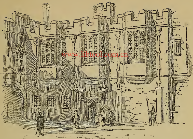
PART OF WINDSOR CASTLE