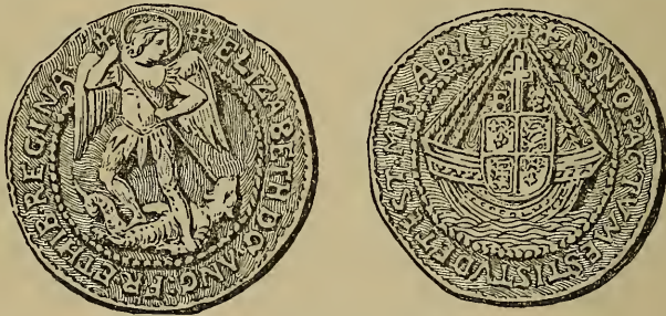
GOLDEN ANGEL OF QUEEN ELIZABETH

52. Angels. The angel was an English gold coin, worth about ten shillings. It took its name from having on one side a figure of Michael piercing the dragon. The device is said to have originated in Pope Gregory's pun on Angli and Angeli , and it gave rise to many puns. See C. of E. iv. 3. 41, Much Ado , ii. 3. 35, M. of V. ii. 7. 56, and 2 Hen. IV. i. 2. 187.