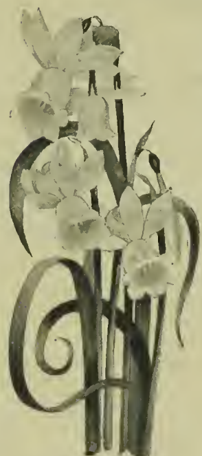
TRIANDRUS CALATHINUS (Less than half natural size).

THE DAINY LITTLE "ANGEL'S TEARS" DAFFODIL ( Triandrus albus ) was found by our Mr. Peter Barr on the mountains of Portugal and Spain, growing in very hard, firm, fine gritty soil, sometimes in the narrowest fissures of granite and slatestone rocks. All in this section make lovely little pot plants, and grown thus should be given cold frame culture. Established on rockwork out of doors they form a picture full of grace and beauty. They prefer shade, a gritty soil, and well-drained position.