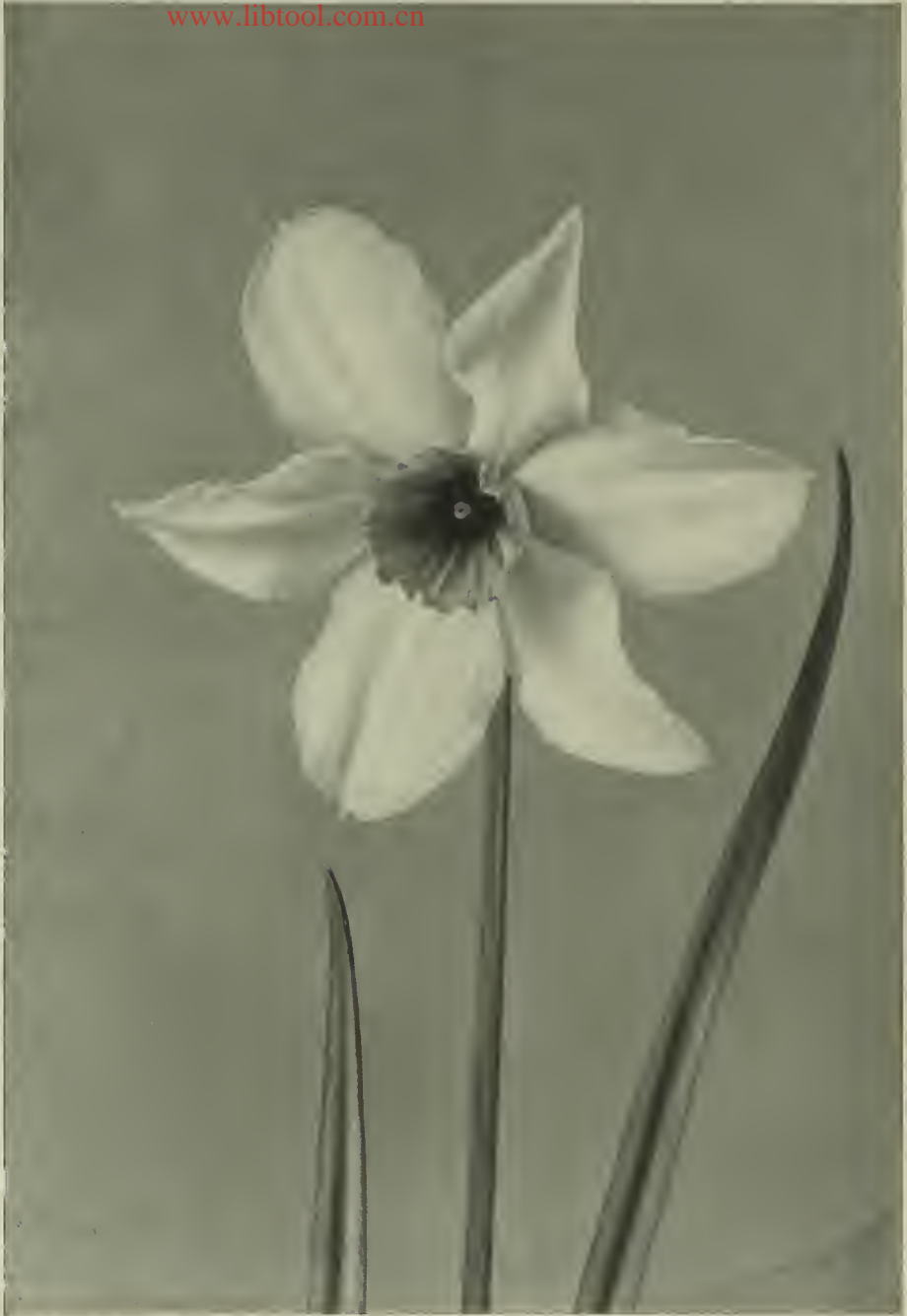
NARCISSUS KATHERINE SPURRELL.

A variety of refined form and colouring, and one of the most beautiful of the Leedsii section, perianth white, broad and campanulate, of fine substance, cup delicate canary colour, flower large. (See page 30.)