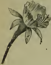
WHITE HOOP PETTICOAT (Half natural size).

For rockwork, edgings and small beds, these beautiful little Daffodils are most charming, while if several bulbs are planted in pots or pans, they are greatly prized for indoor decoration. See Cultural Notes , pp. 3 to 5.