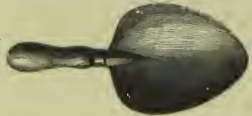
NO. 3. BARR'S SPECIAL BULB TROWEL.

It will be found of great value for general garden purposes, and far in advance of the old-fashioned trowel. 2/9 each.