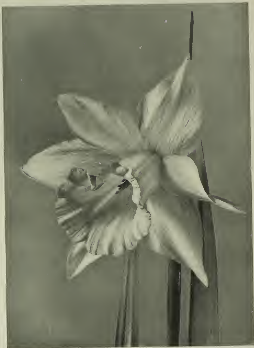
NARCISUS HENRI VILMORIN.

A most beautiful white Trumpet Daffodil of very refined texture and form, flowers measuring 4\frac{1}{2} inches across and rather of Empress shape. Award of Merit Royal Horticultural Society, April 19th, 1904. (See page 12.)