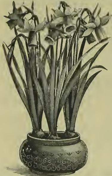
Three bulbs of N. Queen of Spain growing in Barr's Fertilised Fibre in a 4-inch "Doulton-ware" Vase, without drainage hole.

A charming effect can be obtained by growing Daffodils in fancy vases or bowls, with or without drainage, by simply using our specially prepared Fertilised Fibre and Charcoal Mixture (3s. 6d. per bushel, 1s. per peck); the mixture is light, clean, and nice to handle, and remains sweet (an important matter where the vases used have no drainage holes); indeed, it is in every way superior to potting soil for growing Daffodils and other bulbs in fancy bowls and vases.