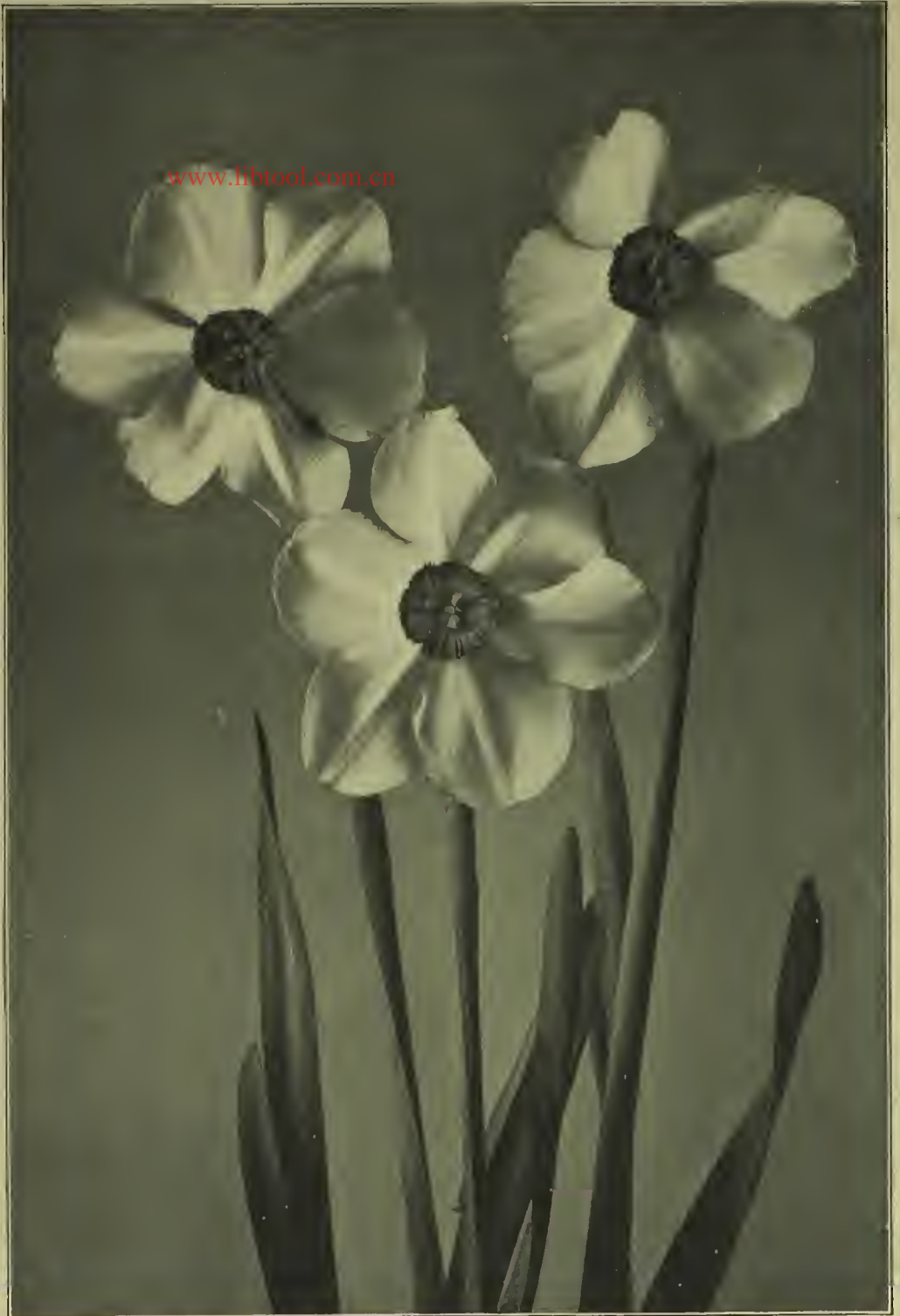
NARCISSUS POETICUS ALMIRA.

A very beautiful large-flowered Poet's Narcissus. ( See page 36. )