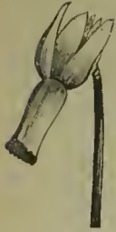
N. CYCLAMINEUS (Half natural size).