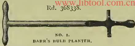
NO. 1. BARR'S BULB PLANTER.

No. 1. BARR'S SPECIAL BULB PLANTER (Regd. 368338), specially designed for planting Daffodils, etc., in grass. At every operation it lifts a clean circular little sod of grass which is released from the cup when the second hole is made, and lies ready at hand to fill in the holes when the bulbs have been put in. A time must be chosen for planting when the ground has become softened after early autumn rains