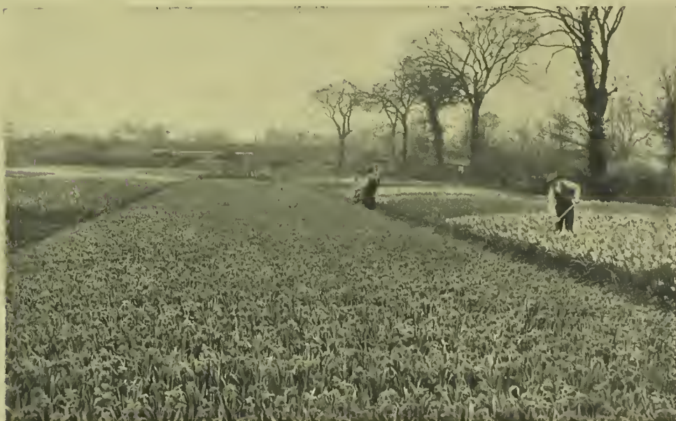
View of a corner of Barr's Daffodil Nurseries in spring.

BARR'S DAFFODILS have been awarded upwards of 100 GOLD, SILVER-GILT, and SILVER MEDALS, A Ten Guinea Silver Challenge Cup and Gold Medal 1901, Gold Medals 1902, 1903, 1904, and 1905, also many Certificates of Merit, etc.