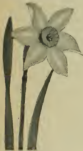
EXAMPLE OF A FLOWER IN GROUP III.

DISTINGUISHING CHARACTER. —Depth of cup less than one-quarter the length of the perianth segments (petals).