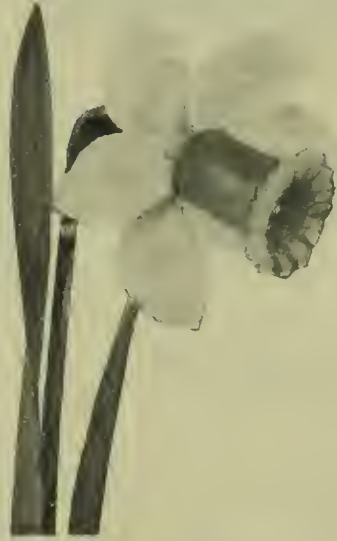
EXAMPLE OF A FLOWER IN GROUP I.

* ACHILLES (2), x, a native Daffodil of Guernsey, perianth light yellow, trumpet rich deep yellow, ht. 15 in. per 1000, 45/-; per 100, 5/- o 9... —