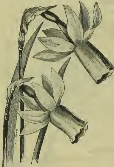
NARCISSUS JOHNSTONI QUEEN OF SPAIN (About two-thirds natural size).

Natural Hybrid of Ajax x Triandrus, with reflexing perianth, and tube longer than it is wide.