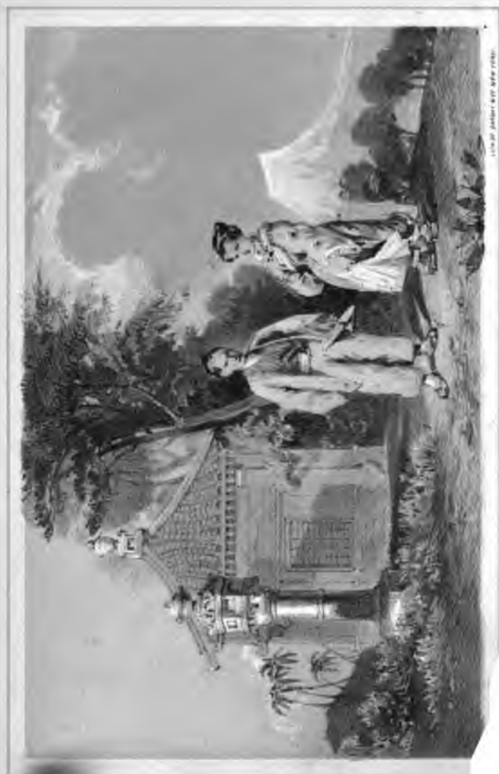
1. 1860年 1860年 1860年 1860年