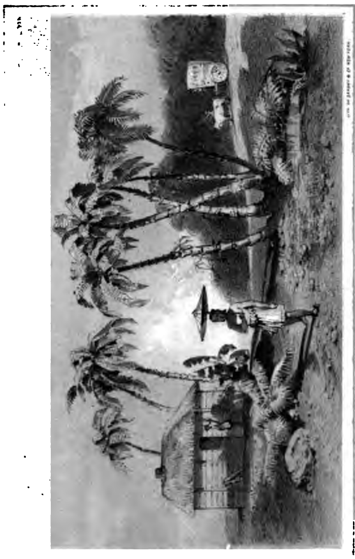
图例 1. 热带风光