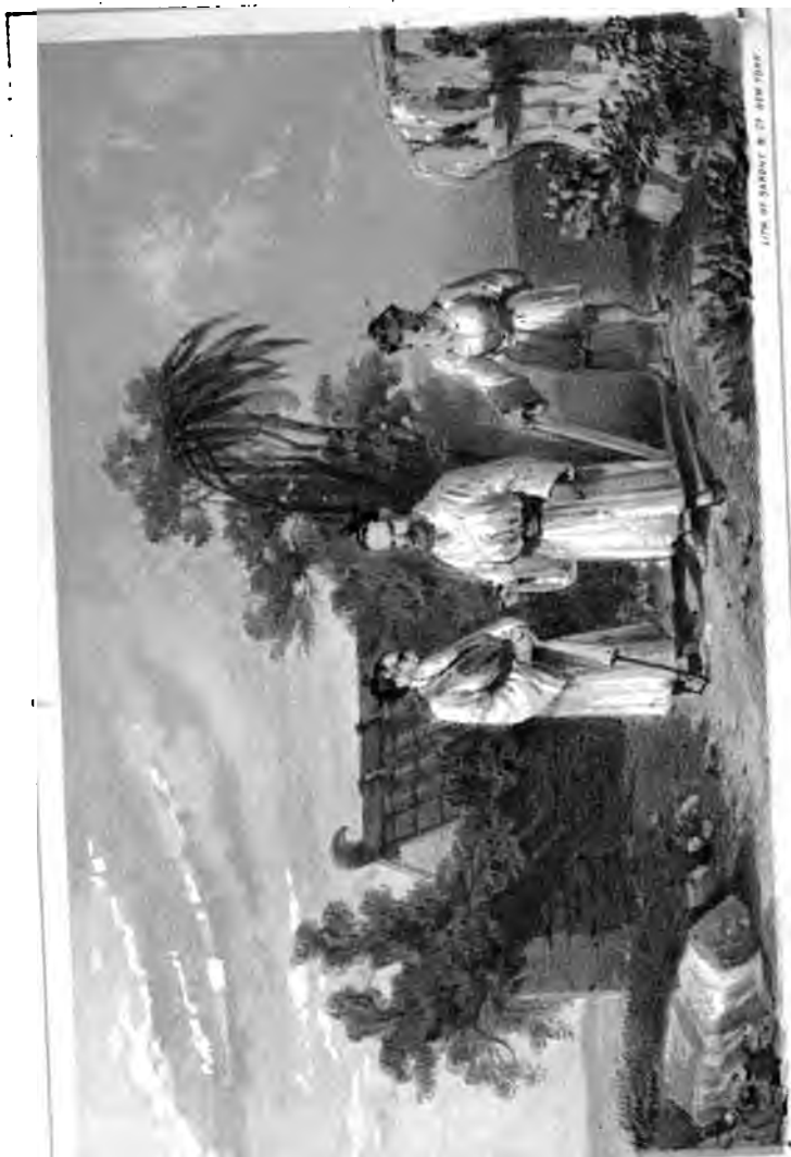
VIEW OF BARRIET, N. 77. 1850. P. 100.