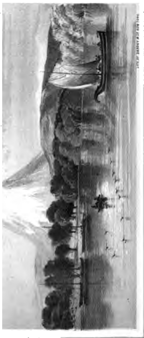
VIEW OF HARBOR AT AKAHAMA