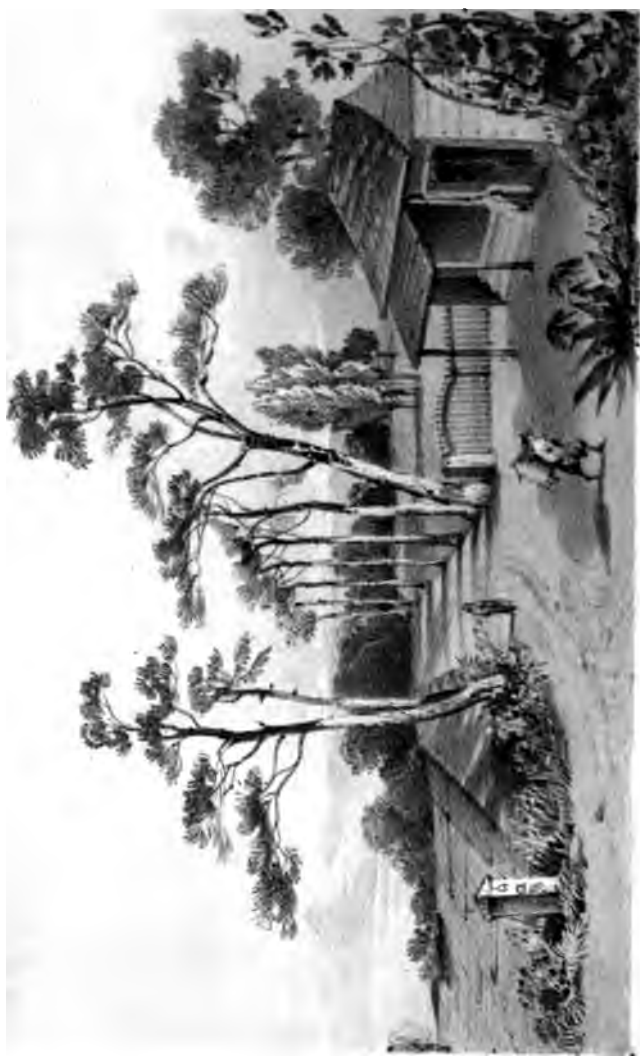
Figure 1. A traditional Chinese landscape.