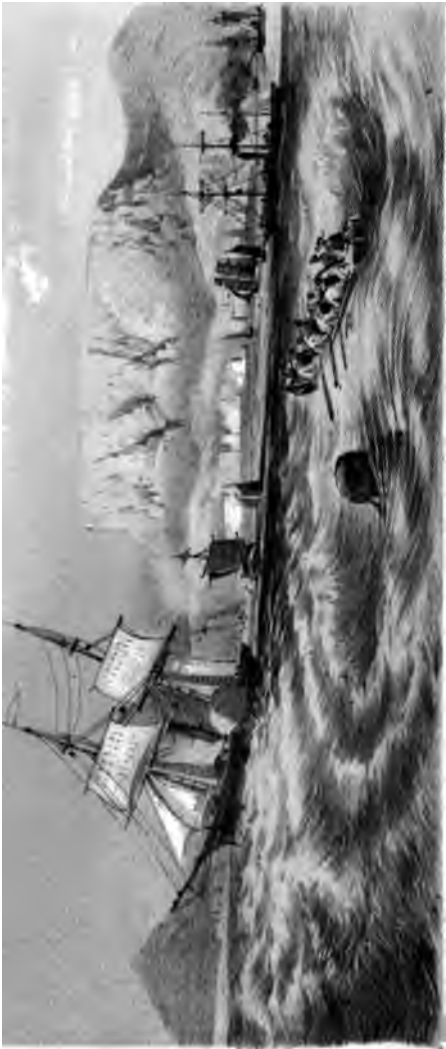
VIEW OF HONG KONG