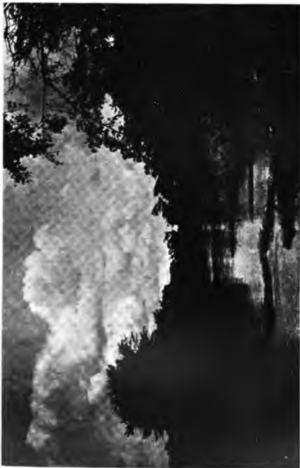
A very peaceful scene . . . if it were not that beneath its peace lies hidden a warfare more cruel than ours ( p. 106)