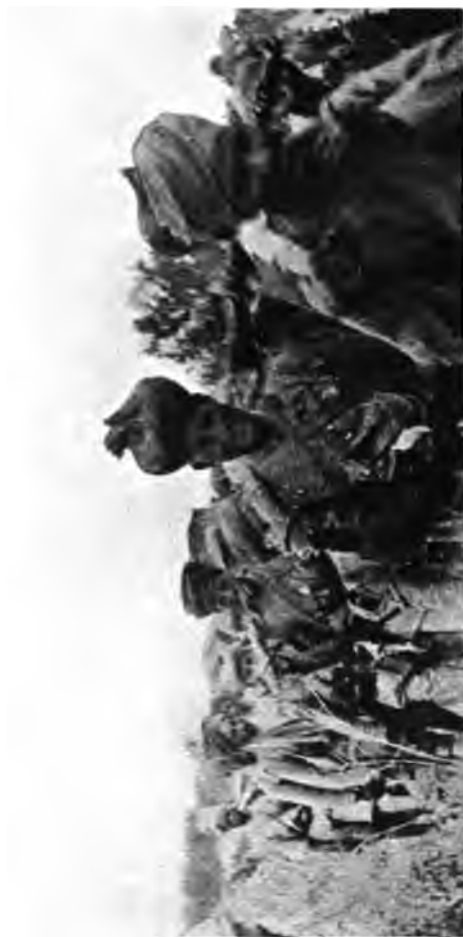
... the Kashmiris . . . smothered us with a new layer of red dust (p. 57)