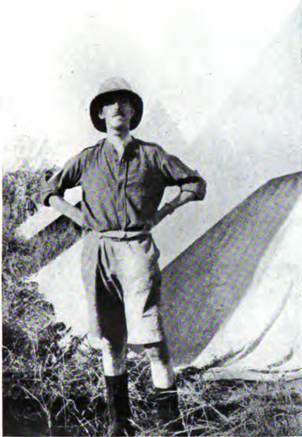
This apparition accosted a South African transport officer, begging for water ( p. 166)