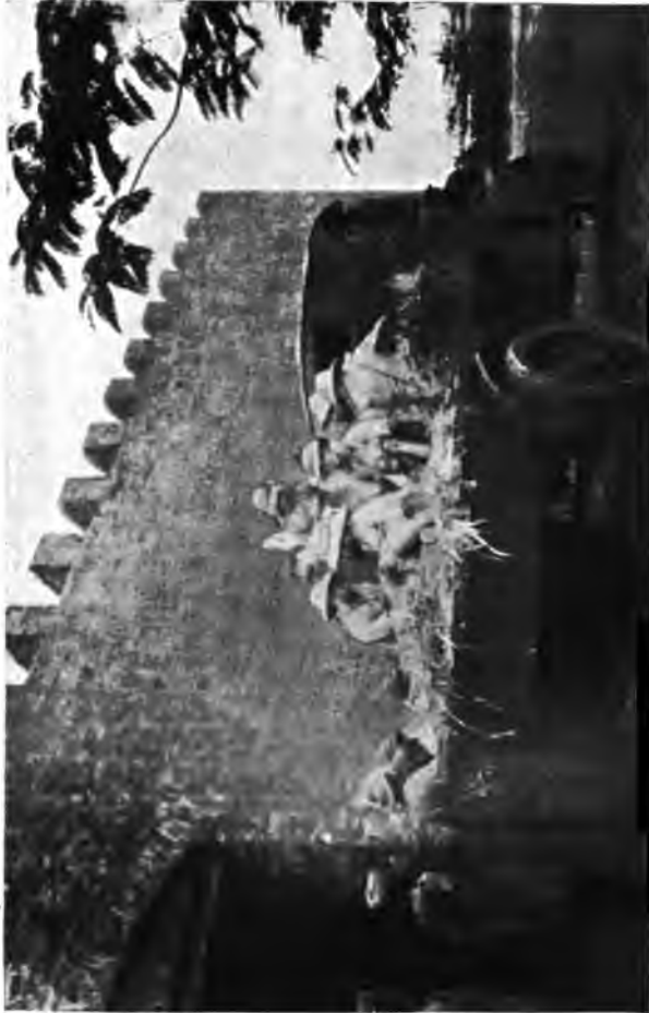
... the German prisoners had been sent back on empty lorries to our base (p. 235)