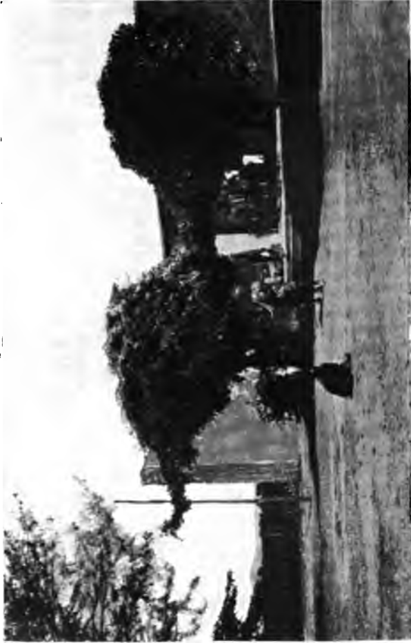
. . . a deep steep . . . over which a fine bougainvillea sprawled (p. 196)