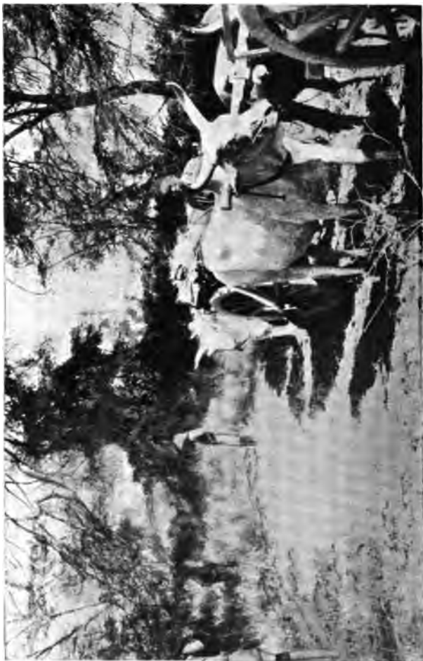
By those sandy nullahs . . . clustered a green growth of acacia thorn (p. 73)