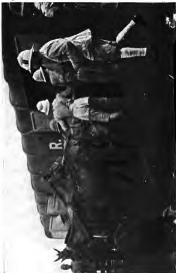
. . . the Rhodesian stores and mules had been detrained (p. 6)