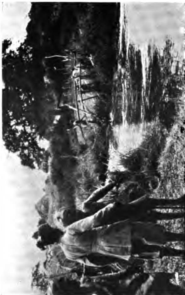
. . . through the greenery of the further bank . . . we could see the pointed roofs . . . of the native village (p. 175)