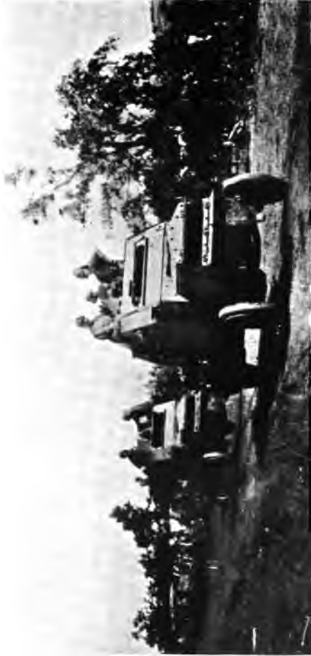
First the armoured cars moved off, with an open exhaust as loud as their machine-guns ( p. 203)