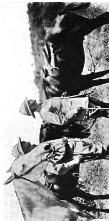
A fine soldier and a gallant gentleman all the same (p. 64)