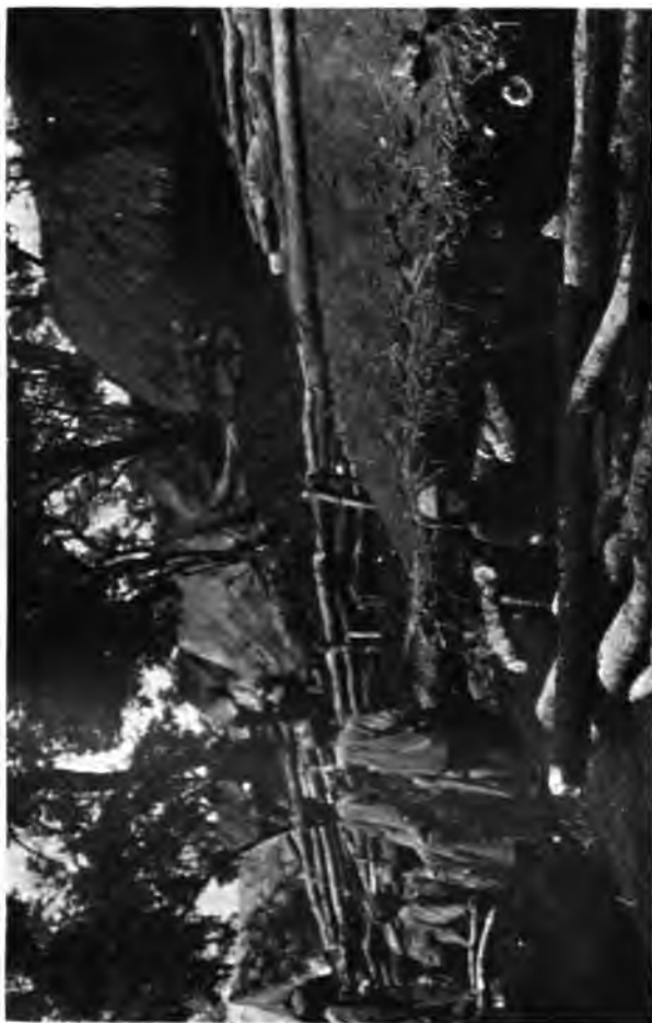
In two days the pioneers had made us dug-out accommodation for all our patients (p. 256)