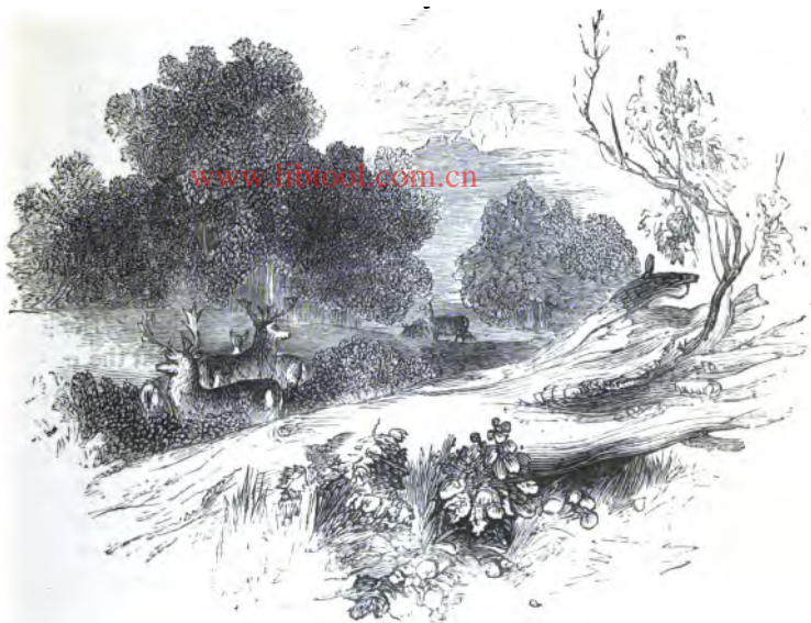
THE FOREST OF ARDEN.