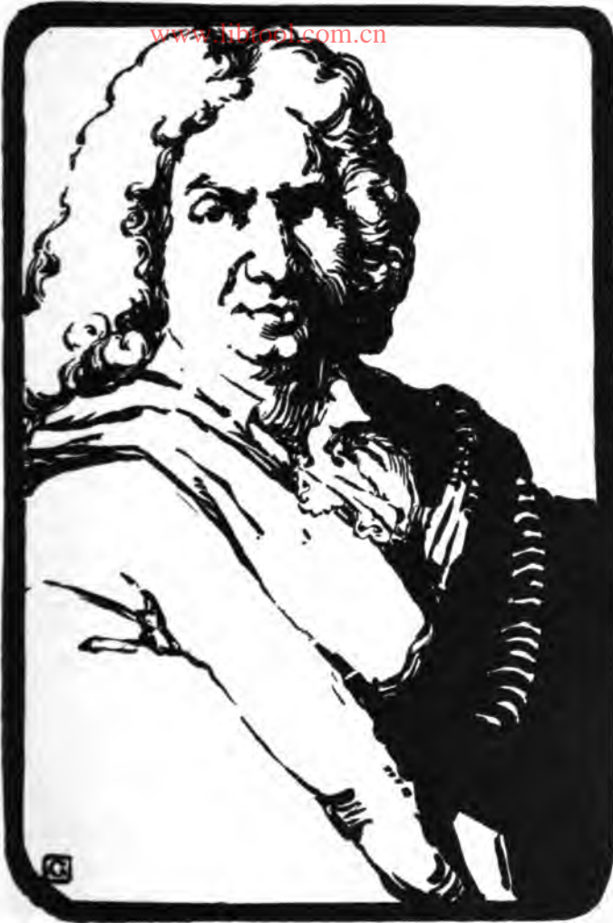
ALAIN RENÉ LE SAGE