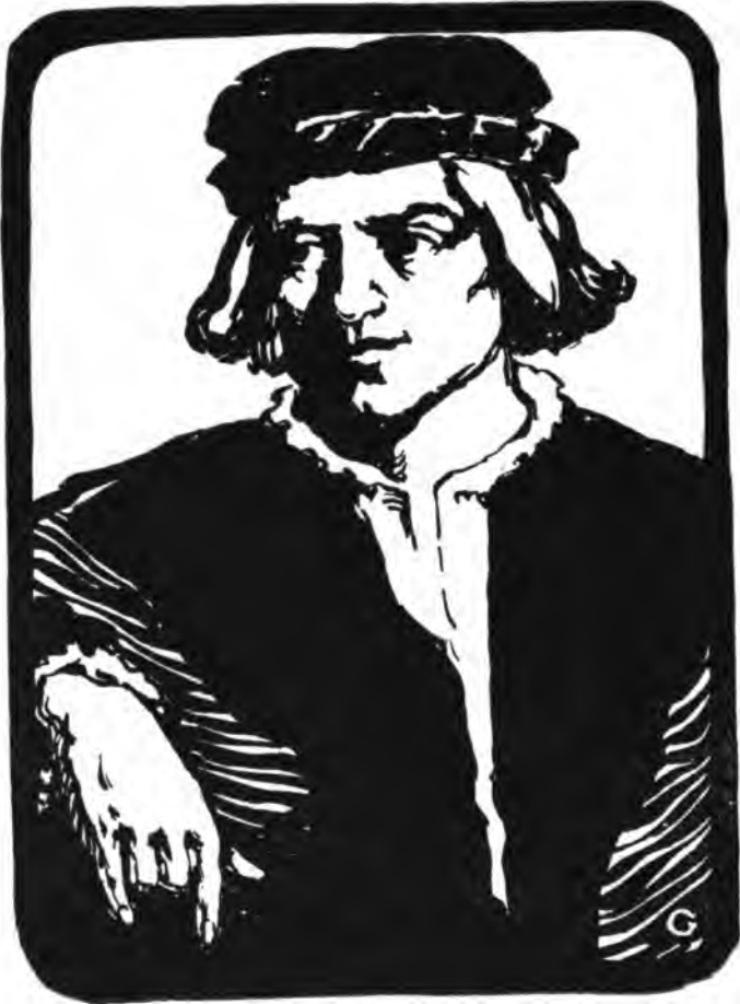
JEAN DE MEUNG