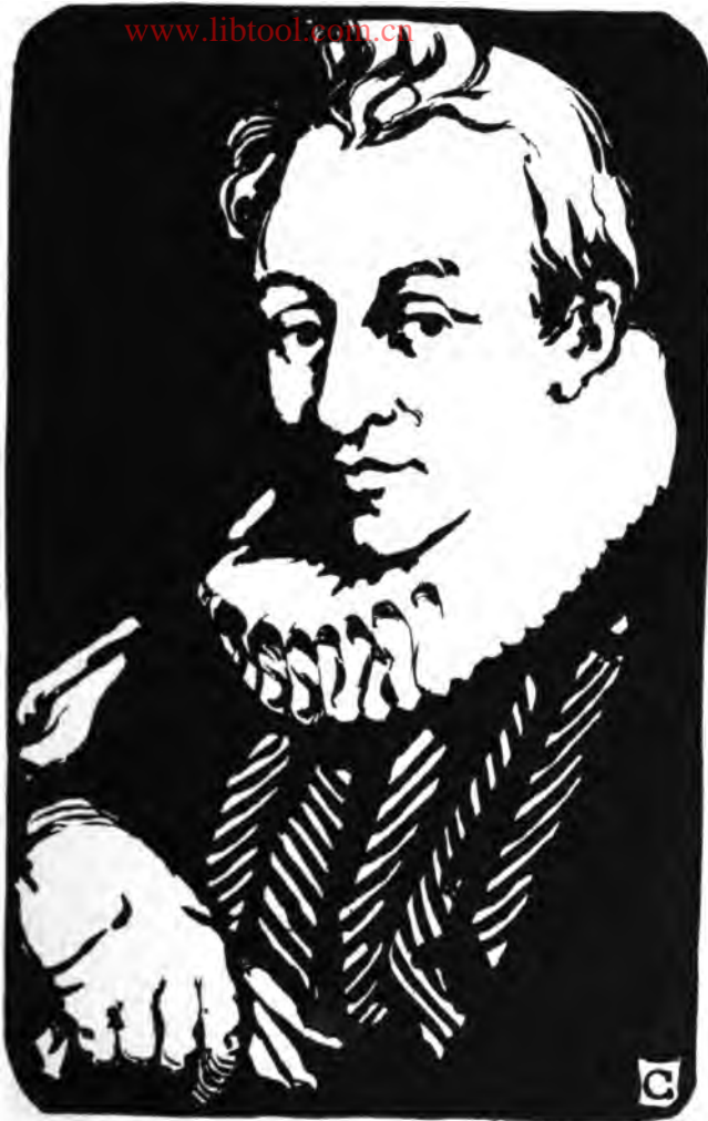
SIR PHILIP SIDNEY