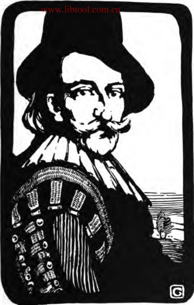
MIGUEL DE CERVANTES SAAVEDRA