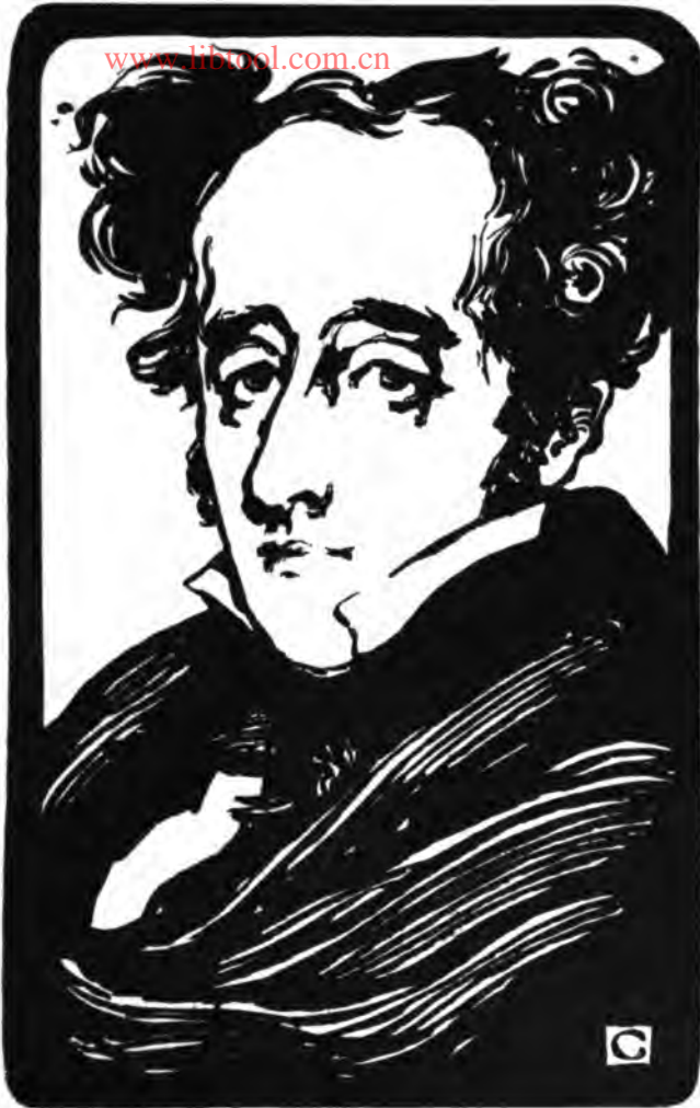
FRANÇOIS RENÉ DE CHATEAUBRIAND