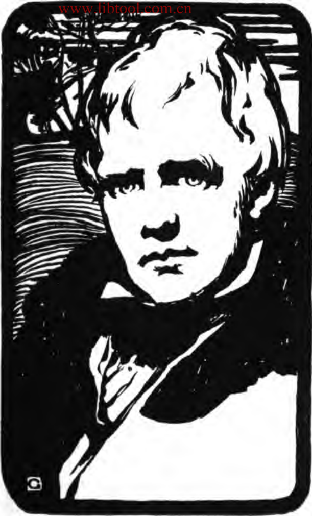
SIR WALTER SCOTT