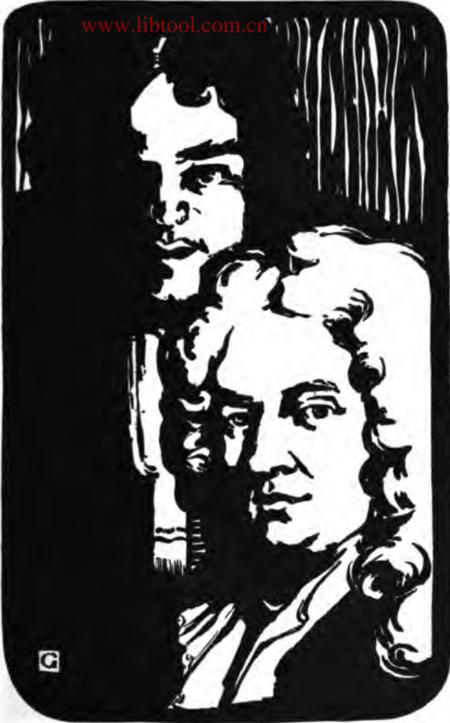
RICHARD STEELE AND JOSEPH ADDISON