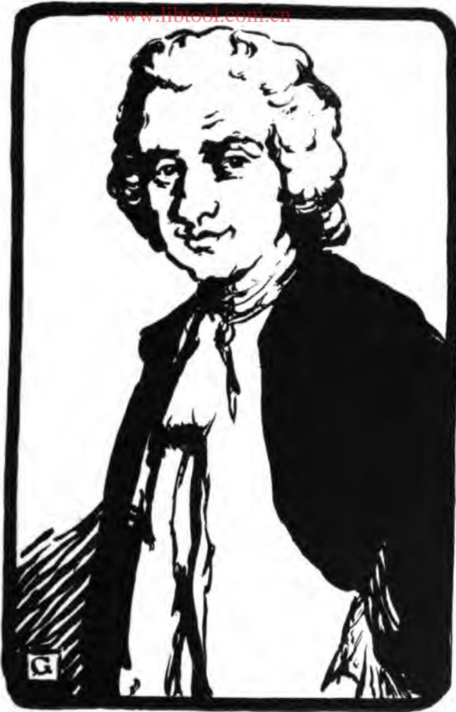
JEAN JACQUES ROUSSEAU