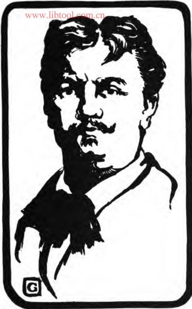
GUY DE MAUPASSANT