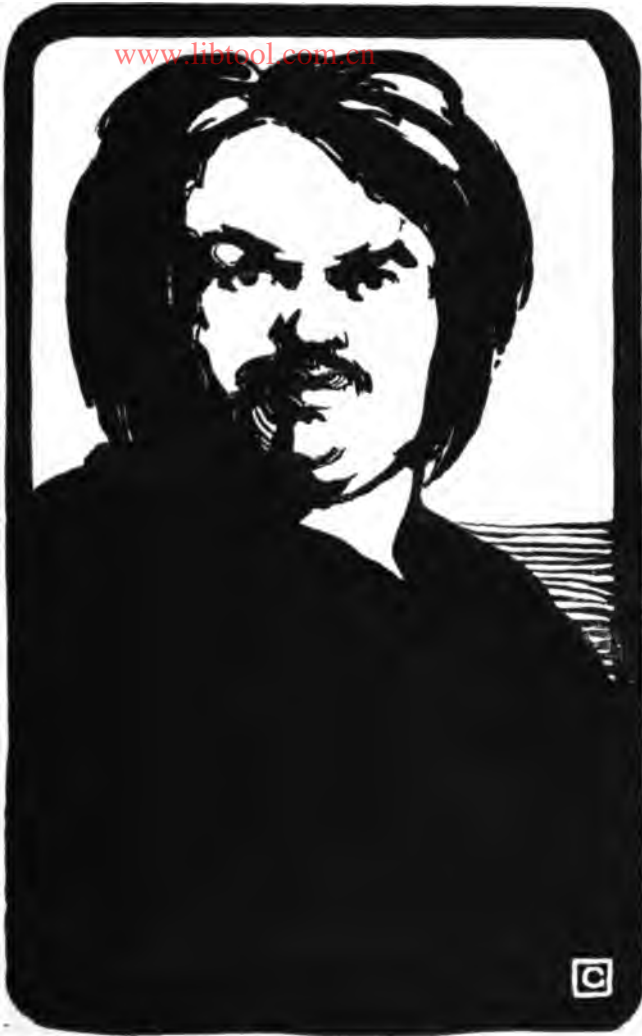
HONORÉ DE BALZAC