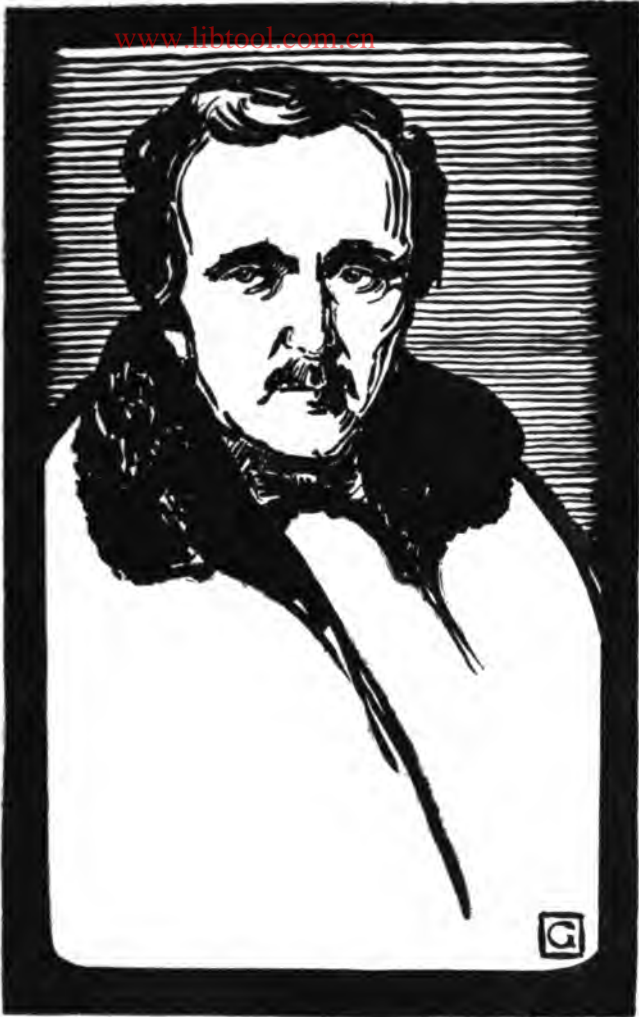
EDGAR ALLAN POE