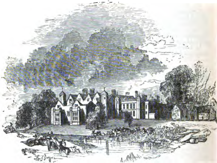
CHARLECOTE HOUSE FROM THE AVON.