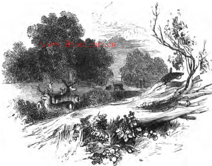
THE FOREST OF ARDEN.