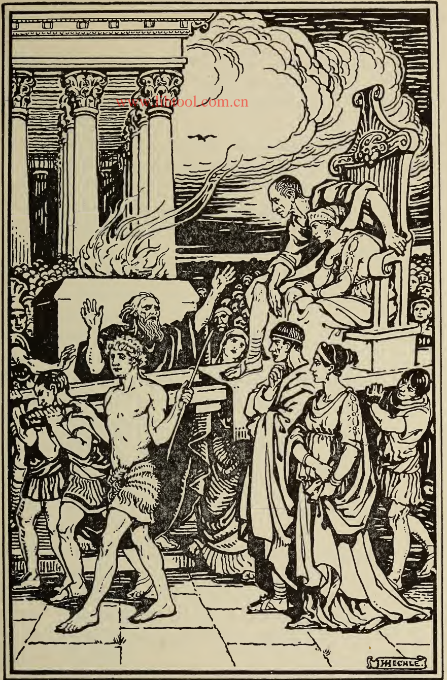
Soothsayer. "Beware the Ides of March."