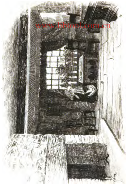
Room in which Kaffer's house was born