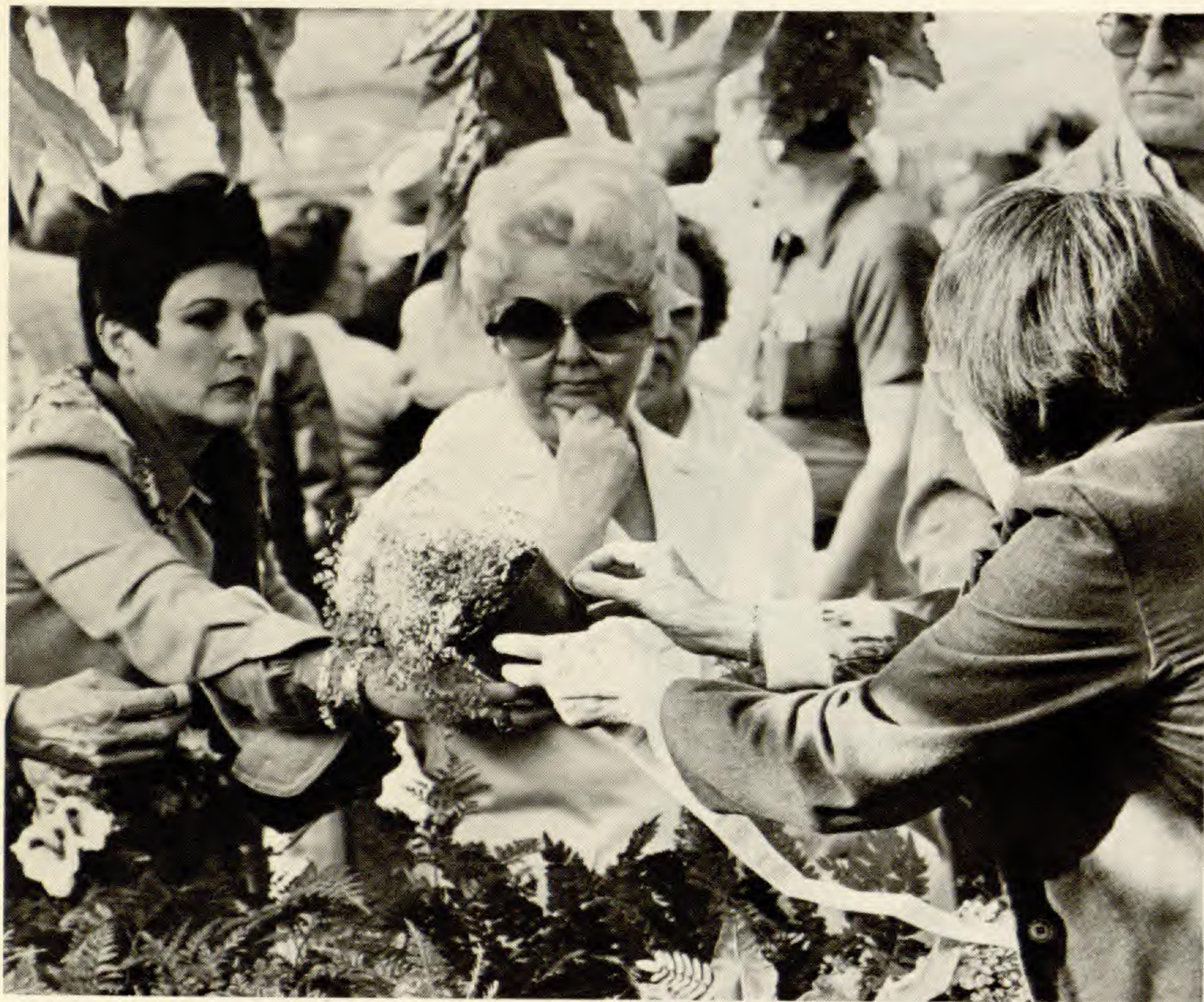
Sales were brisk in the fern section where all forms from hanging baskets to small potted types were soon claimed.