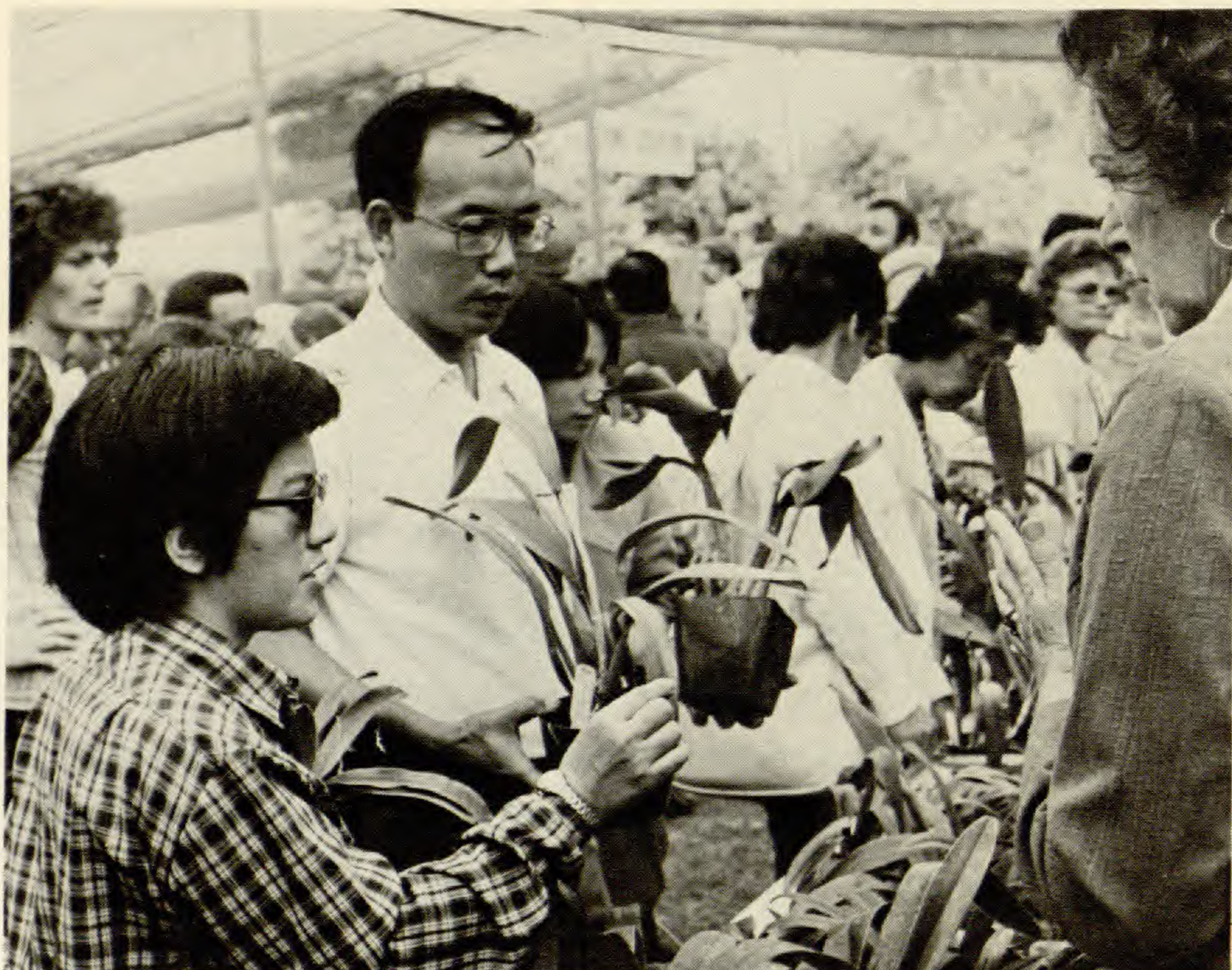
Cattleya orchid fanciers had several hundred different hybrids and size plants from which to choose.