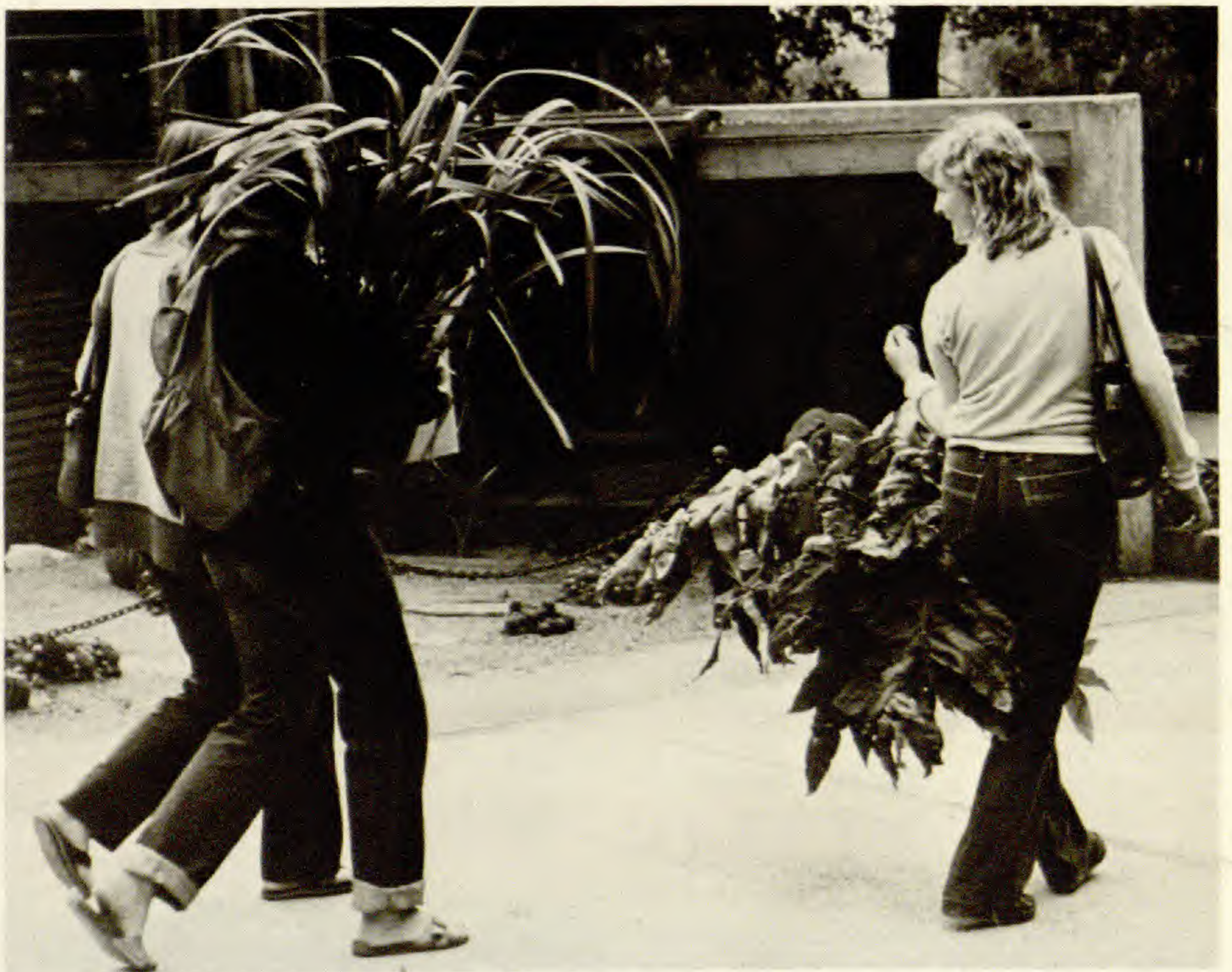
Large, dramatic plants like these cymbidiums (left) and staghorn fern (Platynerium) were among the first to be chosen at the plant sale.