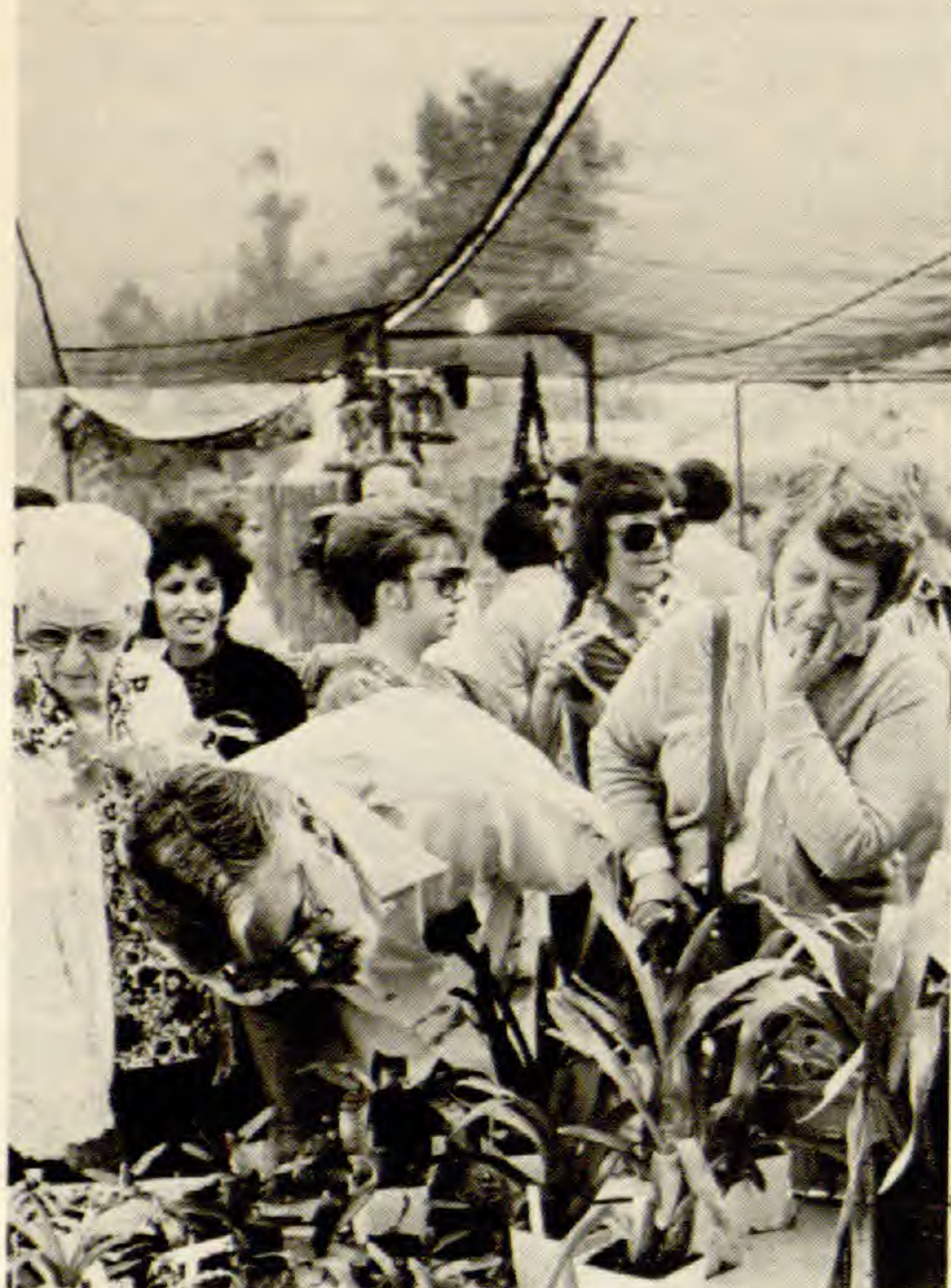
Will it bite? There seems to be some doubt regarding the life form of the Living Sculpture display.