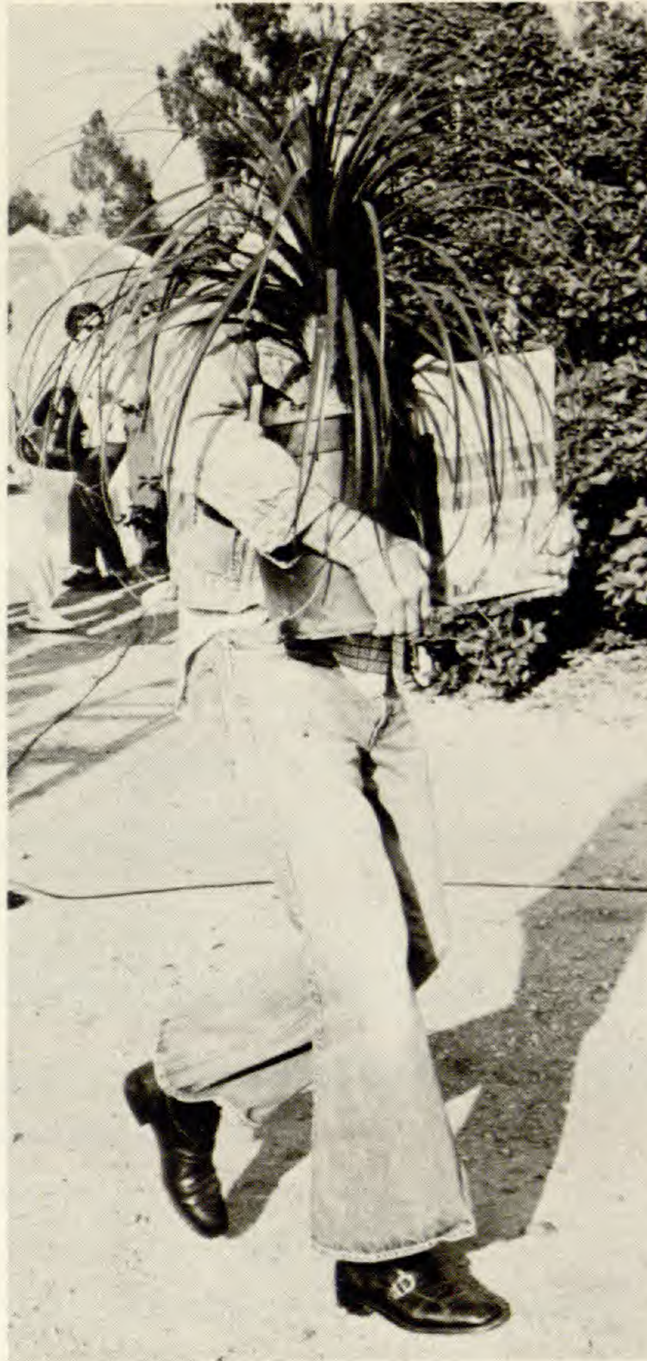
The excitement of owning a rare plant like this black boy (Xanthorrhoea quadrangulata) seemed to make vision a secondary consideration.