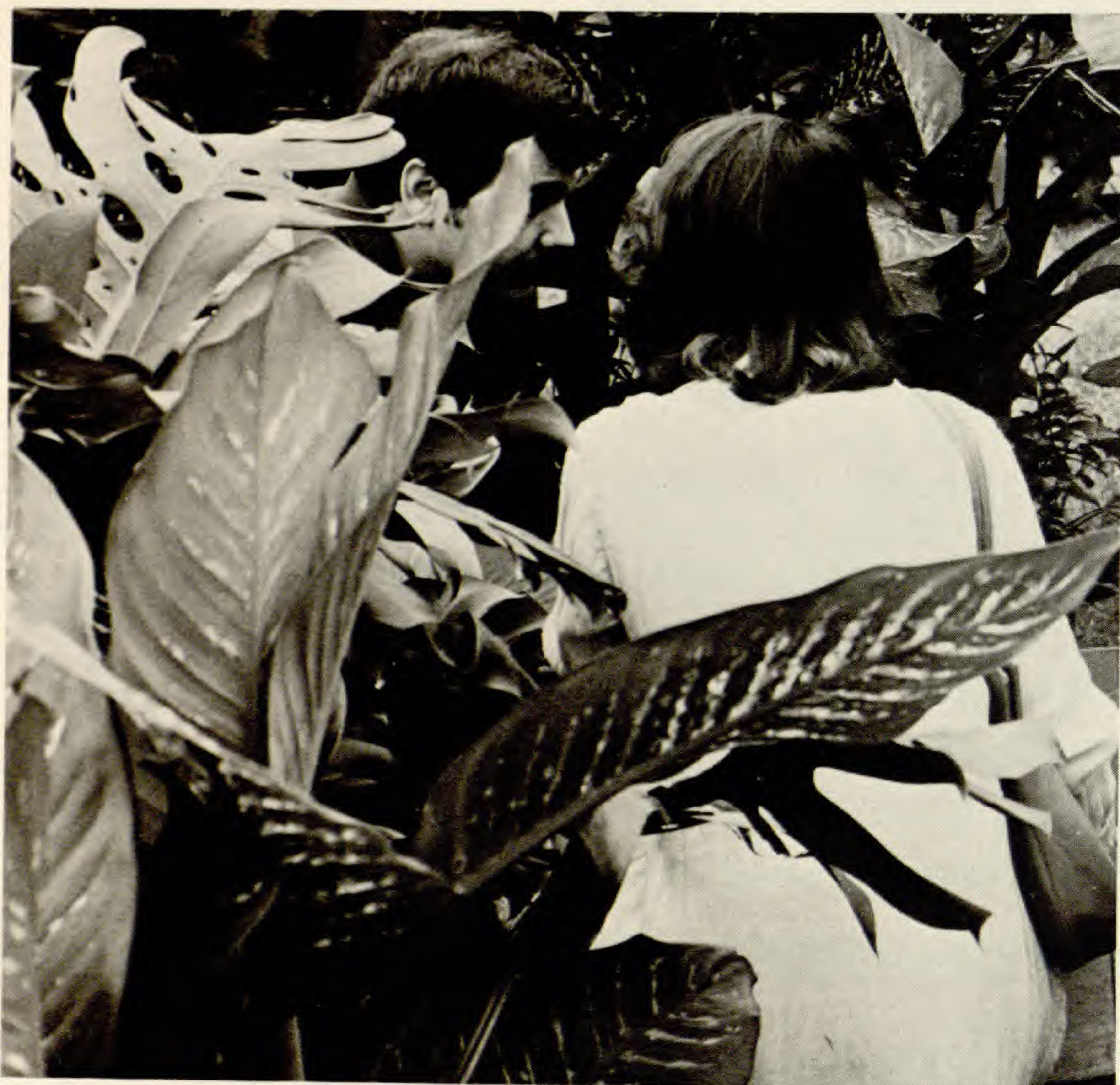
Dieffenbachia, philodendrons, and Ficus lyrata form the luxuriant setting for this intense discussion.