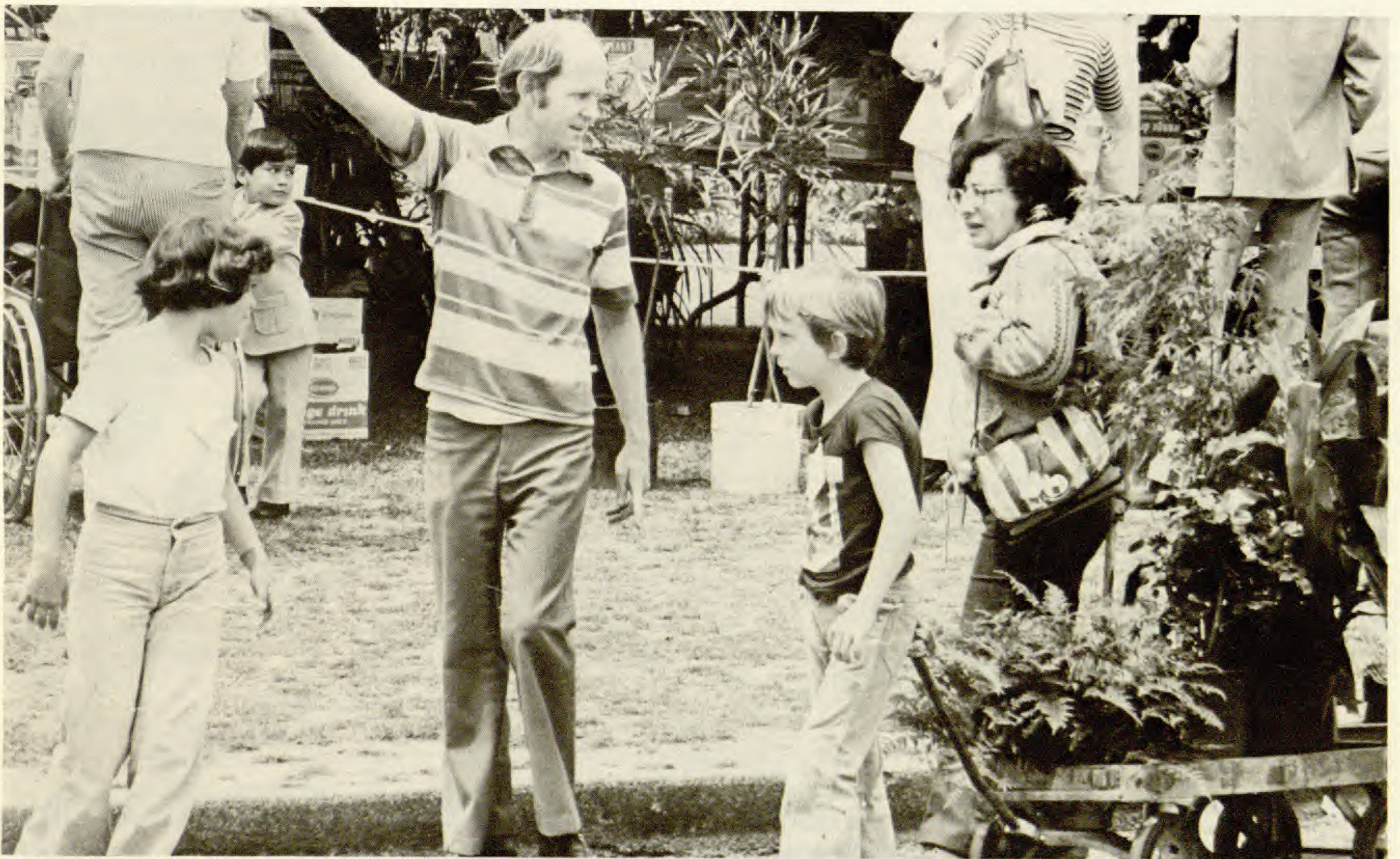
Onward! This well organized group came equipped with a dual transport system, a plan for action, and an expedition leader.