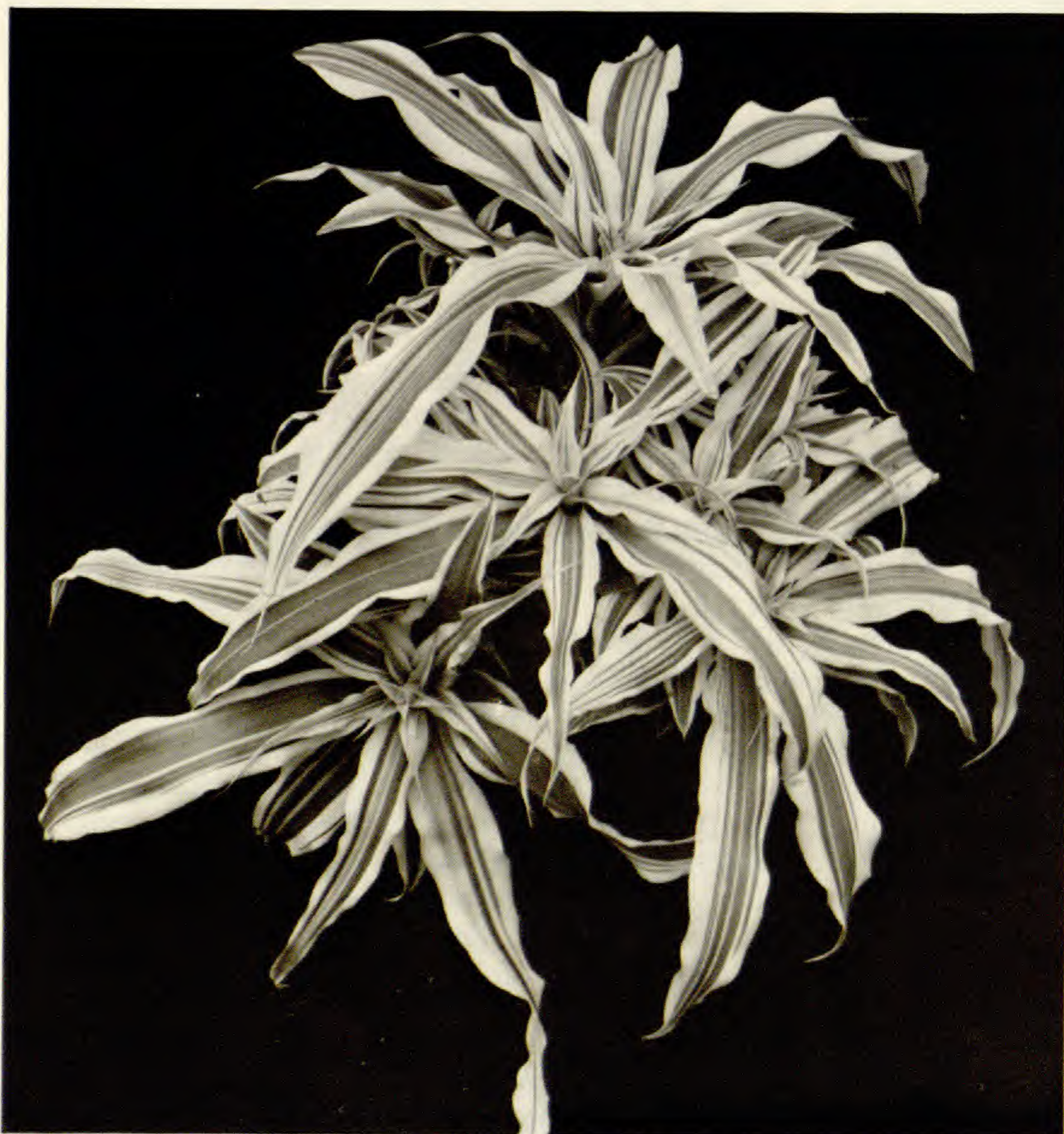
Cryptanthus bromelioides 'Tricolor.'

for most of the day to maintain or increase their color.