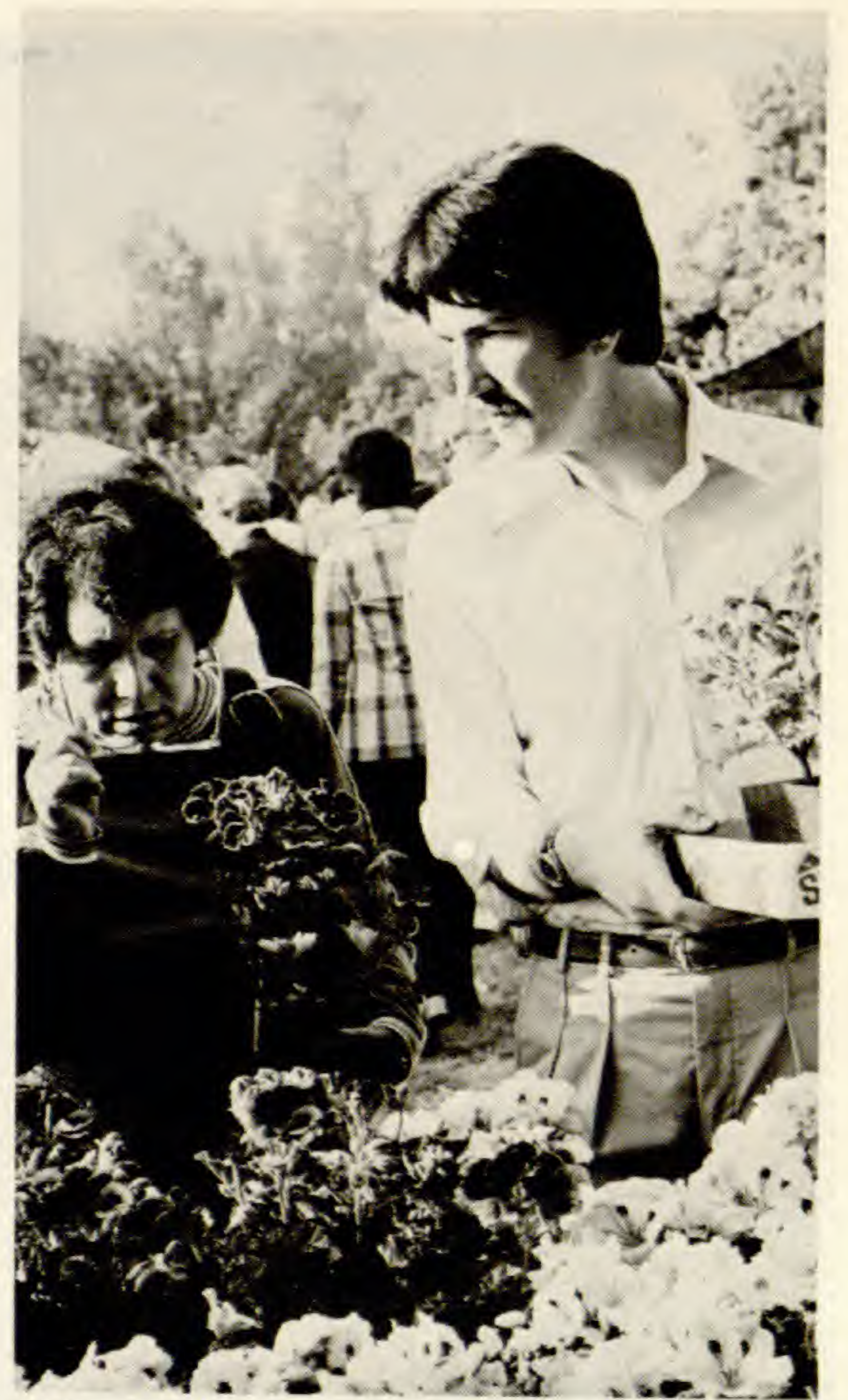
The wide selection of fancy pelargonium varieties made it hard for some shoppers to narrow the choice.