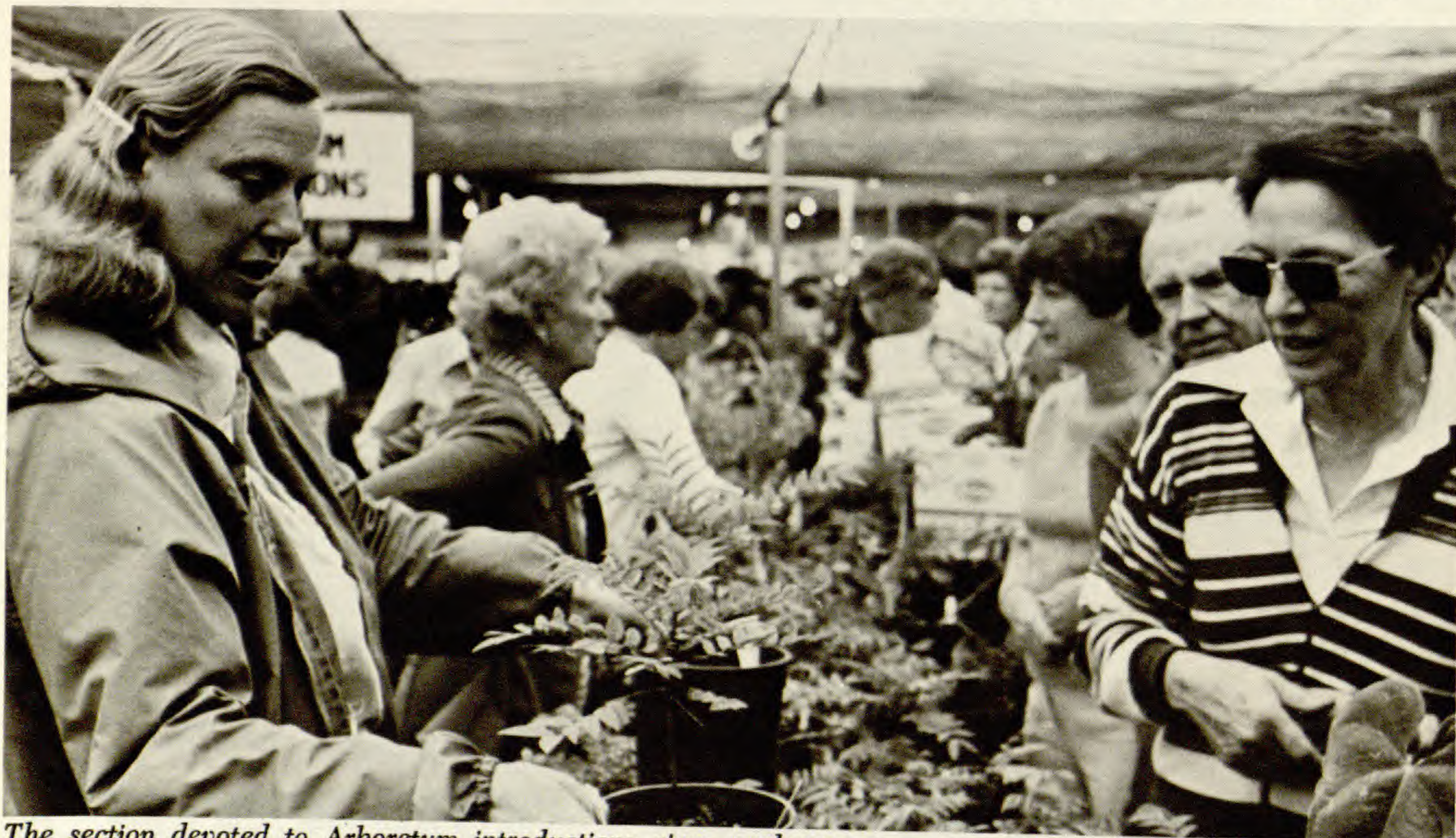
The section devoted to Arboretum introductions gives gardeners an opportunity to obtain unusual plants like these gold madallion trees ( Cassia leptophylla ) before the introductions are widely available in the nursery trade.