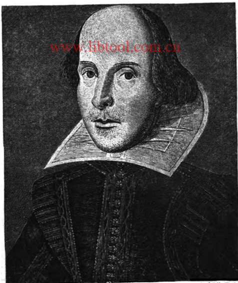
Portrait from First Folio. by Martin Droeshout.