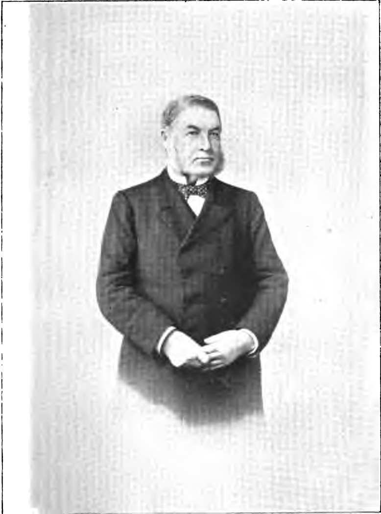
Hon. Sir Charles Tupper, Bart , G.C.M.G., C.B., D.C.L., High Commissioner for Canada, London, England.