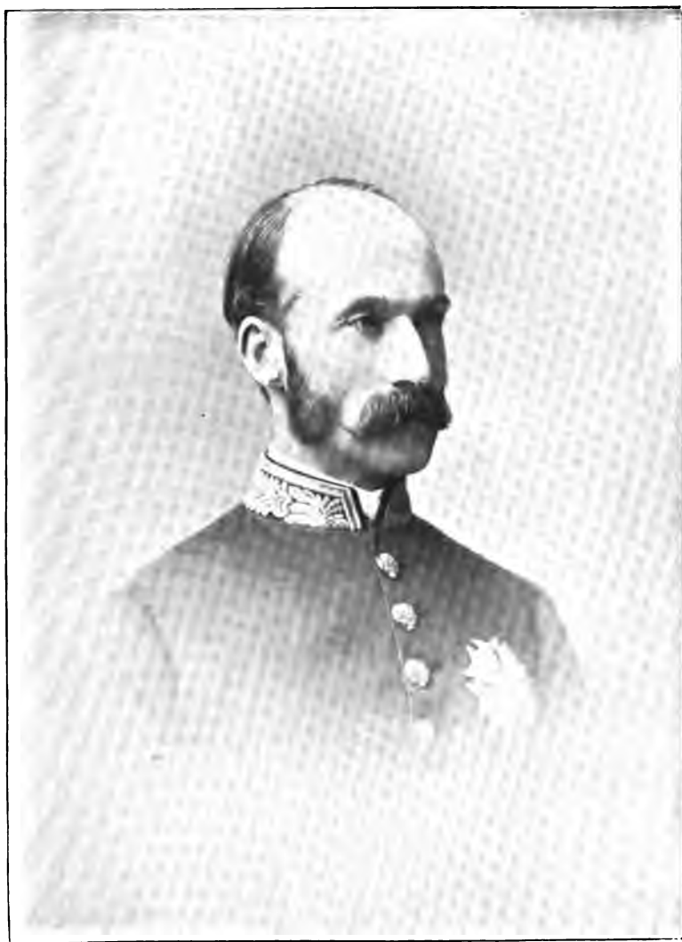
The Marquis of Lansdowne.