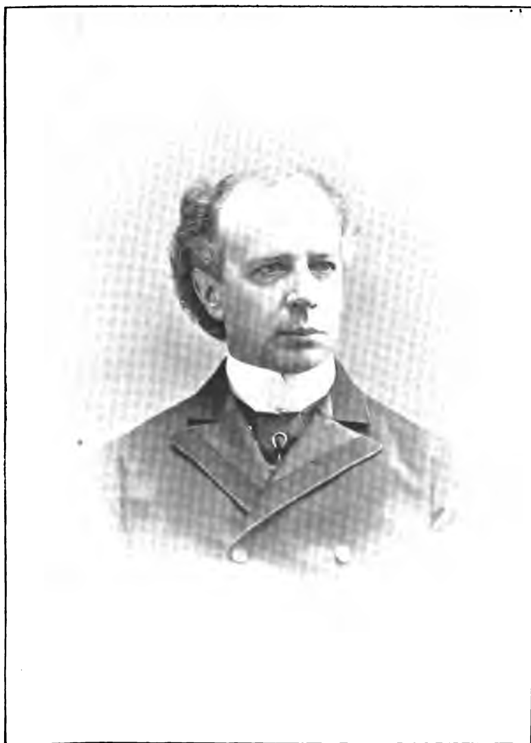
Hon. Wilfrid Laurier, B.C.L., Q.C.