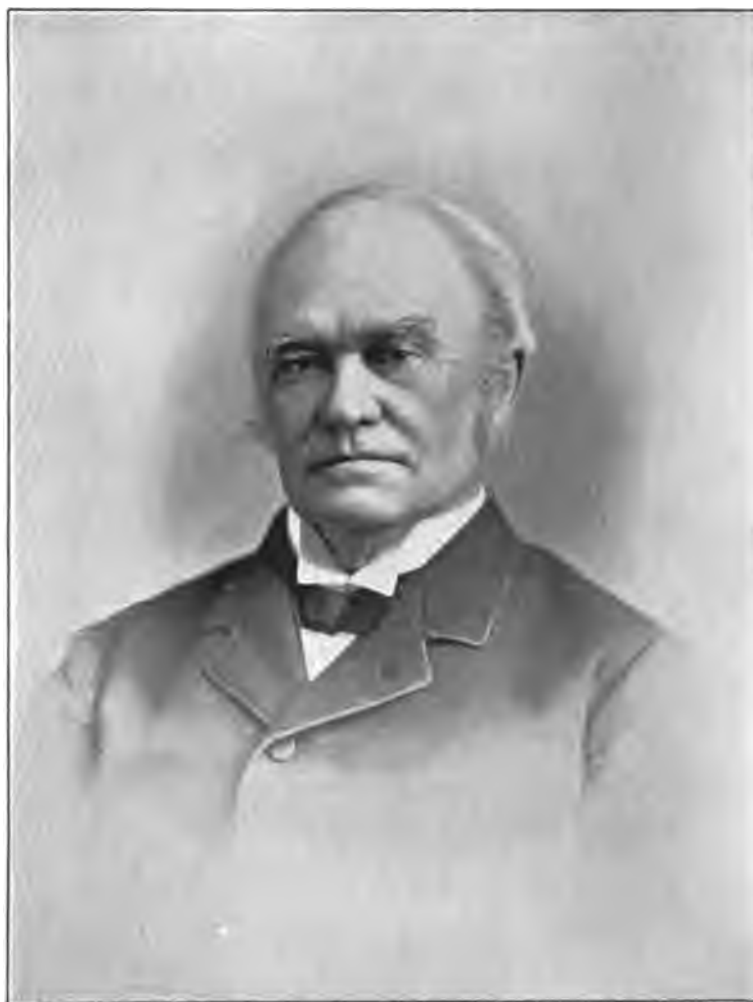
Sir John J. Caldwell Abbott, K.C.M.G., P.C., D.C.L.