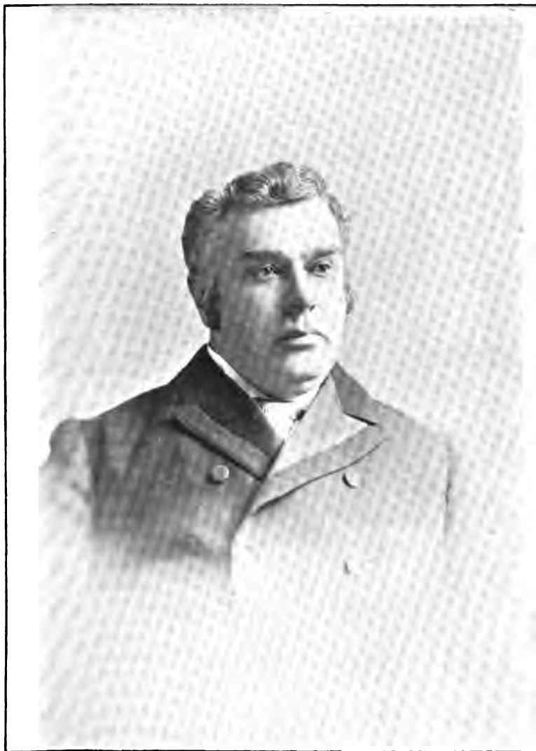
Right Hon. Sir John S. D. Thompson, K.C.P.G., LL.D., Q.C., P.C.