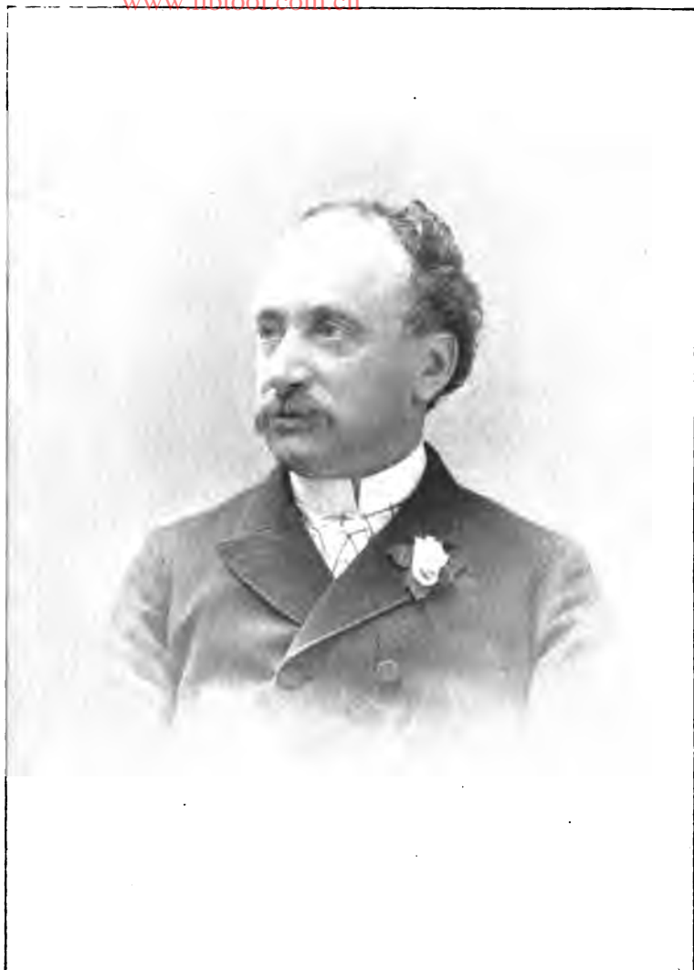
Hon. W. E. Sanford, Senator.