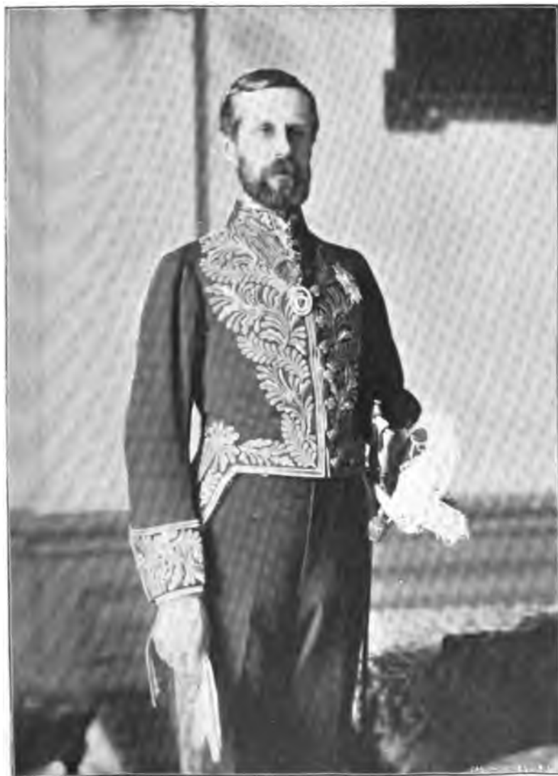
Earl of Aberdeen, Governor-General of Canada.