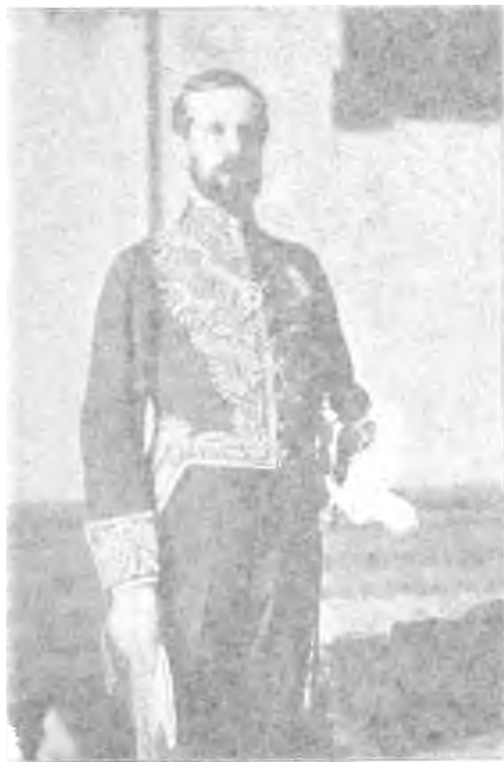
Lord of Aberdeen,