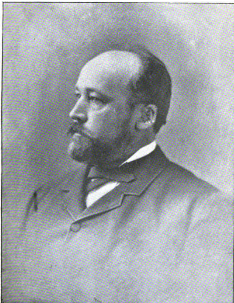
Sir William C. Van Horne, K.C.M.G.