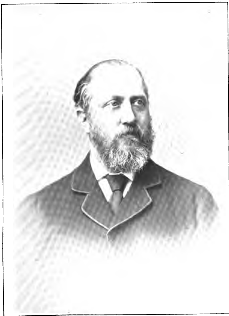
Lord Stanley of Preston, G.C.B., P.C. (Now Lord Derby.)