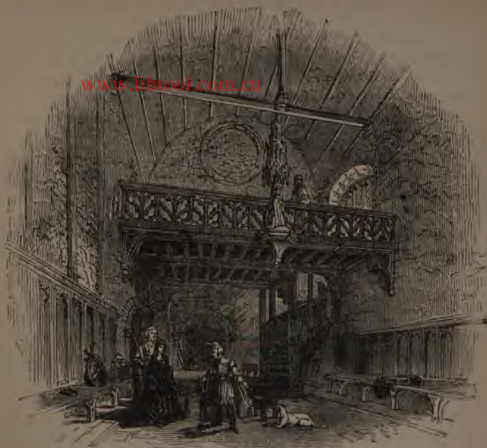
INTERIOR OF PALACE IN ROUSILLON.