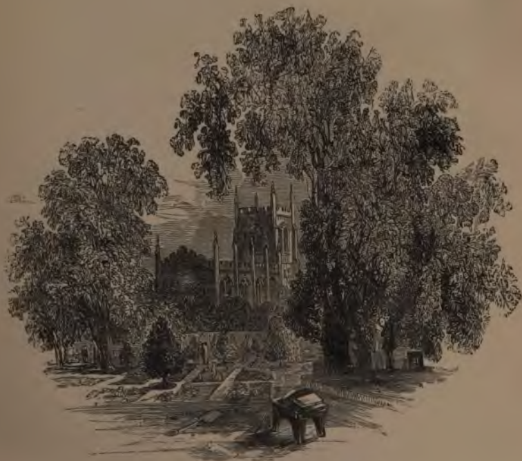
SHAKESPEARE'S GARDEN AT NEW PLACE.