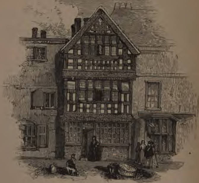
OLD HOUSE IN HIGH STREET, STRATFORD.