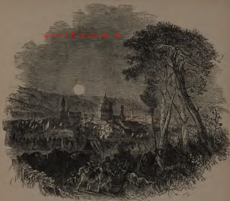
FLORENTINE CAMP AND GENERAL VIEW OF FLORENCE.