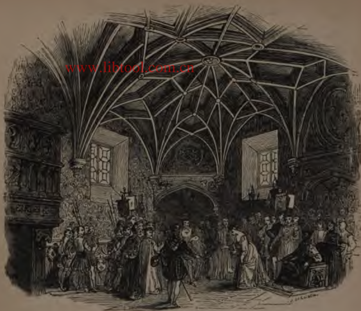
INTERIOR OF THE LOUVRE.