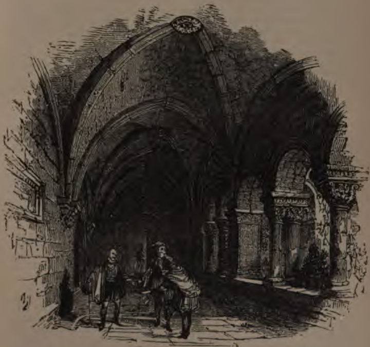
COURT OF COUNTESS'S PALACE—PAROLLES AND CLOWN (v. 2).