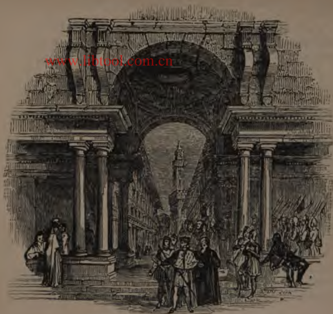
COURT OF THE DUKE'S PALACE, FLORENCE.