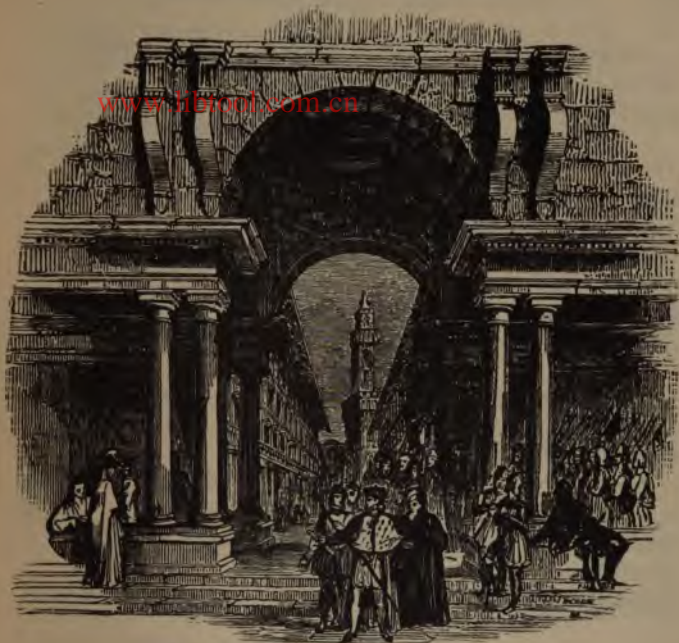
COURT OF THE DUKE'S PALACE, FLORENCE.