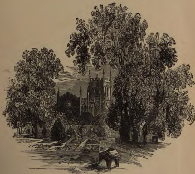
SHAKESPEARE'S GARDEN AT NEW PLACE.