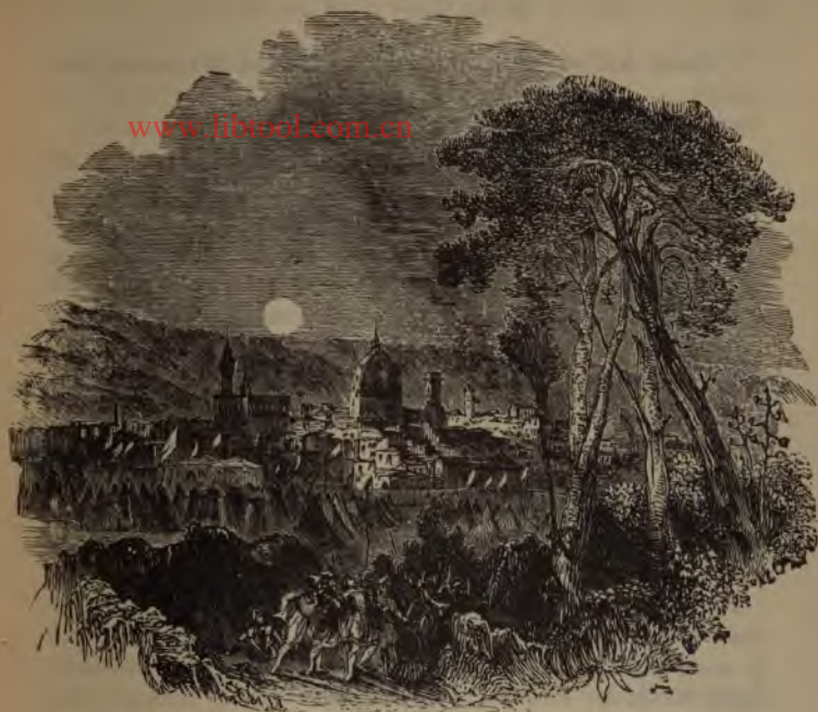
FLORENTINE CAMP AND GENERAL VIEW OF FLORENCE.