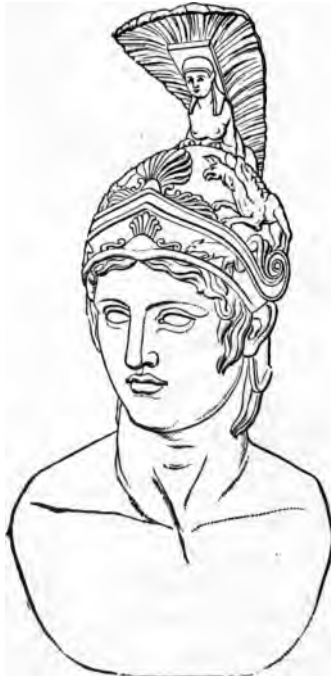
"Great Mars, I put myself into thy file" (iii. 3. 9).

yet I pray you, 172. yet (transposed), 179. yield, 157.