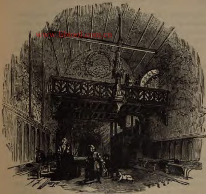
INTERIOR OF PALACE IN ROUSILLON