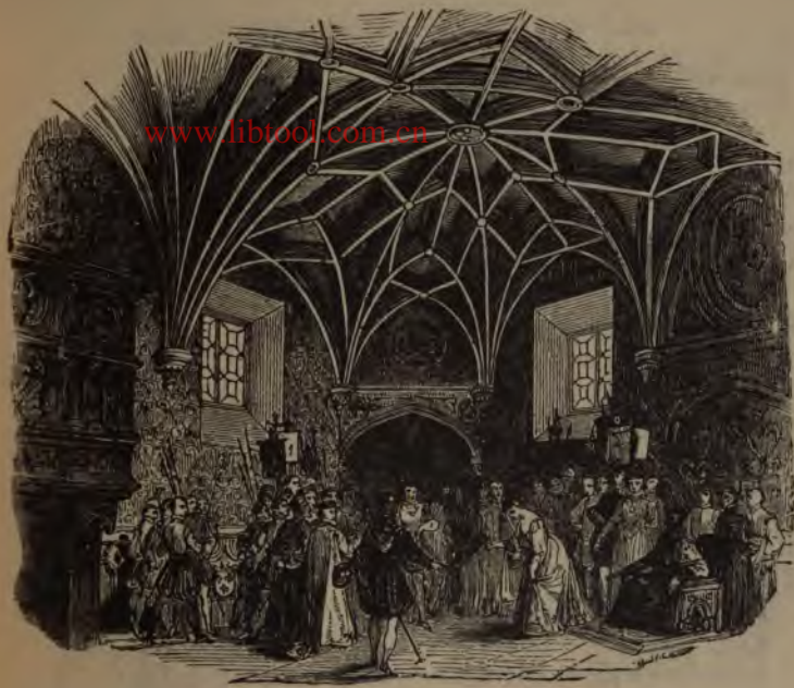
INTERIOR OF THE LOUVRE.