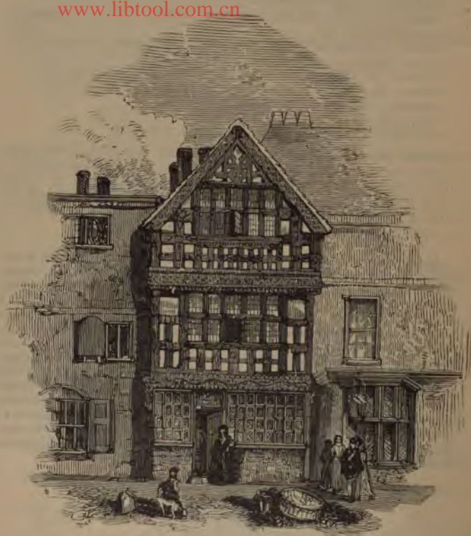
OLD HOUSE IN HIGH STREET, STRATFORD.