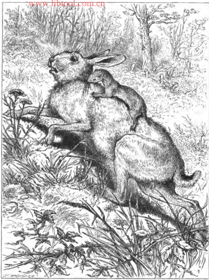
WEASEL KILLING A HARE.—(PAGE 63.)