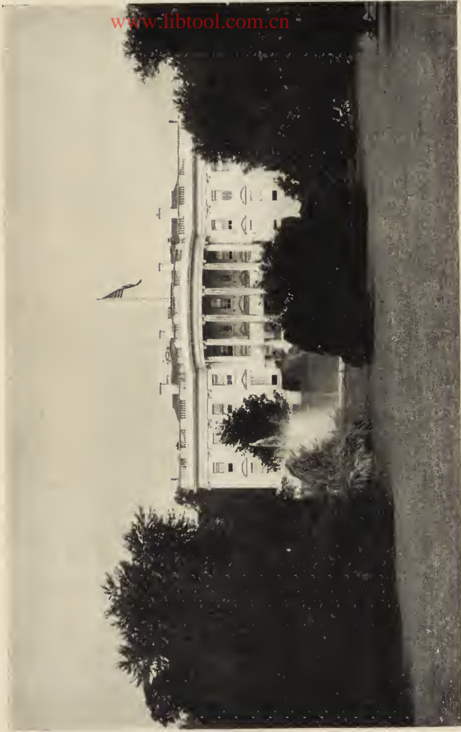
THE WHITE HOUSE