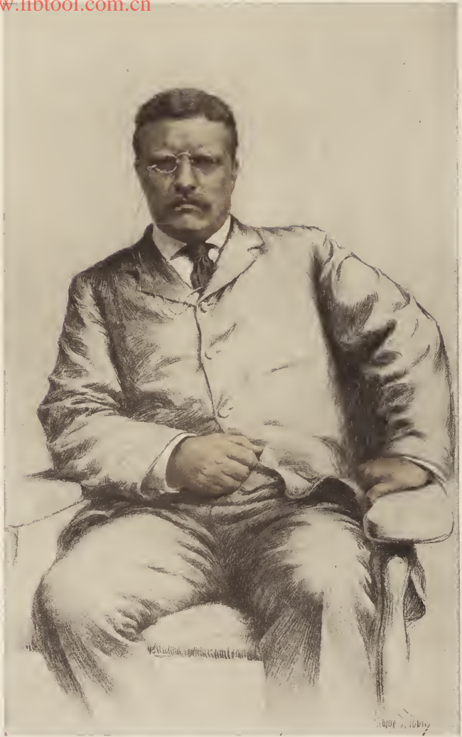
THEODORE ROOSEVELT PRESIDENT OF THE UNITED STATES DRAWN BY GEORGE T. TOBIN