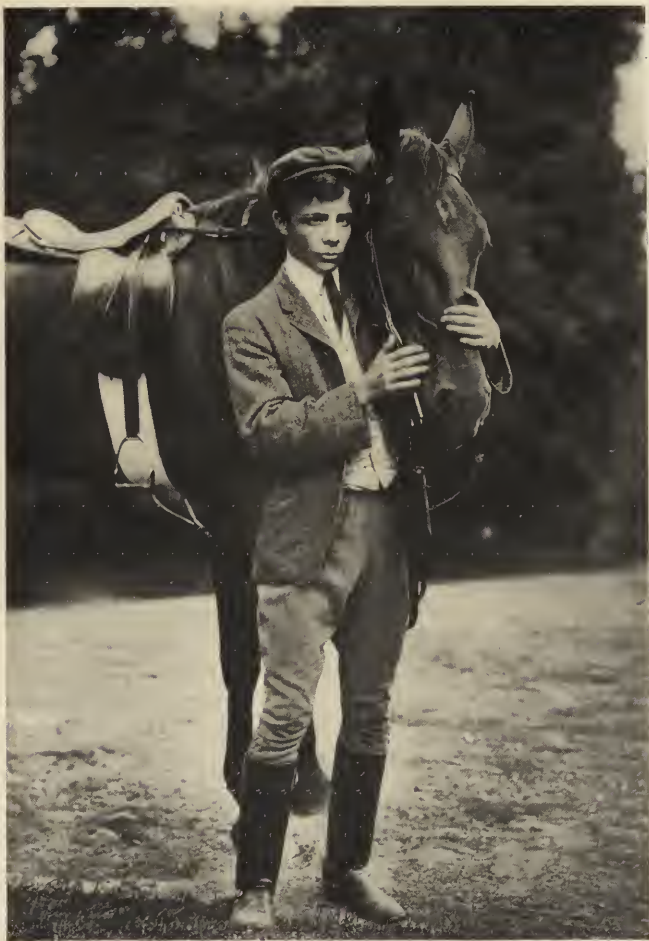
THEODORE ROOSEVELT, JR.