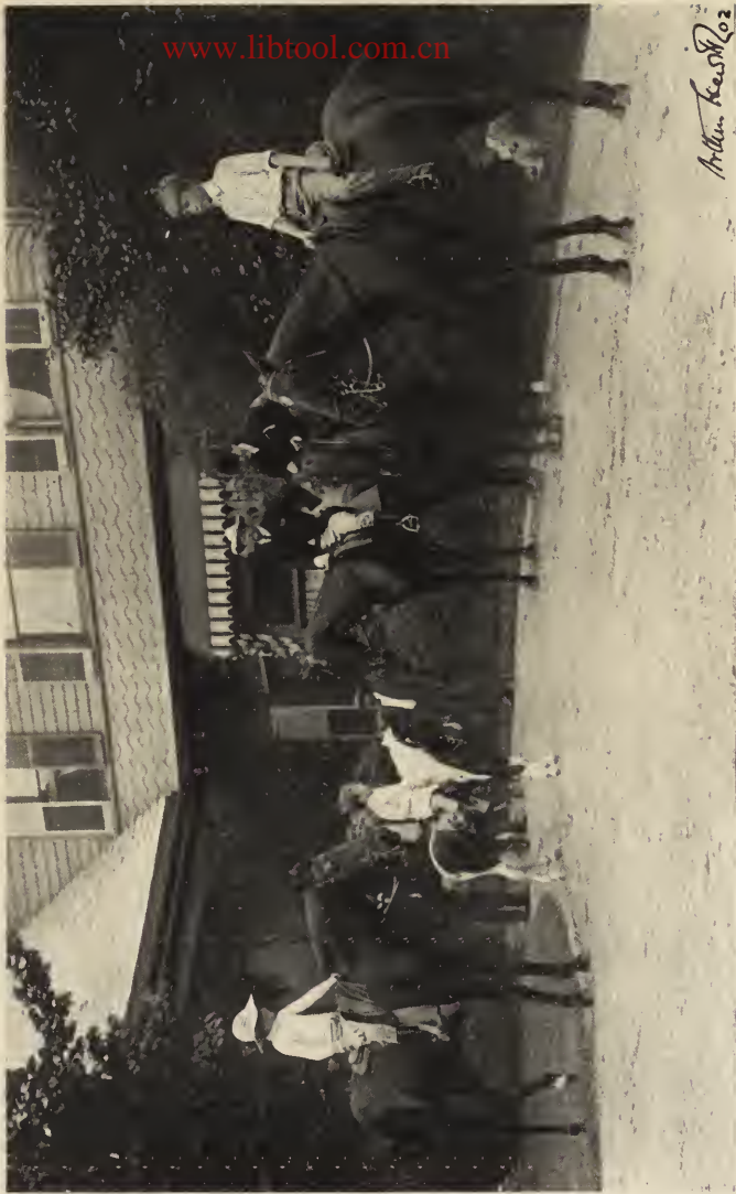
THE MORNING RIDE AT SAGAMORE HILL