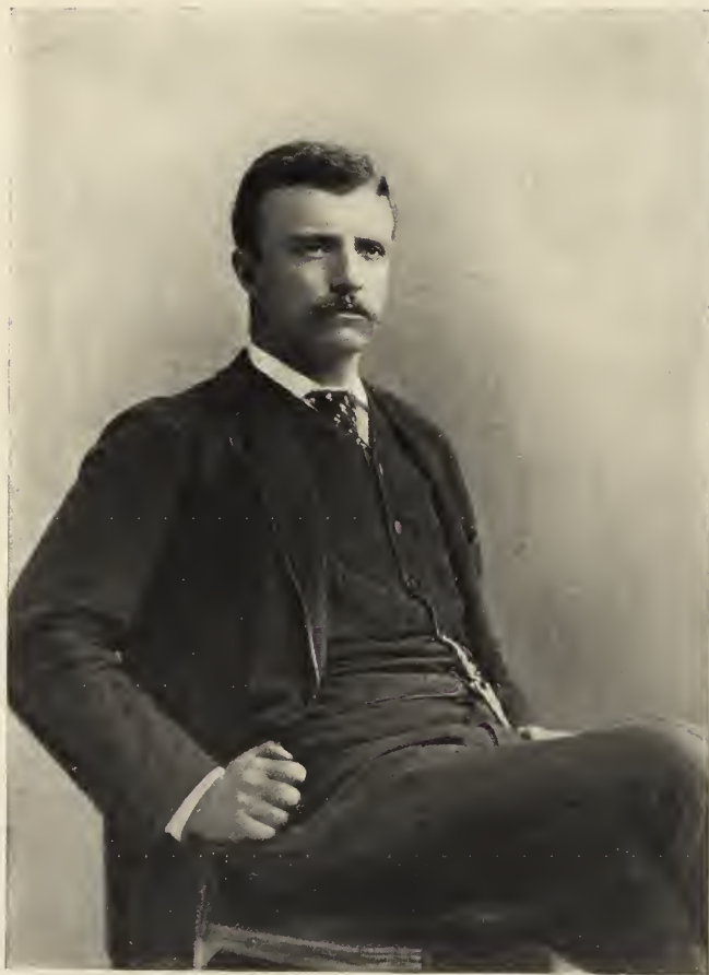
THEODORE ROOSEVELT AS CANDIDATE FOR MAYOR OF NEW YORK CITY