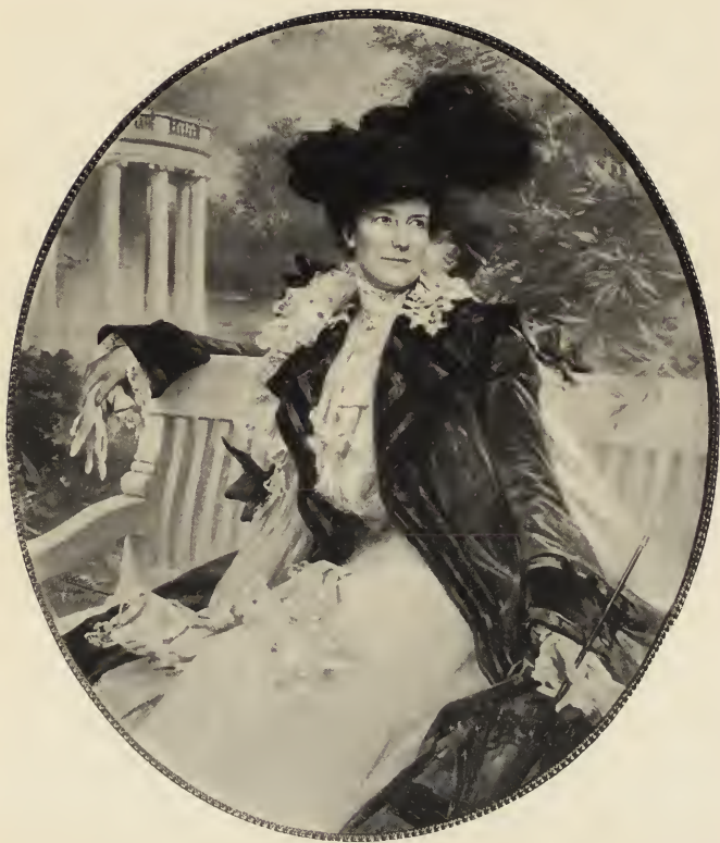
MRS. THEODORE ROOSEVELT FROM THE PORTRAIT BY THEOBALD CHARTRAN