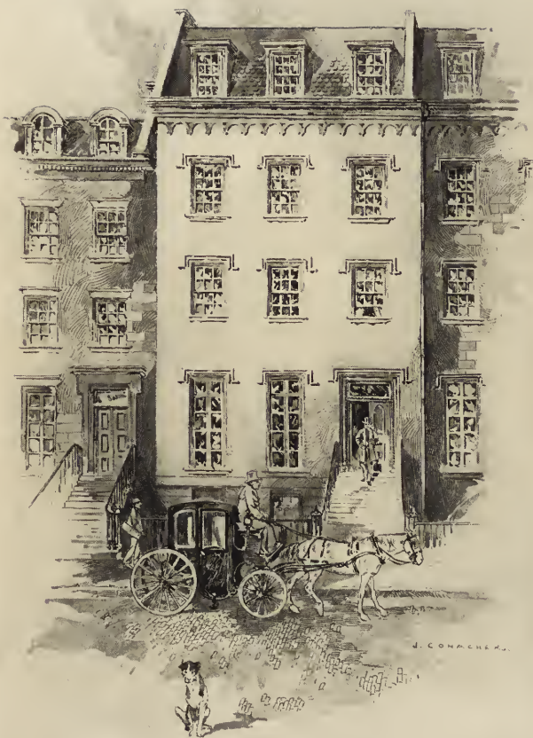
THEODORE ROOSEVELT'S BIRTHPLACE, IN NEW YORK