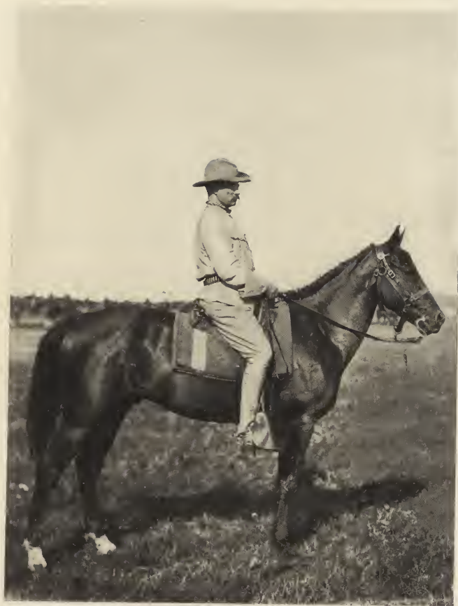
THEODORE ROOSEVELT, COLONEL OF THE ROUGH-RIDERS