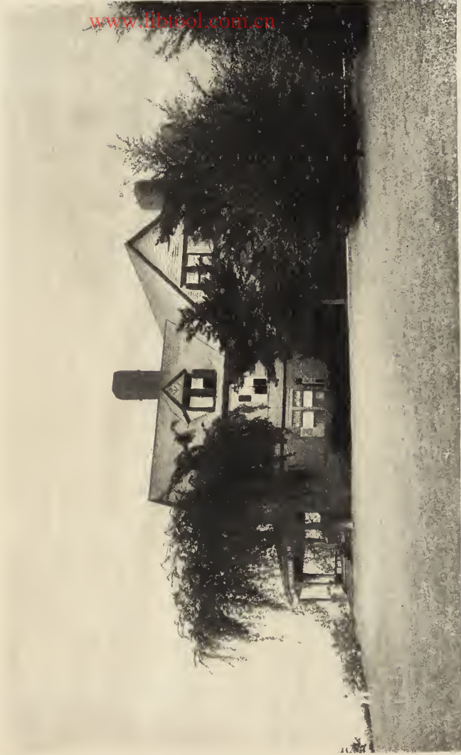
SAGAMORE HILL THEODORE ROOSEVELT'S SUMMER HOME AT OYSTER BAY