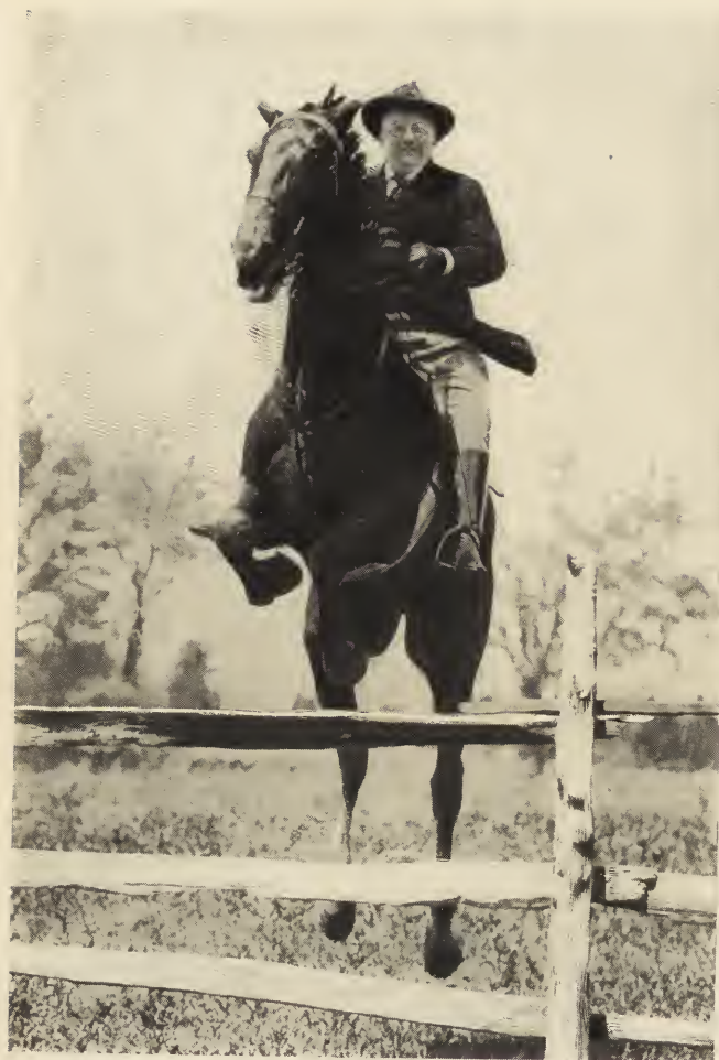
THEODORE ROOSEVELT JUMPING HURDLES AT CHEVY CHASE CLUB, WASHINGTON