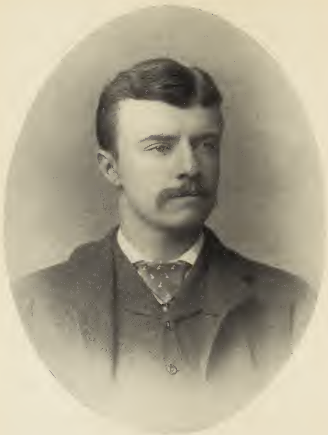
THEODORE ROOSEVELT AS A HARVARD SENIOR