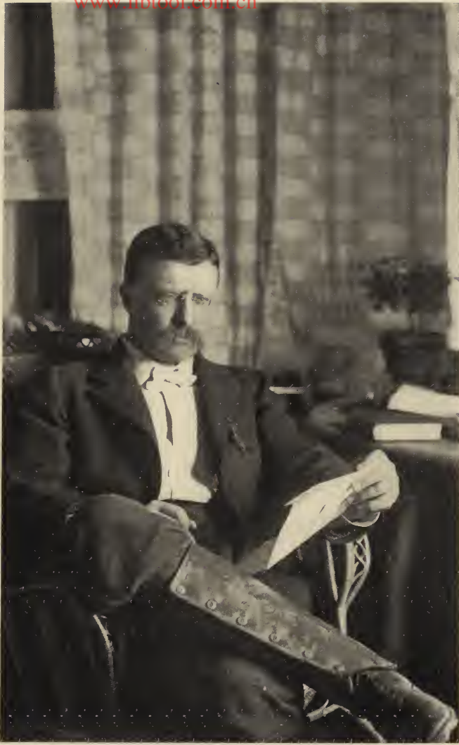
THEODORE ROOSEVELT AT SAGAMORE HILL