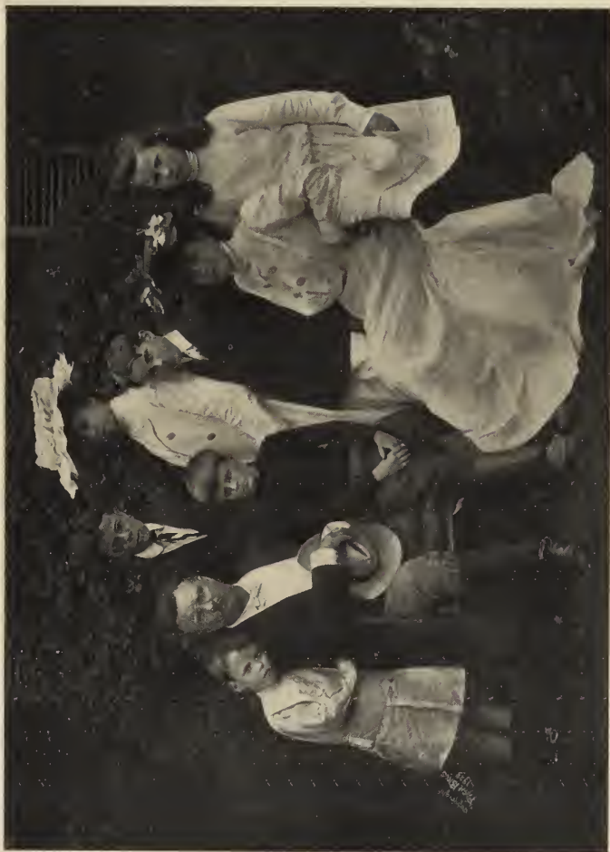
THEODORE ROOSEVELT AND HIS FAMILY AT OYSTER BAY