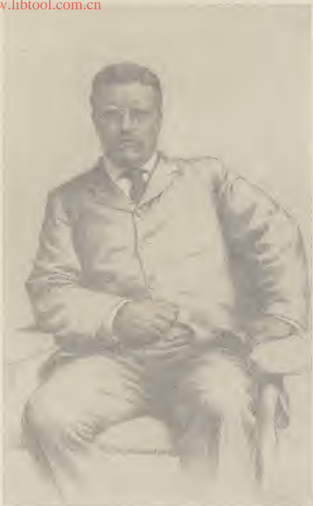
THEODORE ROOSEVELT PRESIDENT OF THE UNITED STATES DRAWN BY GEORGE T. TOBIN