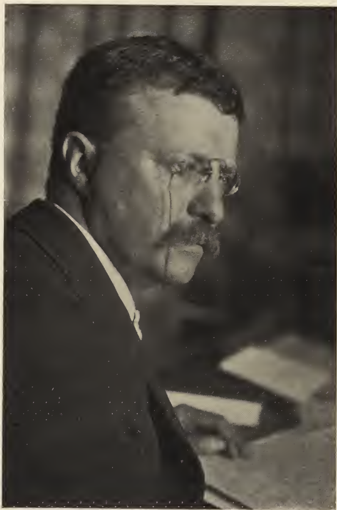
THEODORE ROOSEVELT AS VICE-PRESIDENT