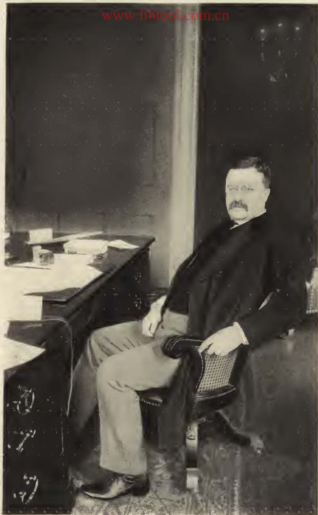
PRESIDENT ROOSEVELT AT HIS DESK IN THE EXECUTIVE OFFICE