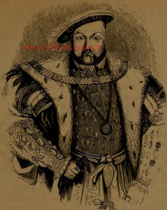
KING HENRY VIII.