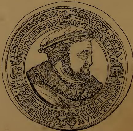
GOLD MEDAL OF HENRY VIII

'Tis ten to one, this play can never please All that are here. Some come to take their ease, And sleep an act or two ; but those, we fear, We've frighted with our trumpets ; so, 'tis clear, They'll say 'tis naught : others, to hear the city Abus'd extremely, and to cry, " That's witty," Which we have not done neither : that, I fear, All the expected good we're like to hear For this play, at this time, is only in The merciful construction of good women ; For such a one we show'd 'em. If they smile And say 'twill do, I know within a while All the best men are ours ; for 'tis ill hap, If they hold when their ladies bid 'em clap.