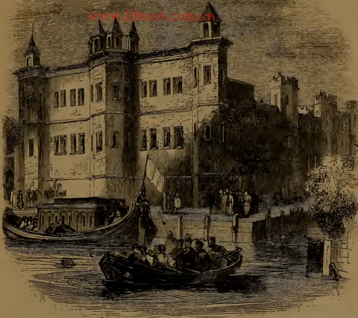
PALACE AT BRIDEWELL.