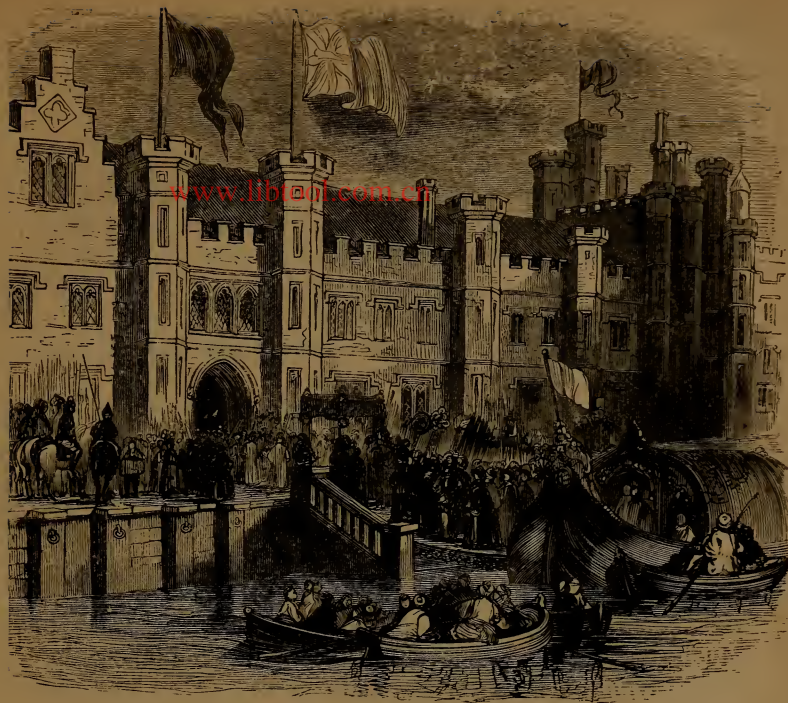
PALACE AT GREENWICH. RETURNING FROM THE CHRISTENING.