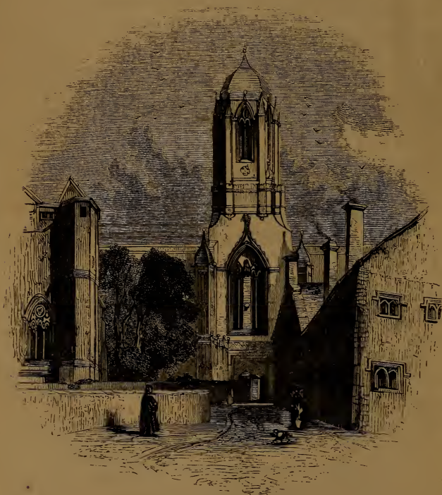
CHRIST CHURCH, OXFORD.

I can no more. www.libtool.com.c [Exeunt, leading Katherine