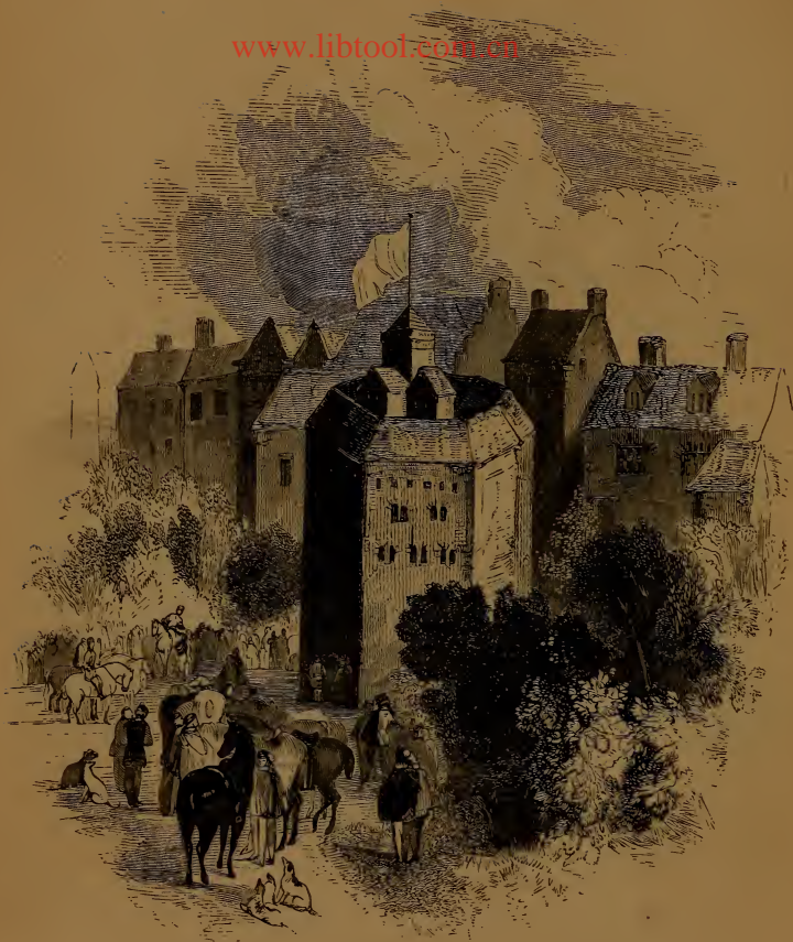
THE GLOBE THEATRE.