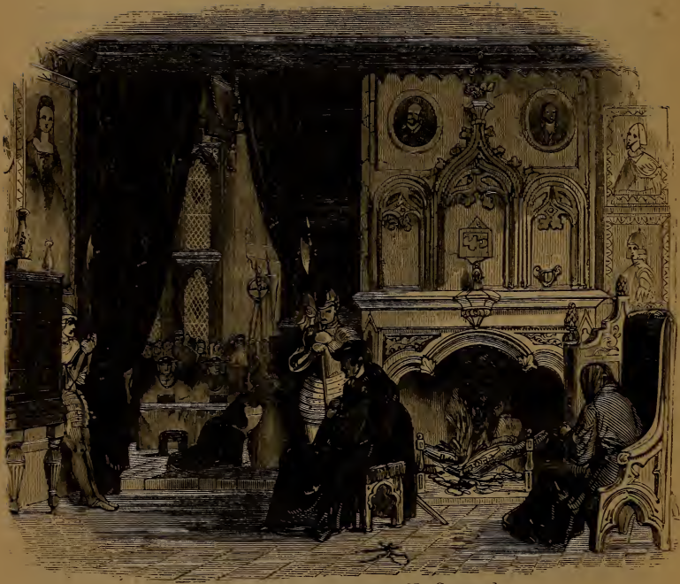
HALL IN BLACK-FRIARS [Act II., Scene 4].