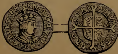
WOLSEY'S HALF GROAT.

Nor is the change in our feelings toward them, after their fall, merely an effect passing within ourselves : it proceeds, in part, upon a disclosure and outcoming of somewhat in them that was before hidden or stifled beneath the superinducings of place and circumstances ; it is the seeing what they really are, and not merely the considering what they have lost, that now moves us to do them reverence ; for those elements which, stimulated into an usurped predominance by the subtly-working drugs of flattery and pride, before made them hateful and repulsive, are now overmastered by the stronger elements of good that have their dwelling in them. And because this is real and true, exaltation springs up as the natural consequence of their overthrow ; therefore it is that from the ruins of their fallen state the poet builds "such noble scenes as draw the eye to flow."