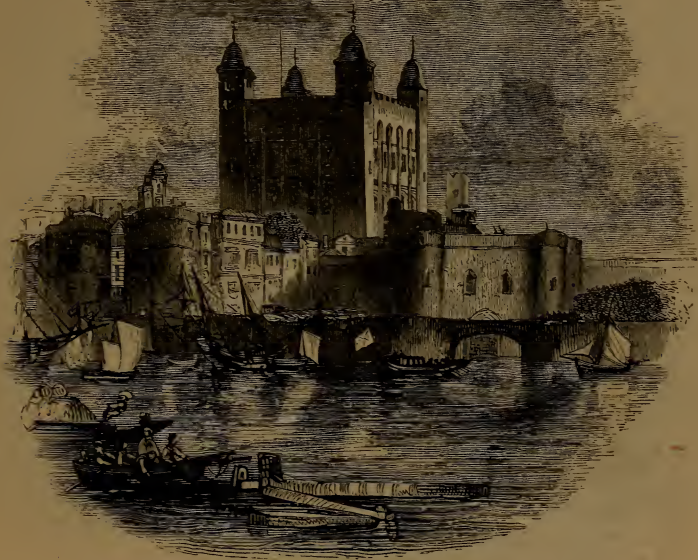
THE TOWER FROM THE THAMES.