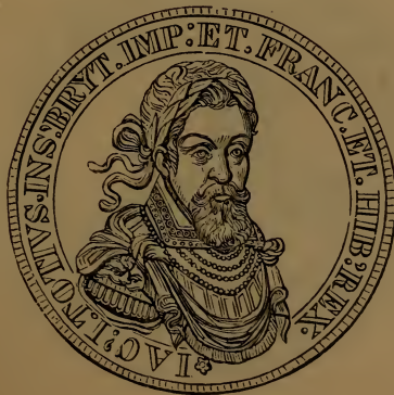
MEDAL OF JAMES I.