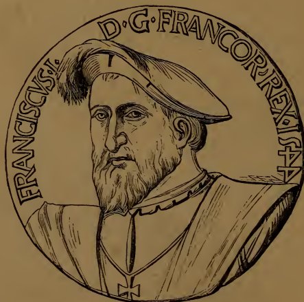
MEDAL OF FRANCIS I.