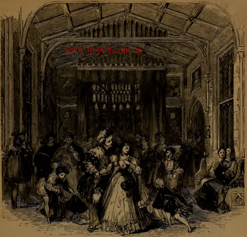
PRESENCE-CHAMBER IN YORK-PLACE.