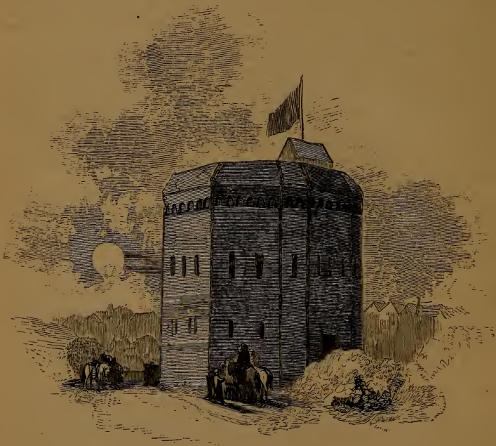
THE BEAR GARDEN.

SCENE III.— Parish Garden. The vulgar pronunciation of Paris Garden. "This celebrated bear-garden on the Bankside was so called from