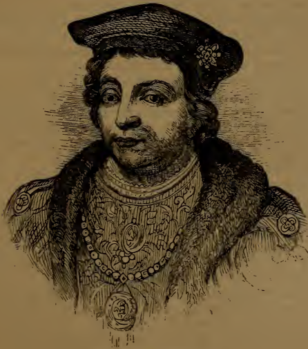
DUKE OF BUCKINGHAM.

Whose figure even this instant cloud, etc. "Whose" refers to "Buckingham," not to "shadow." "The speaker says that his life is cut short already, and that what they see is but the shadow of the real Buckingham, whose figure is assumed by the instant [the present, the passing] cloud