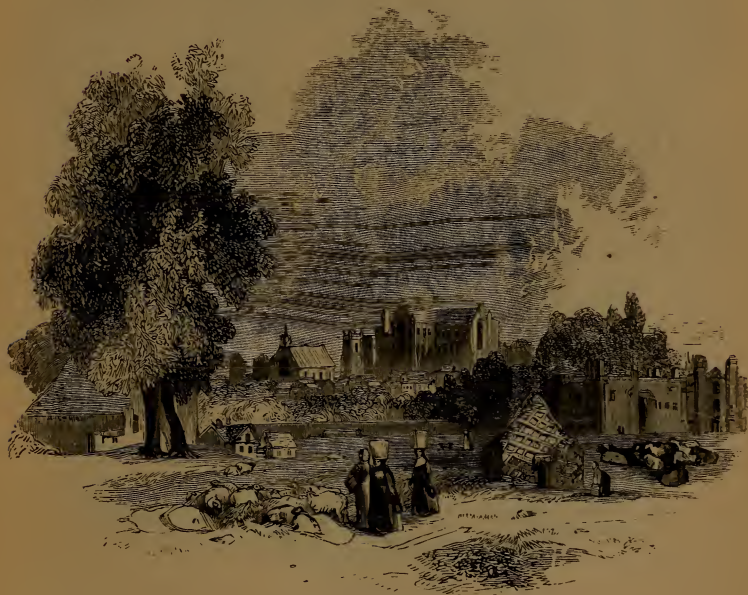
ST. JAMES'S AND WESTMINSTER.

If they smile, etc. Steevens remarks that we have the same thought in the Epilogues to A. Y. L. and 2 Henry IV.