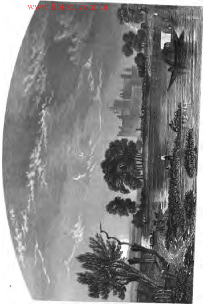
View of the Pacific Ocean