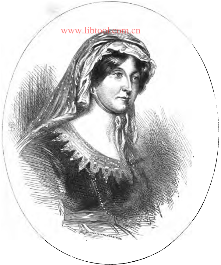
THE BARONESS NAIRNE.