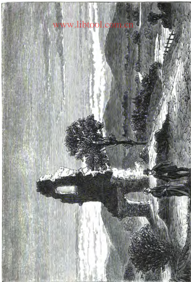
RUIN OF GASCON HALL, PENTHSHIRE.