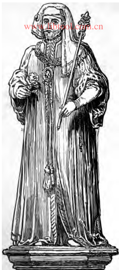
KING HENRY IV