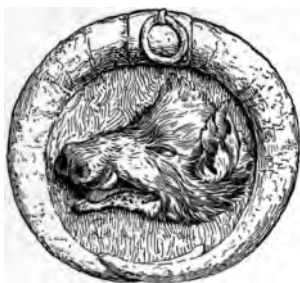
THE BOAR'S HEAD