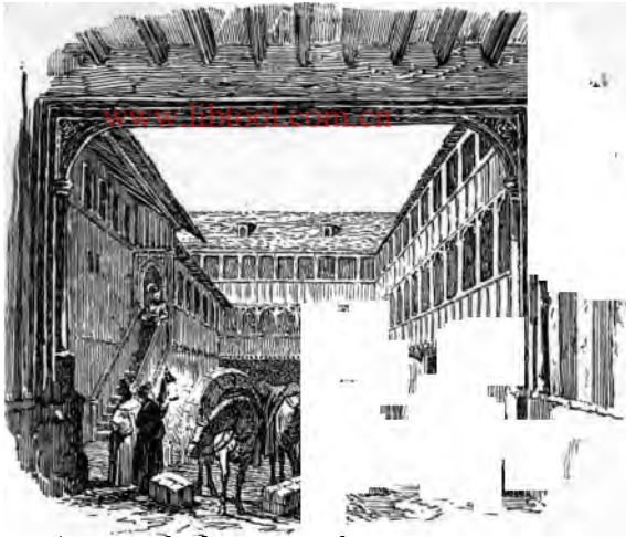
ANCIENT INN YARD