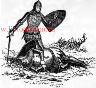
PRINCE HAL AND FALSTAFF