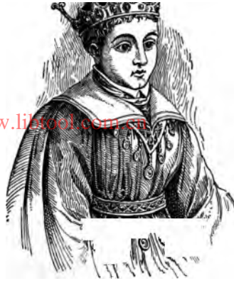
HENRY OF MONMOUTH