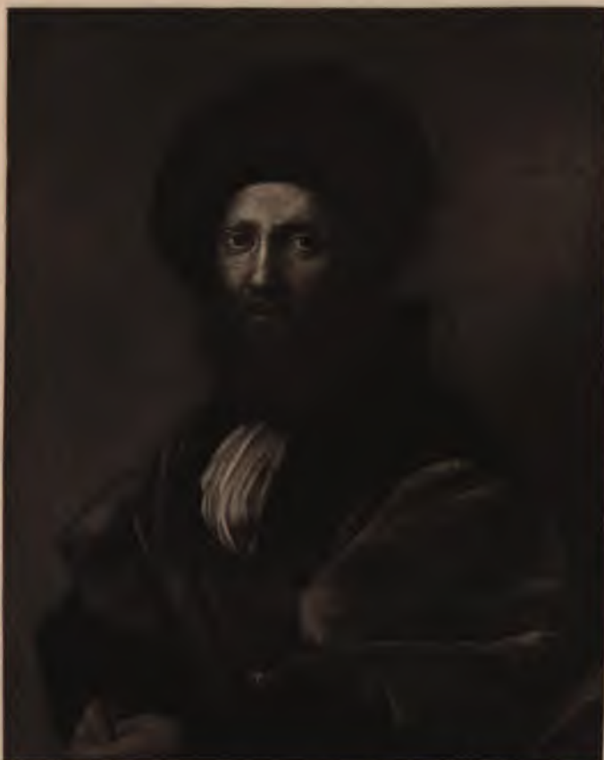
Count Baldassarre Castiglione by Raphael. (Louvre)