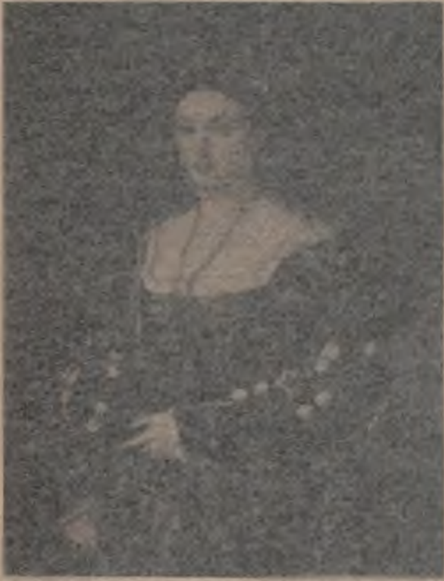
Isabella Bouzaga, Duchess of Arma by -Stim, 1870