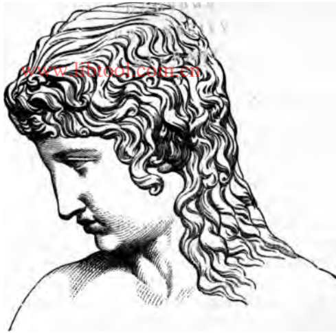
HEAD OF EROS (CUPID), FROM THE ANTIQUE.