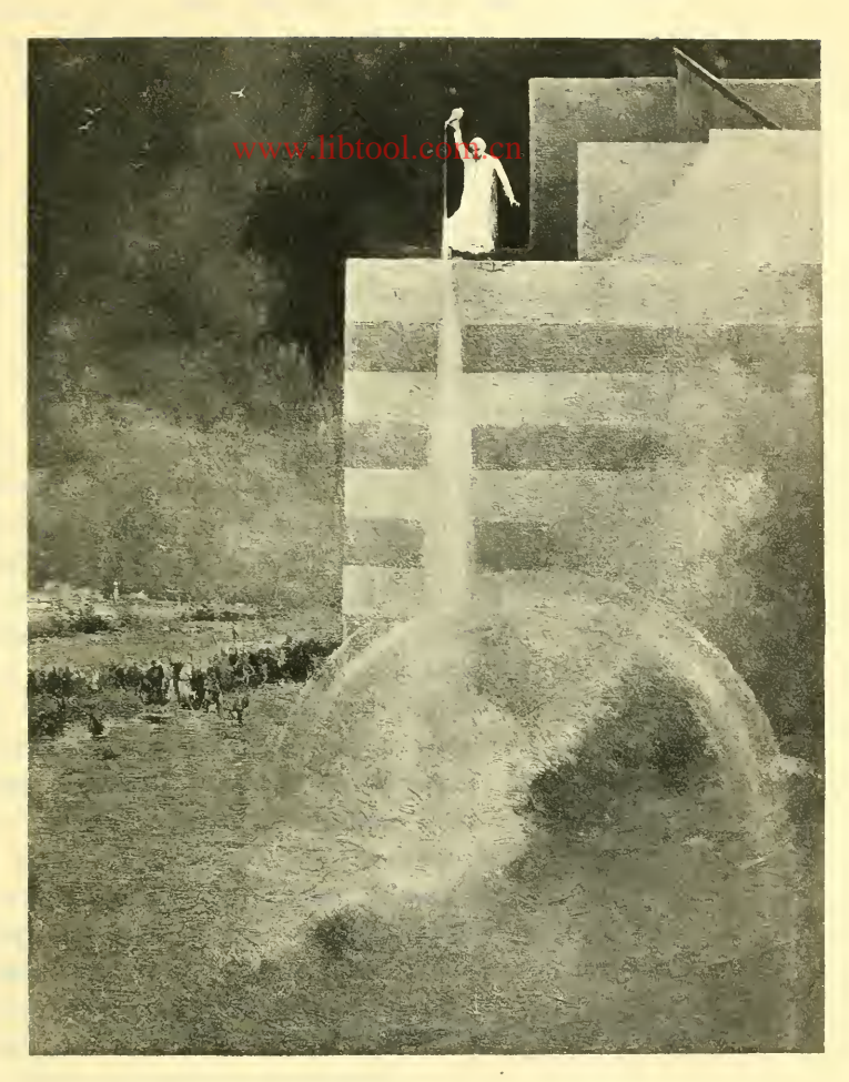
You and some