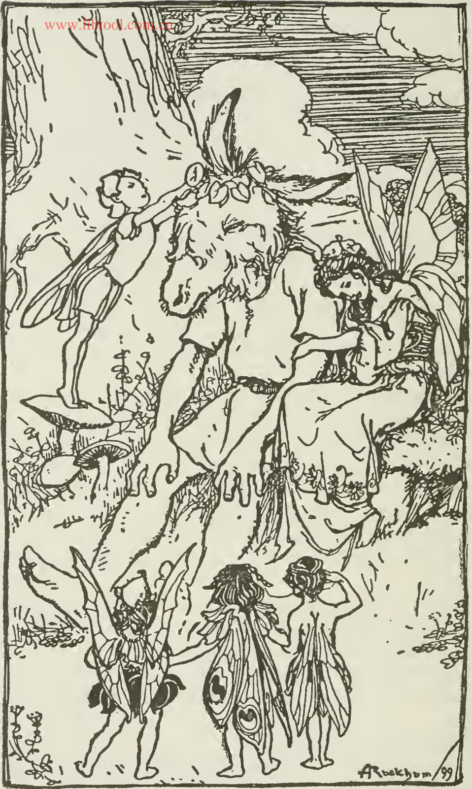
Where is Pease-blossom?