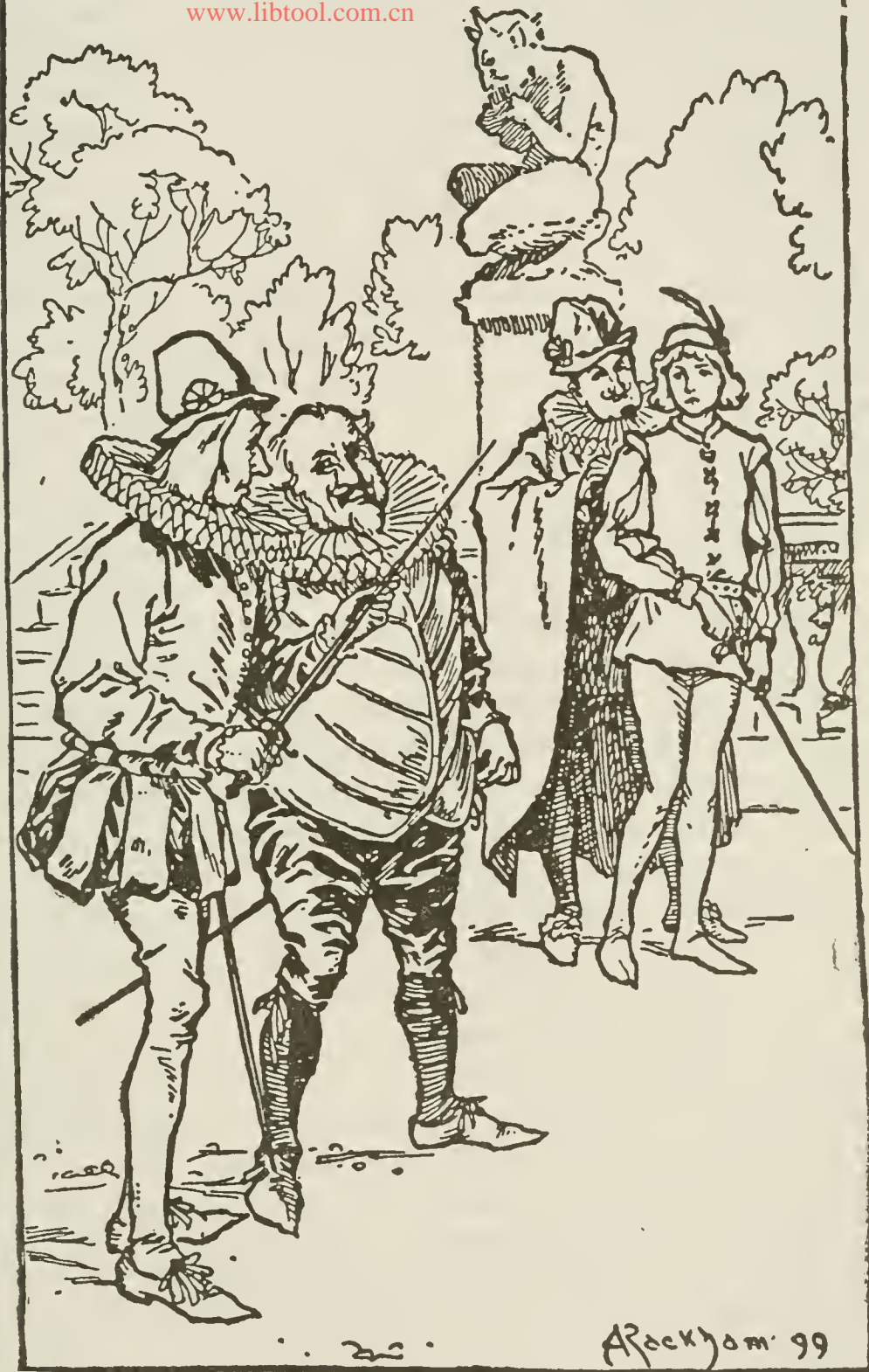
She began to think of confessing that she was a woman