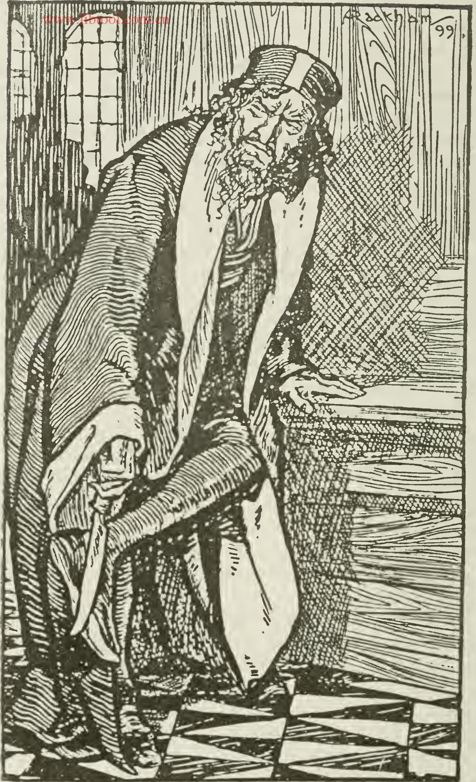
Shylock was sharpening a long knife