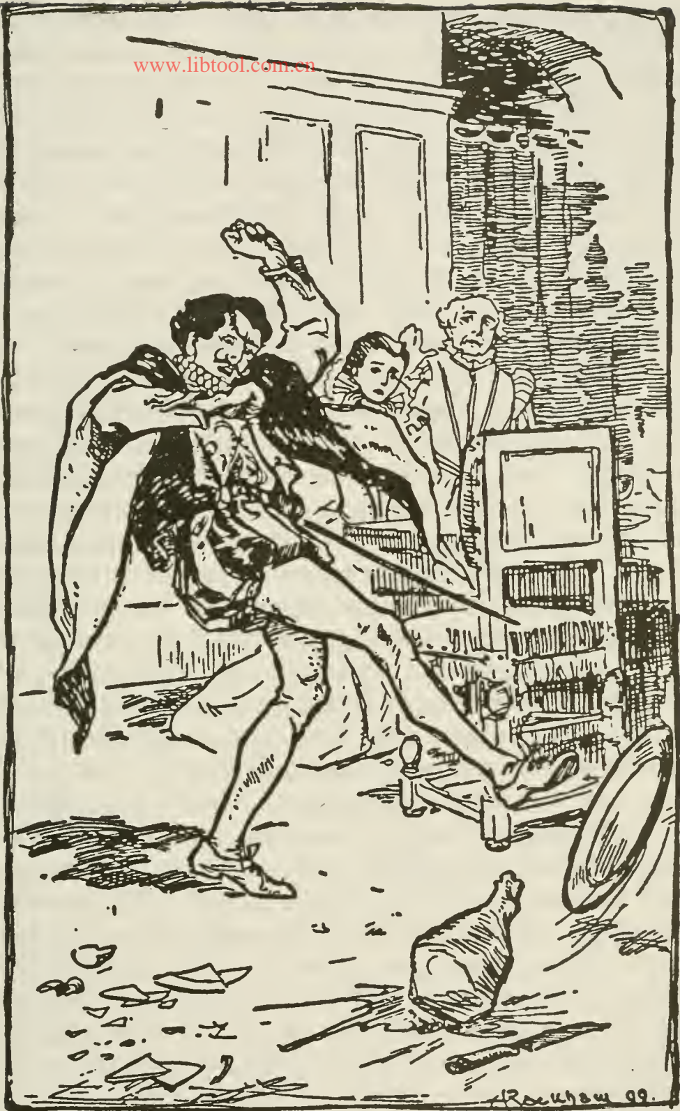
Petruchio, pretending to find fault with every dish, threw the meat about the floor