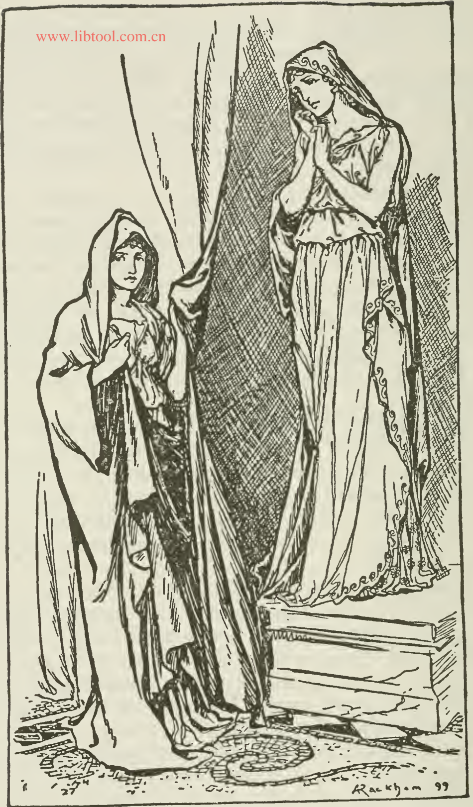
When Paulina drew back the curtain which concealed the famous statue