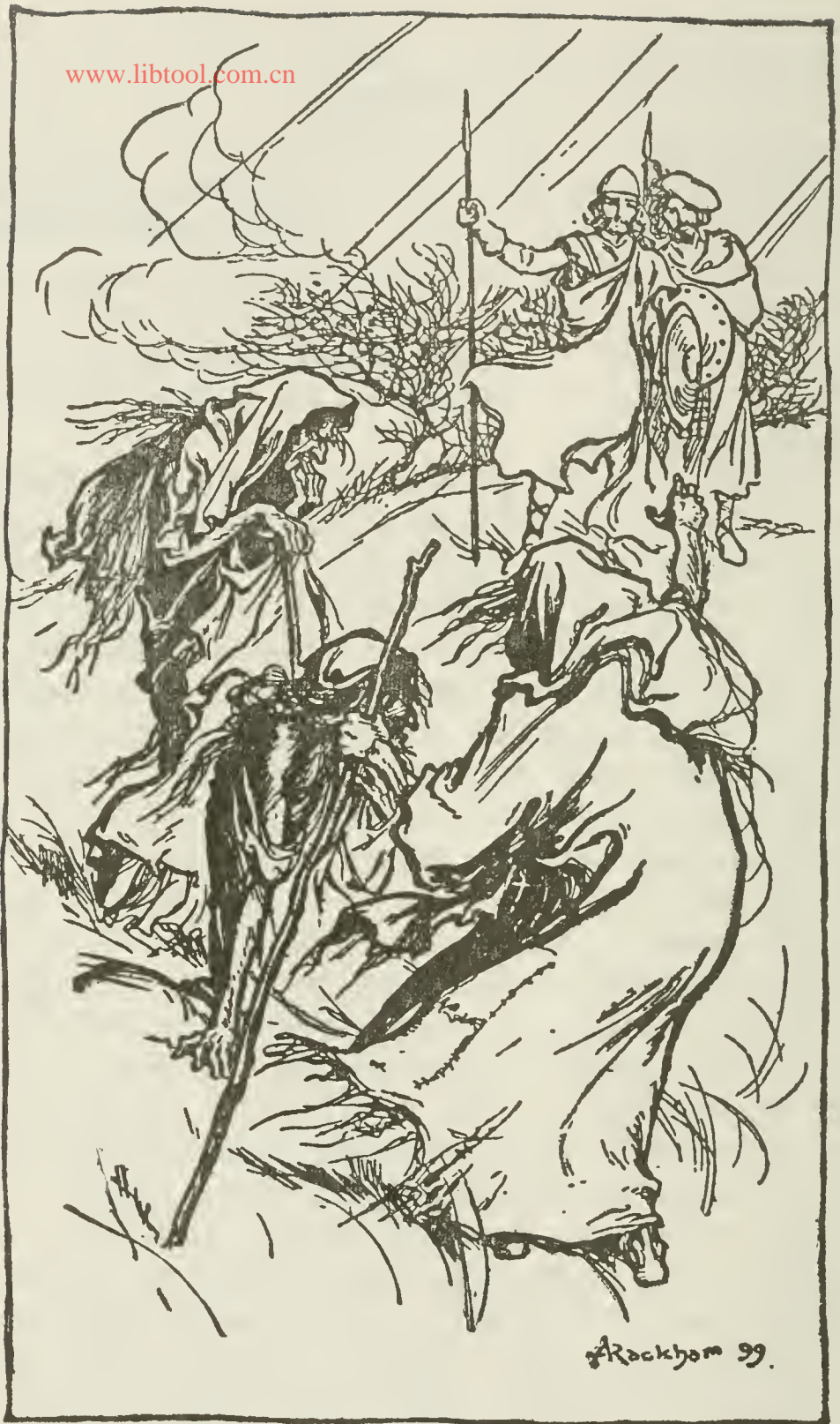
They were stopped by the strange appearance of three figures