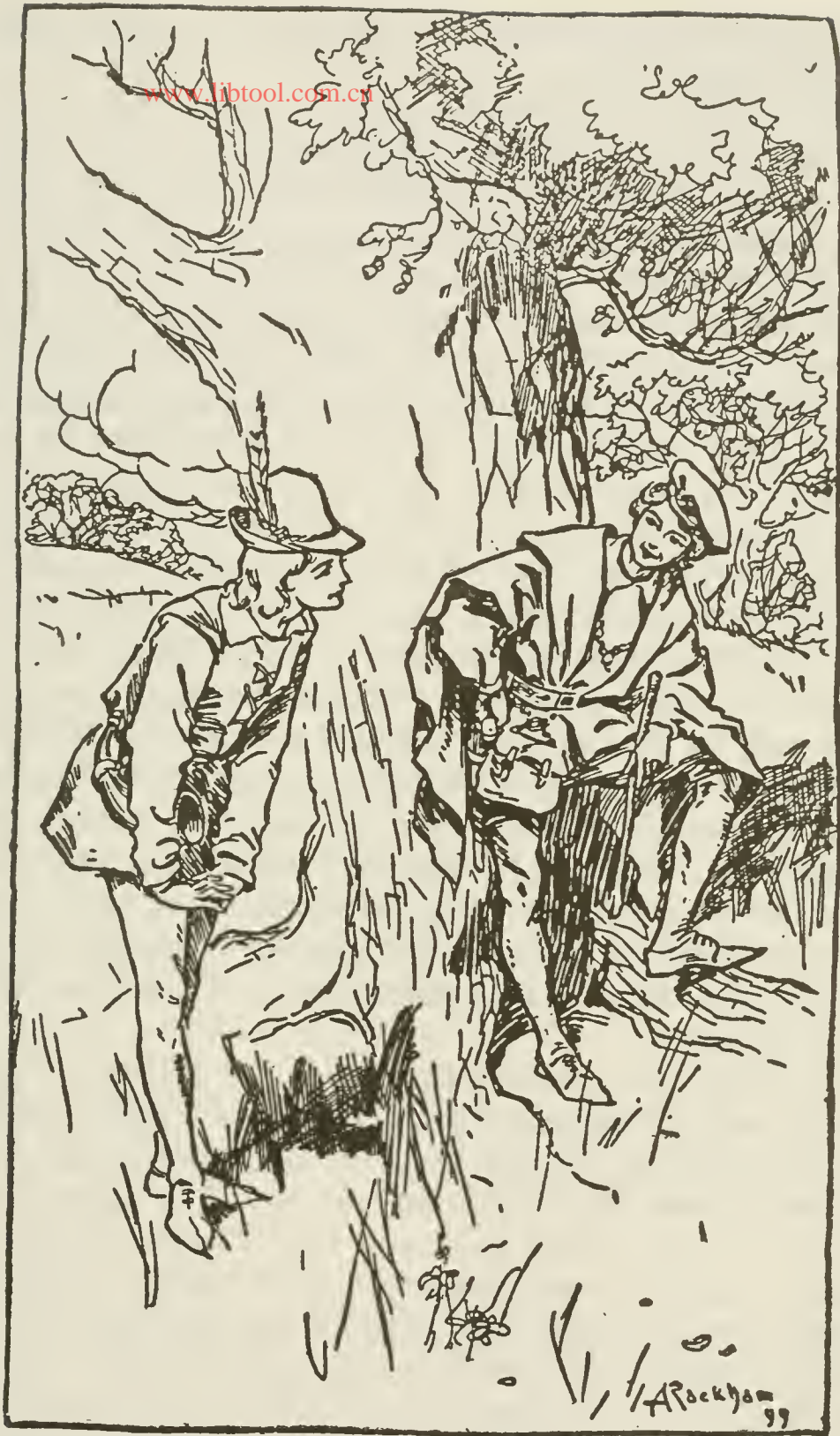
Ganymede assumed the forward manners often seen in youths when they are between boys and men