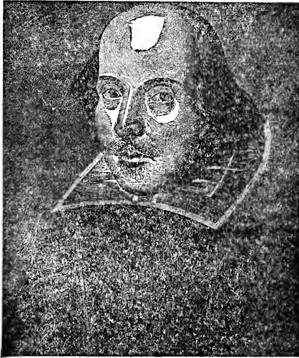
Dreeshout Portrait (as reputed) of the Stratford Shakspeare.

This is the portrait inserted as a frontispiece in the folio editions of Shake-speare, beginning in 1623, seven years after the reputed author's death. It is hardly considered as the likeness of a human being.