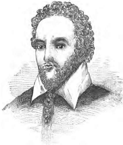
RICHARD BURBADGE (p. 275)