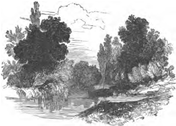
THE AVON, NEAR LUDDINGTON.

Hamlet speaks more lines (1569) than any other character in any one play. Richard III. comes next, with 1161 lines; then Iago , with 1117, and Henry V. with 1063. Of the characters who appear in more than one play, Henry V. , as prince and king, has the most lines (including 616 in 1 Henry IV. and 308 in 2 Henry IV. ), or 1987 in all. Falstaff comes next with 1895 in all (719 in 1 Henry IV. , 688 in 2 Henry IV. , and 488 in the Merry Wives ).