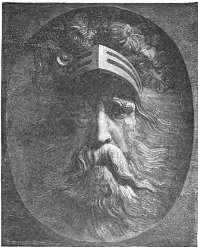
THE GHOST IN HAMLET (T. R. GOULD).