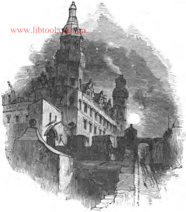
THE PLATFORM AT ELSINORE.