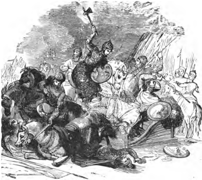
"He smote the sledded Polacks on the ice" (i. 1. 63).