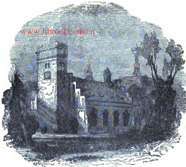
CHURCH AT ELSINORE.