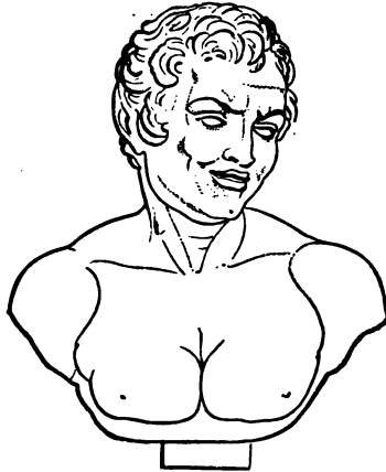
HEAD OF A SATYR.

A satyr . Warb. says: "By the satyr is meant Pan, as by Hyperion Apollo. Pan and Apollo were brothers; and the allusion is to the contention between those gods for the preference in music." But more probably, as Steevens suggests, the beauty of Apollo is contrasted with the deformity of a satyr.