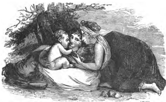
THE INFANT SHAKESPEARE.