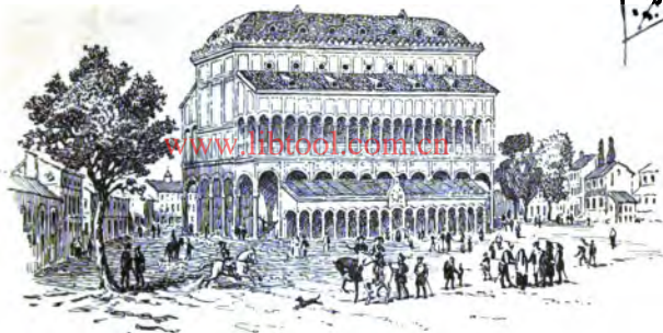
TOWN-HOUSE OF PADUA