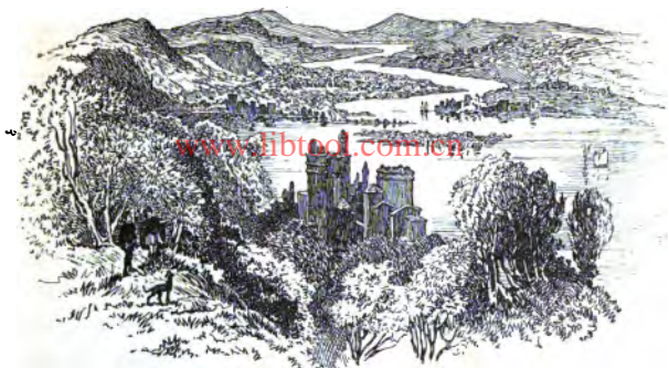
“THE PLEASANT GARDEN OF GREAT ITALY”