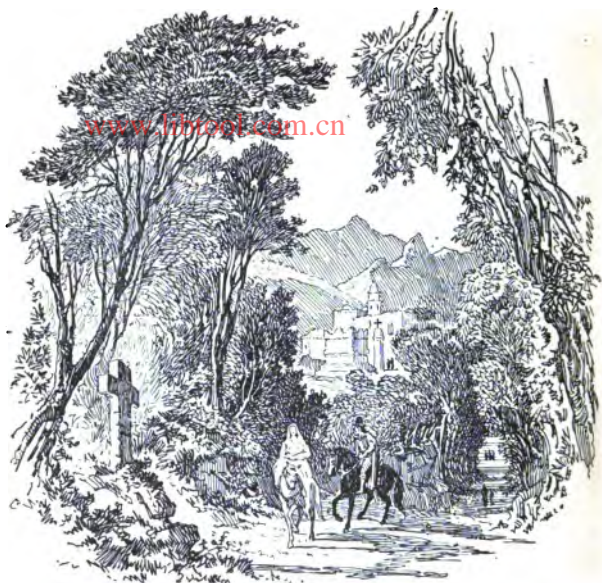
A PUBLIC ROAD