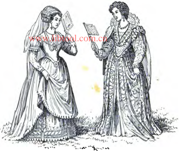
LADIES OF PADUA