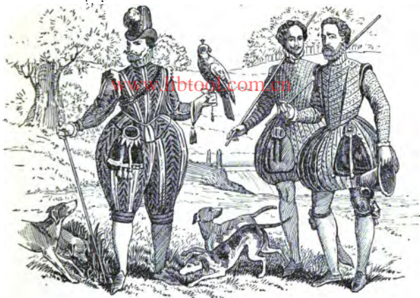
KING JAMES I. HAWKING