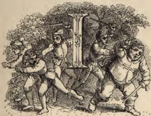
King Henry IV. Part I. Act II. Sc. 2.