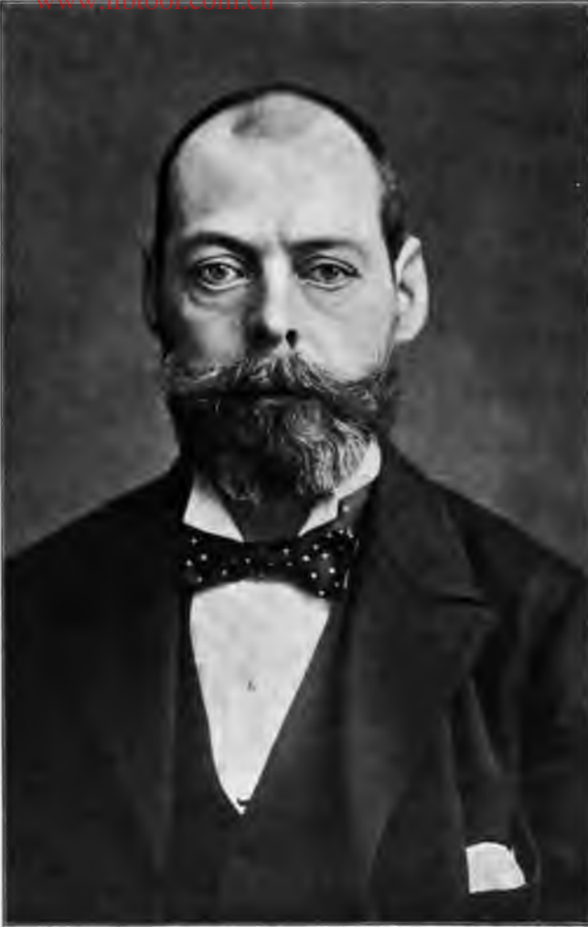
LORD RANDOLPH CHURCHILL