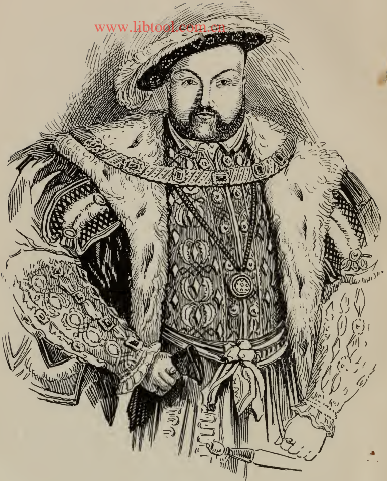
KING HENRY VIII