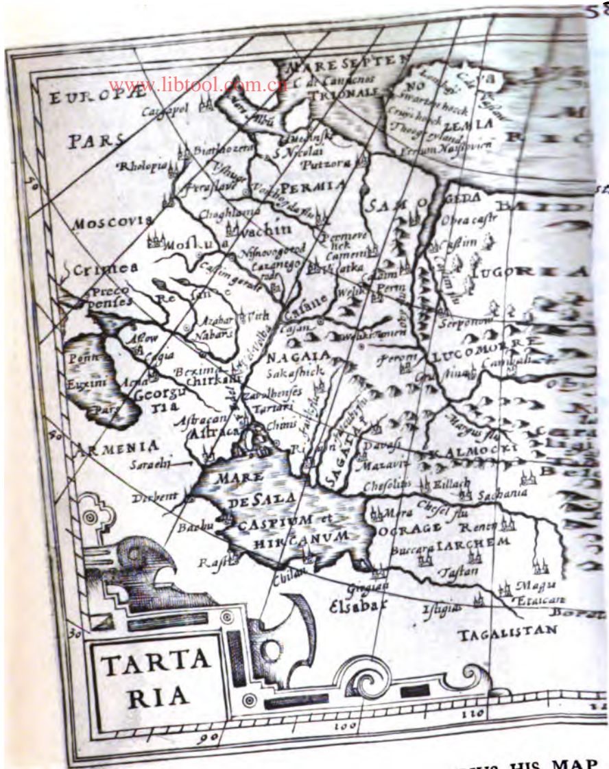
HONDIUS HIS MAP