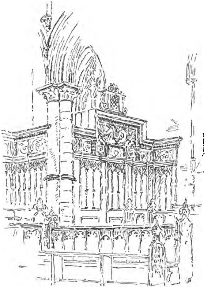
SCREEN IN AUCKLAND CASTLE CHAPEL. From a Sketch by Bishop Westcott.

in number, the Bishop, as was his wont on such occa-