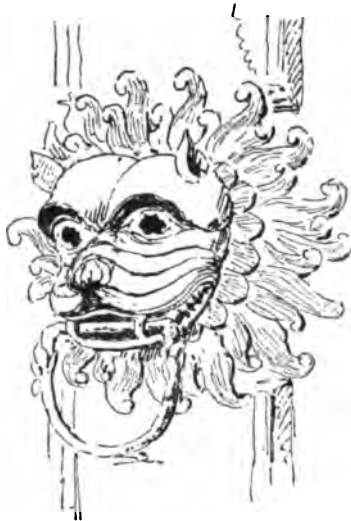
SANCTUARY KNOCKER OF DURHAM CATHEDRAL. From a Sketch by Bishop Westcott (see p. 54).

The sentences we have quoted above contain indeed a splendid and a sufficient creed ; a creed which gives a real and glorious content to the phrase so easily spoken—the divinity of Christ. But it is so far from the creed of orthodox Christianity that to recite it saddens us rather than cheers. Most Christians do not dare to allow any inspiration to “ profane ” writers, as they profanely call them, lest the authors