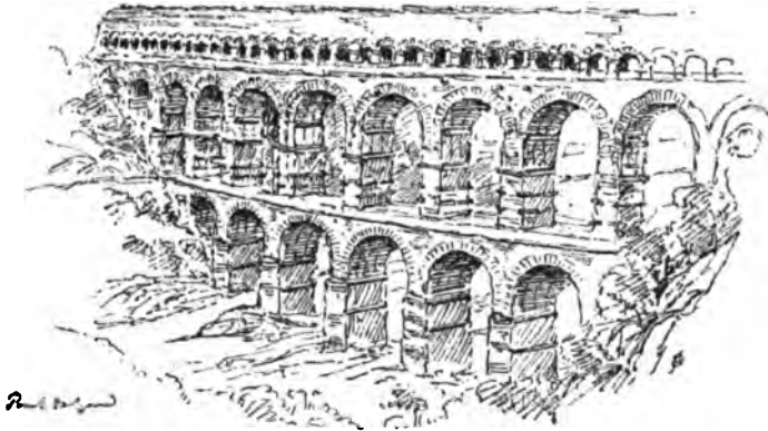
PONT DU GARD.

I often think of the basement of the Roman wall at Arles : that and the Pont du Gard impressed me most of all the special things we saw. All the spirit of Rome was in them. Perhaps the spirit of Faith was in the cloisters of St. Trophimus,