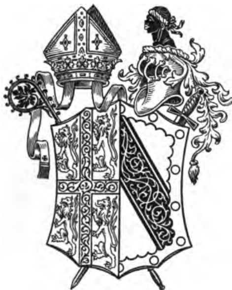
BISHOP WESTCOTT'S ARMS.