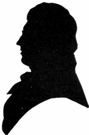
THOMAS HOPKINS GALLAUDET. ( Taken in 1822. )