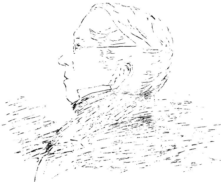
THOMAS HOPKINS GALLAUDET.