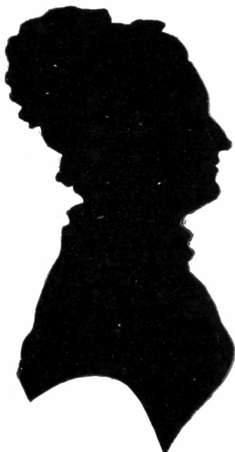
SOPHIA FOWLER GALLAUDET. (Taken in 1822.)