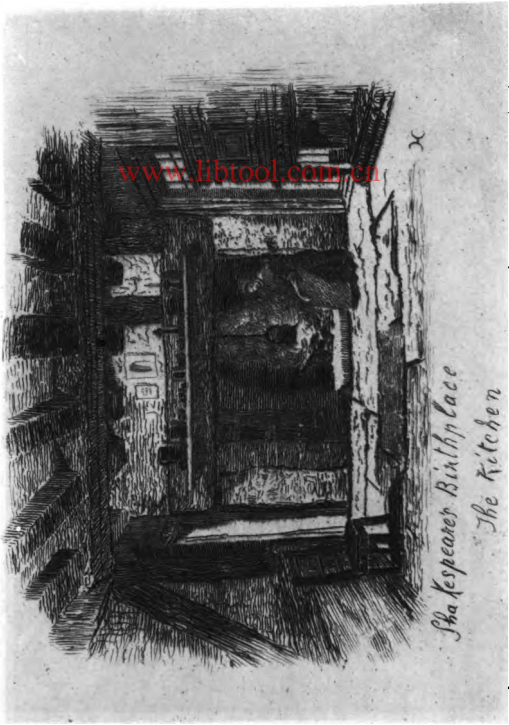
x Shakespeare's Birthplace The Kitchen