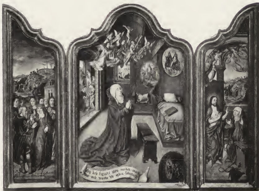
108. — BOUTS (Albert).