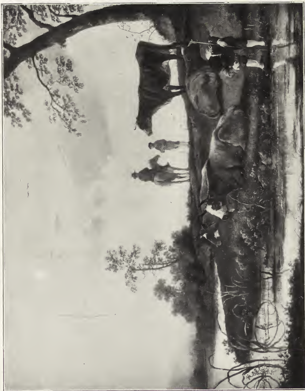
14. — Cuyp (Aelbert).