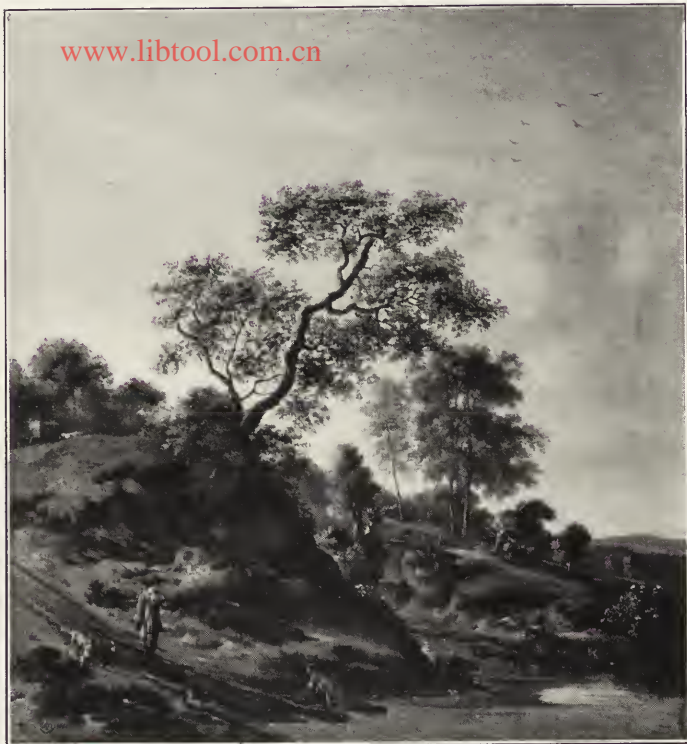
84 — WYNANTS (Jan).