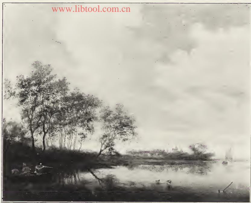
69. — RUYSDAEL (Salomon van).