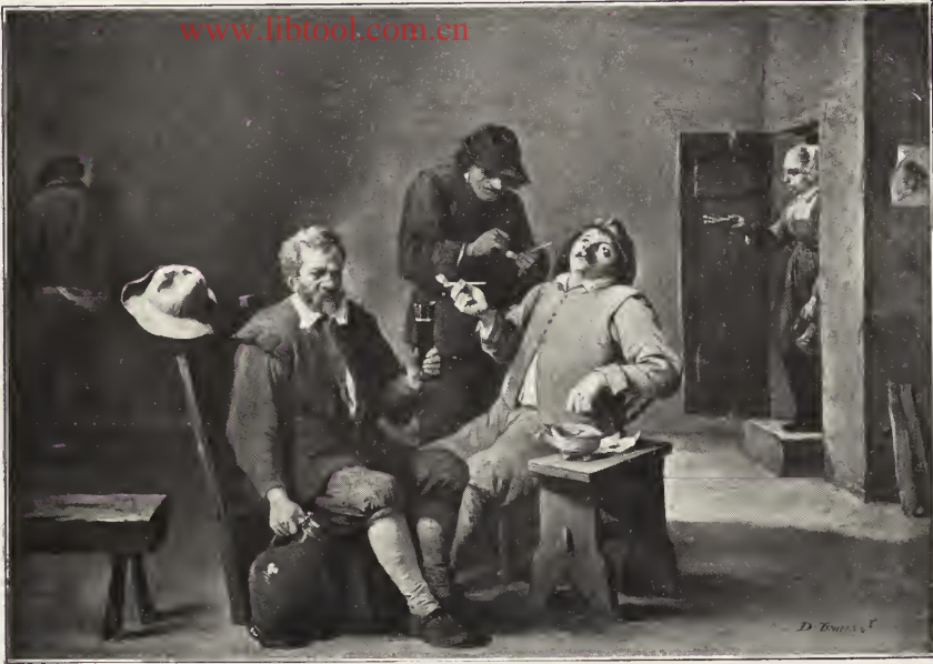
100. — TENIERS the younger (David).