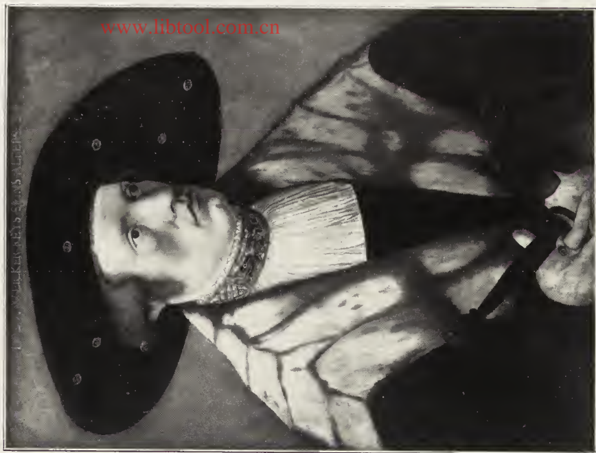
120. — CREUZNACH (Conrad von).