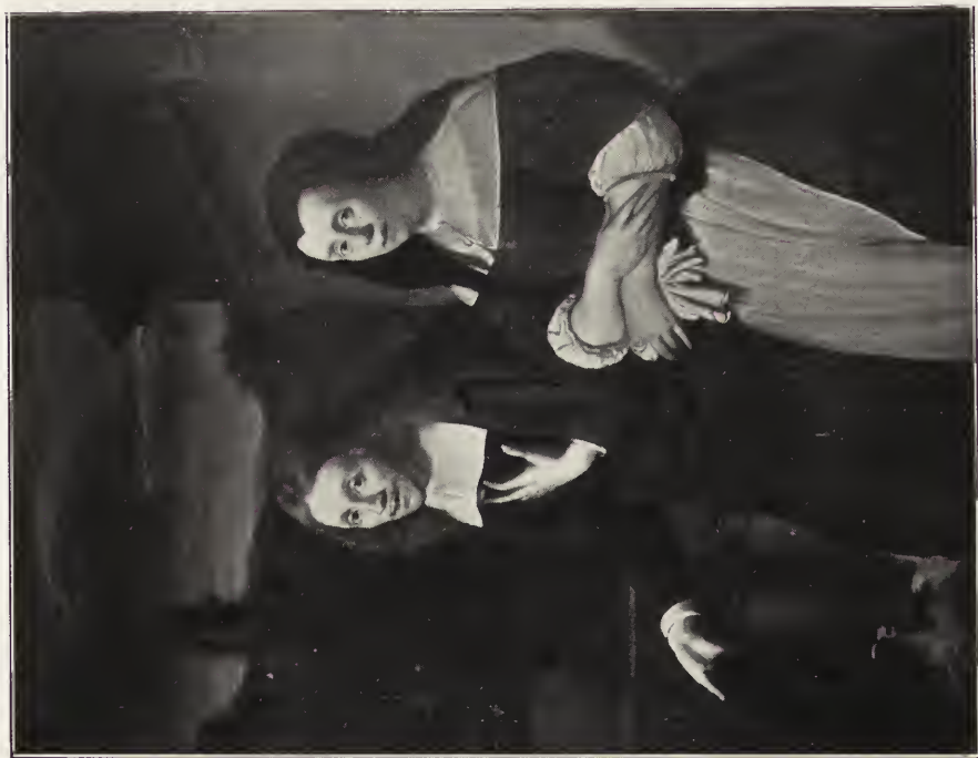
43. — MIERIS the elder (Frans van).