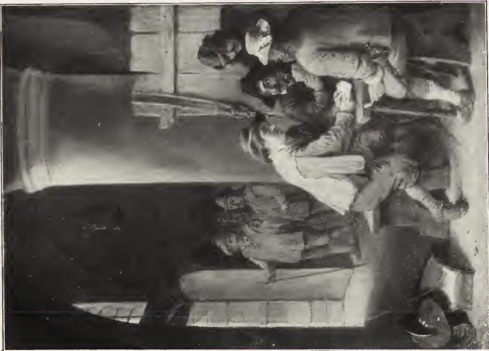
101. — TENIERS the younger (David).