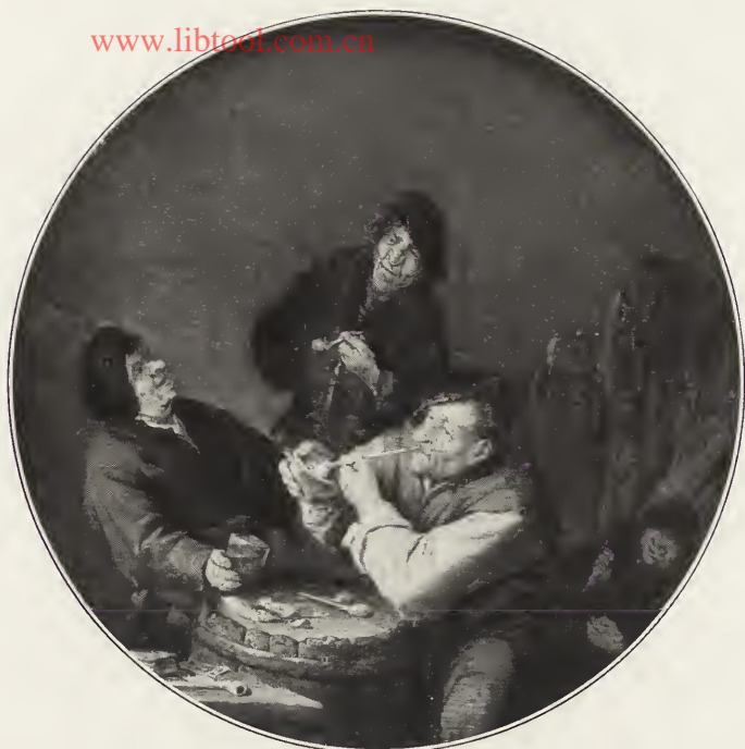
52. — OSTADE (Adriaen van).