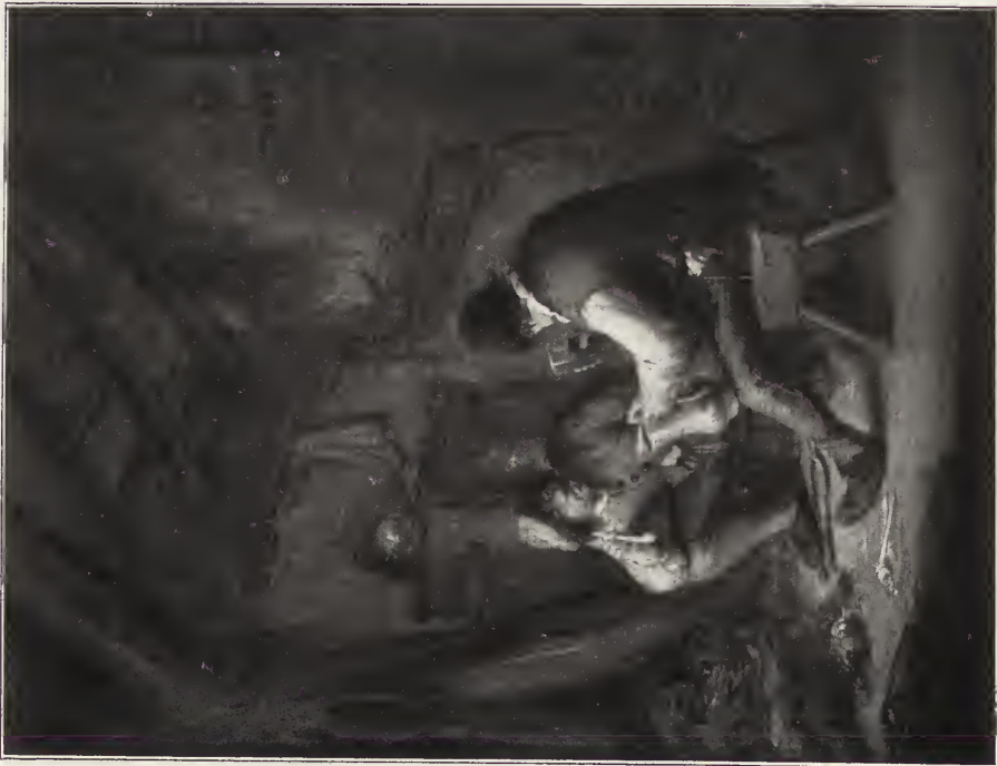
51. — OSTADE (Adriaen van).