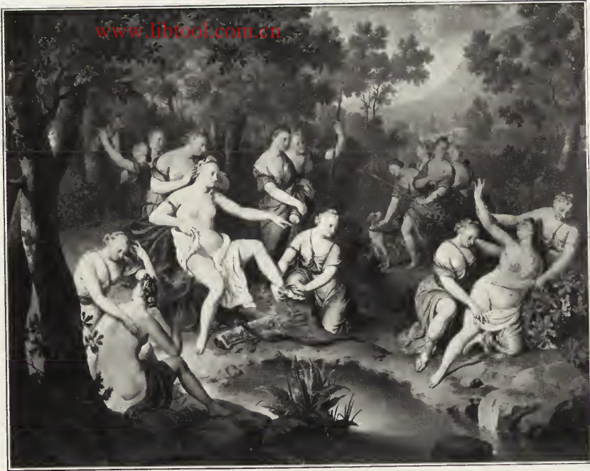
44. — MIERIS (Willem van).