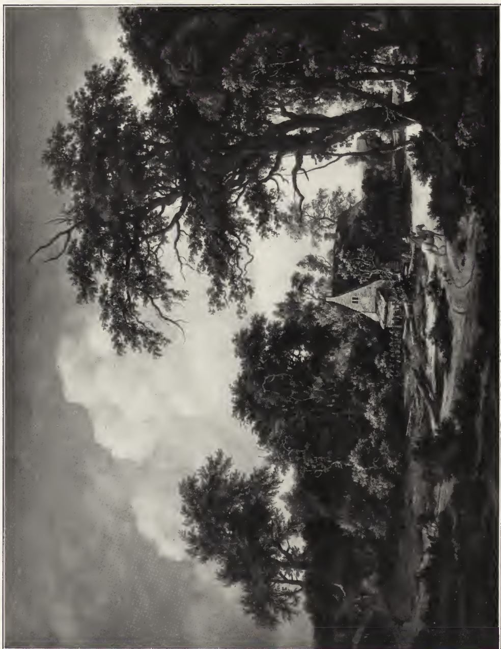
33. — HOBBEEMA (Meindert).