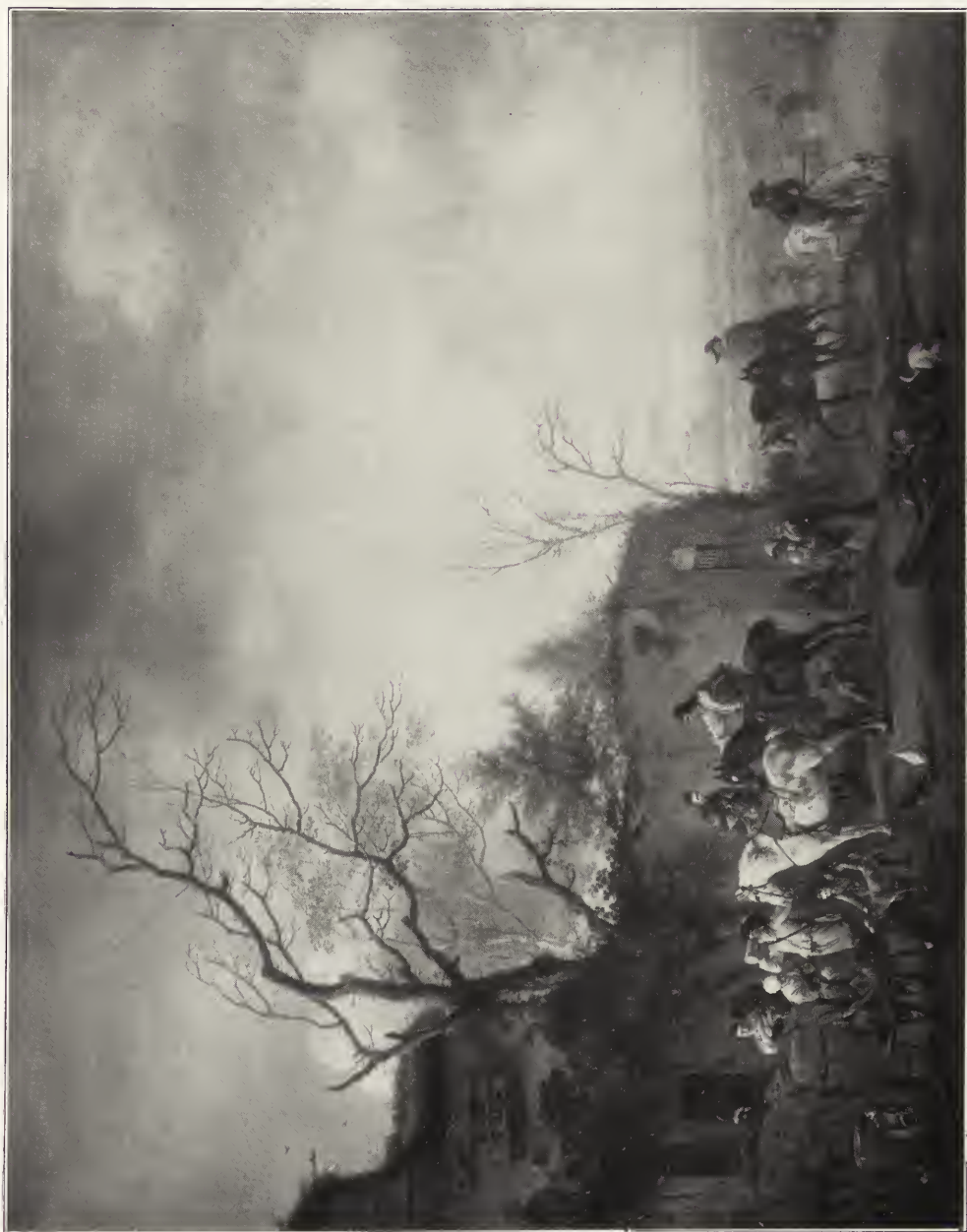
83. — WOUWERMAN (Philip).