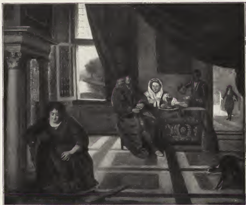
37. — HOOGHE (Pieter de).