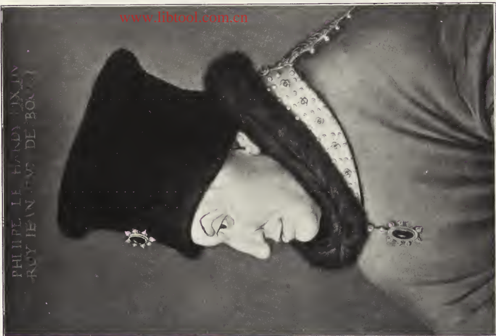
145. — ANCIENT FRENCH SCHOOL.