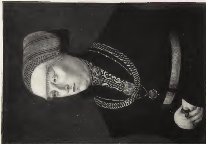
121. — CREUZNACH (Conrad von).