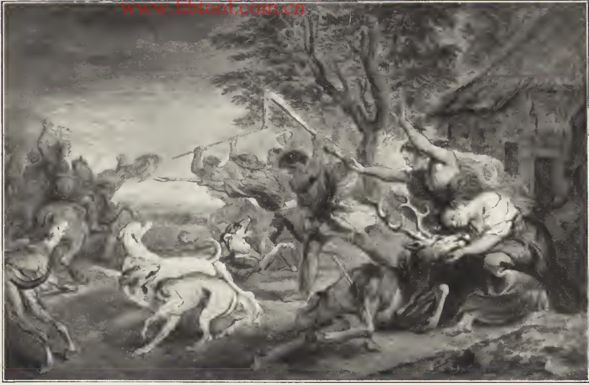
94. — RUBENS (Petrus Paulus).