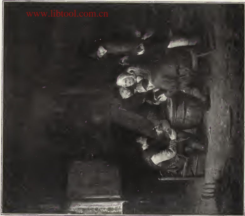
50. — OSTADE (Adriaen van).