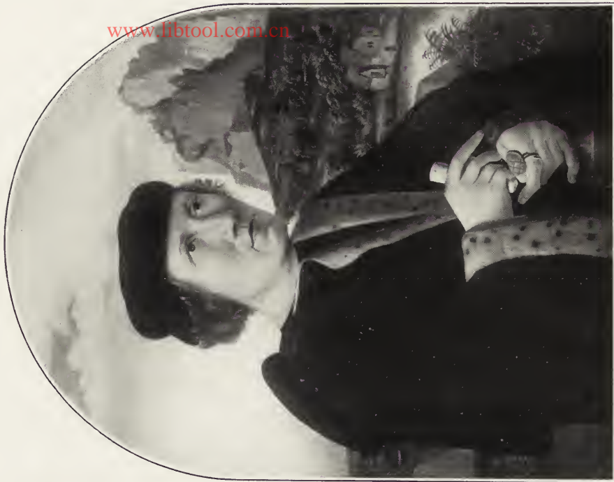
122. — SCHOOL OF HOLBEIN THE YOUNGER.