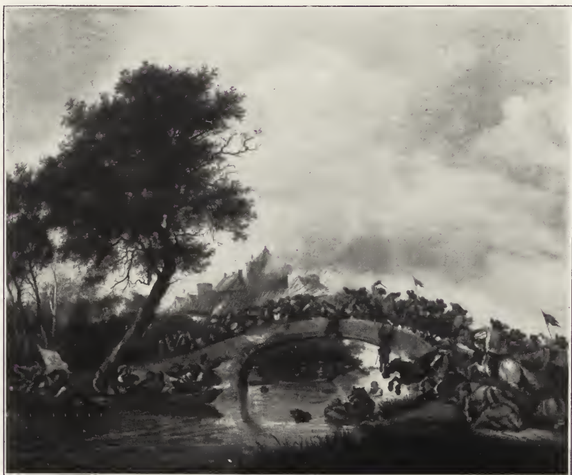
68. — RUYSDAEL (Salomon van).