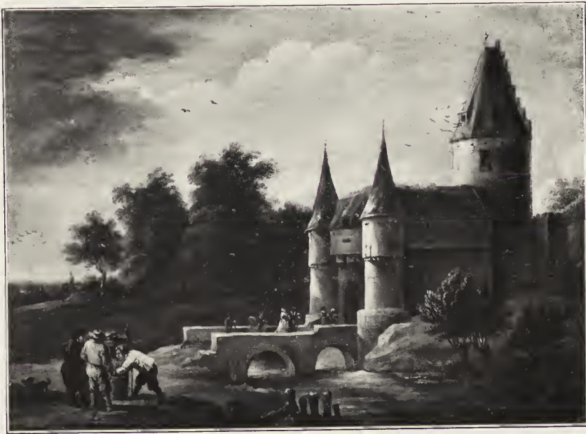
99. — TENIERS the younger (David).