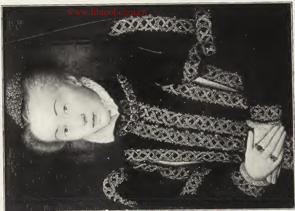
113. — Pourbus the elder (François).