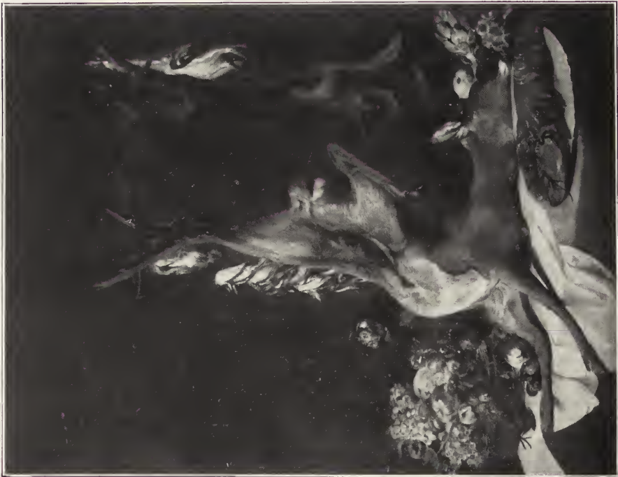
95. — SNYDERS (Frans).