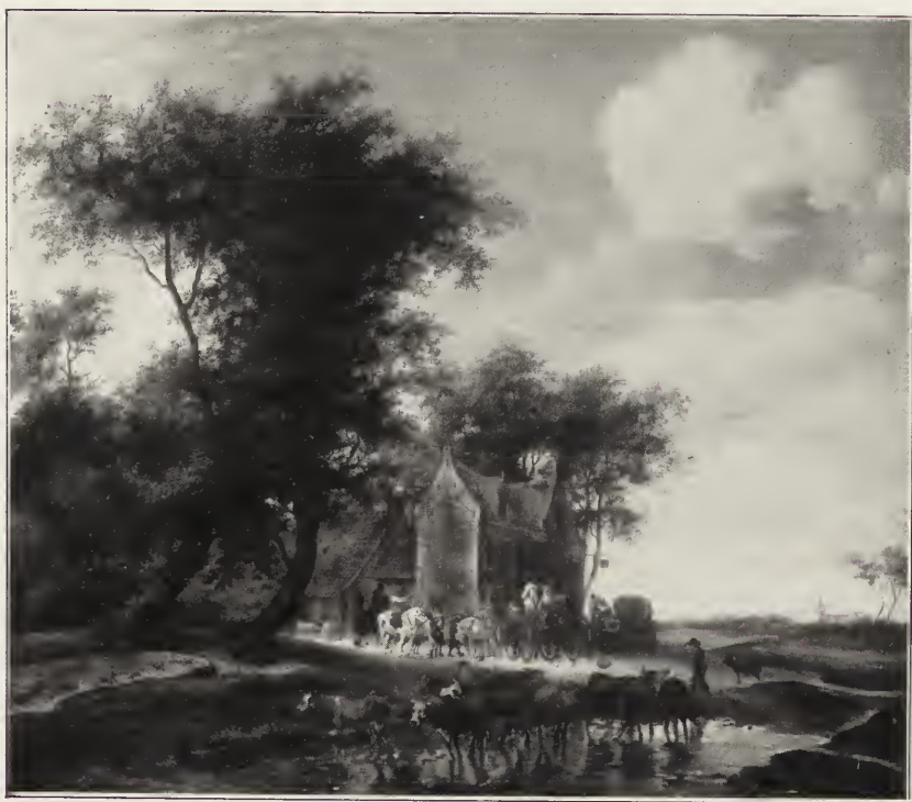
66. — RUYSDAEL (Salomon van).