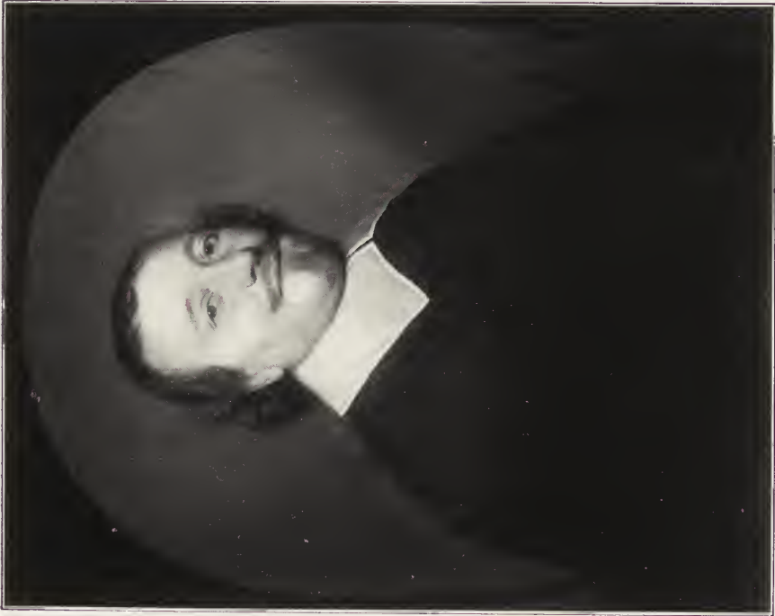
35. — HONTHORST (Gerard van).