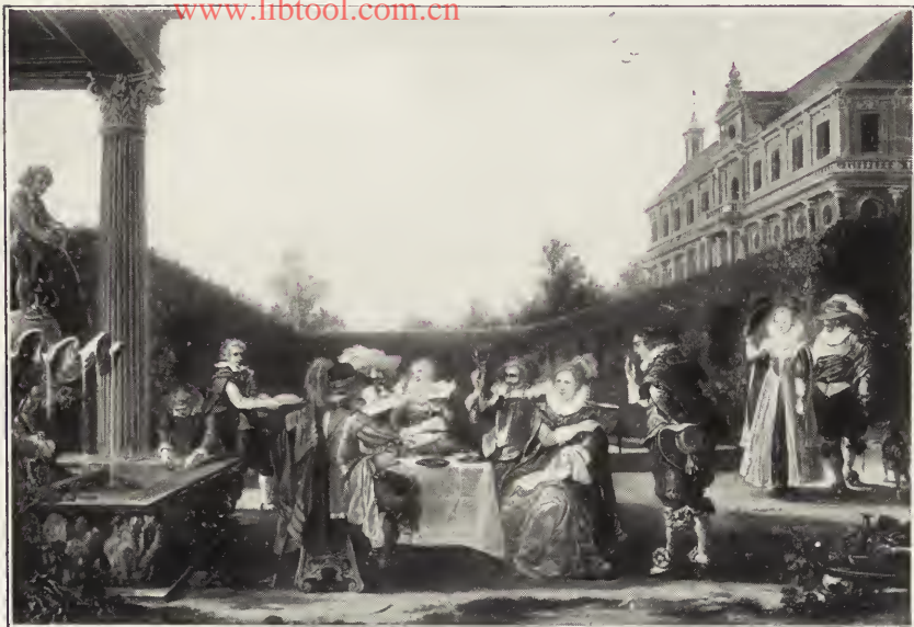
79. — VELDE (Esaias van de).