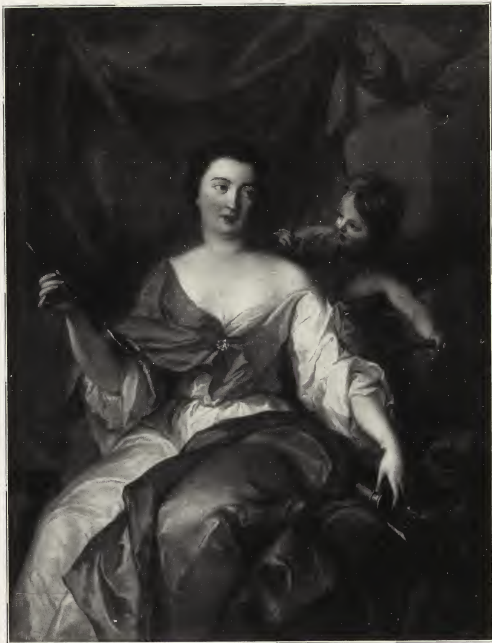
149. — NATTIER the elder (Marc).