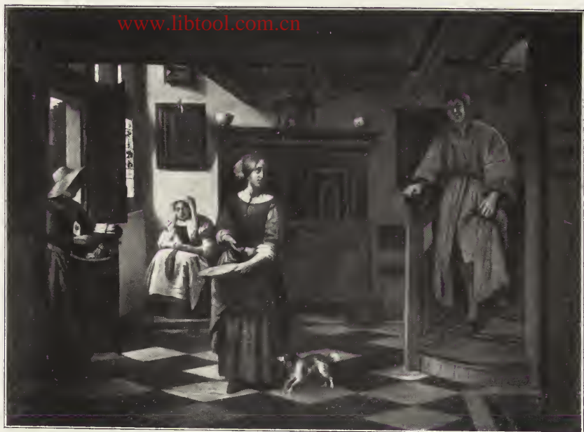
36. — HOOGHE (Pieter de).