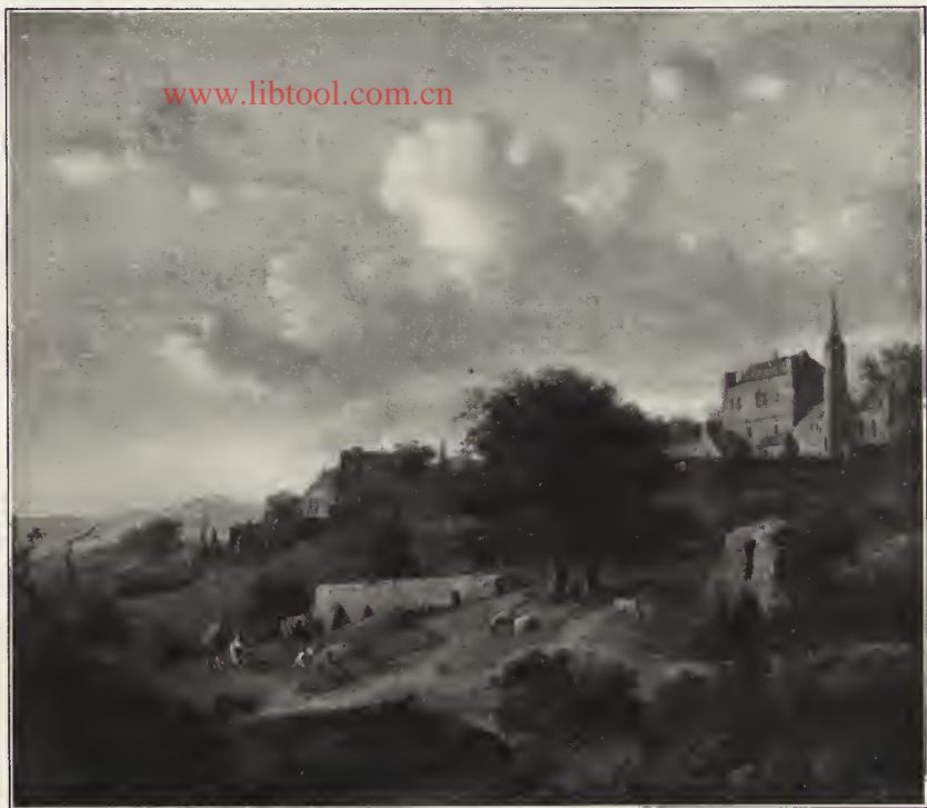
31. — HEYDEN (Jan van der).