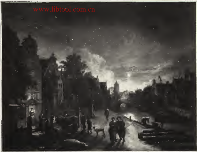
46. — NEER (Aert van der).