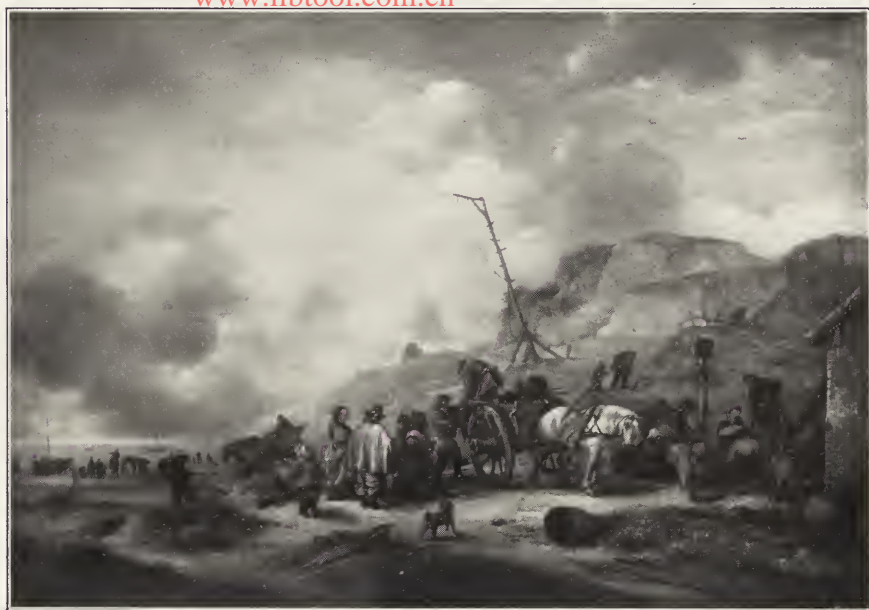
56. — OSTADE (Isack van).