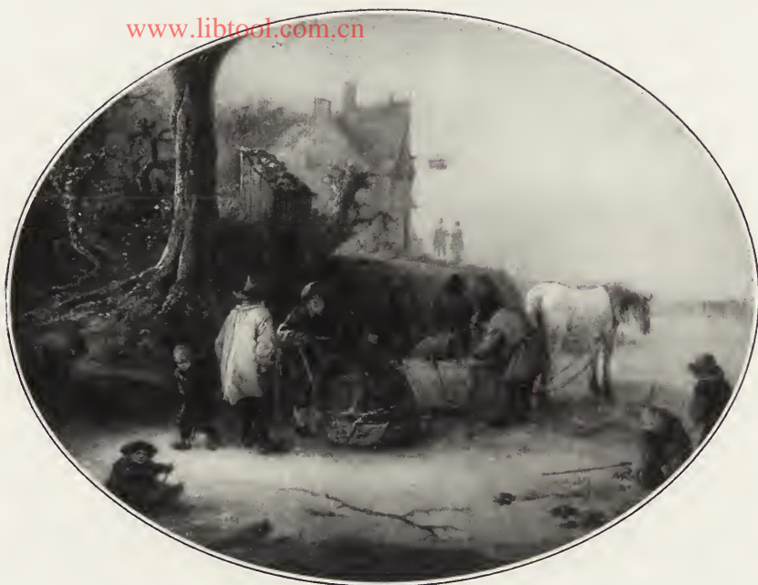
54. — OSTADE (Isack van).