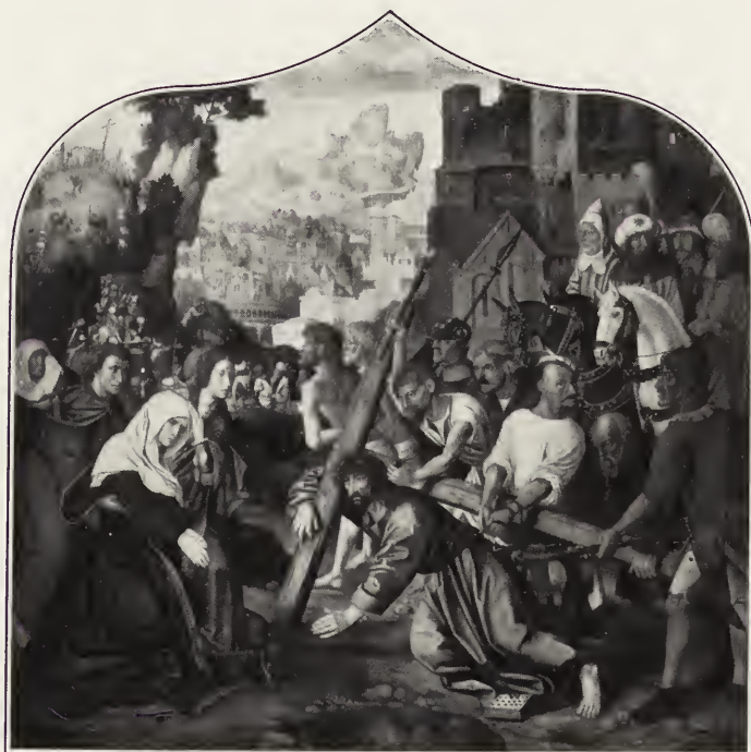
106. — LE MAITRE DU SAINT-SANG.