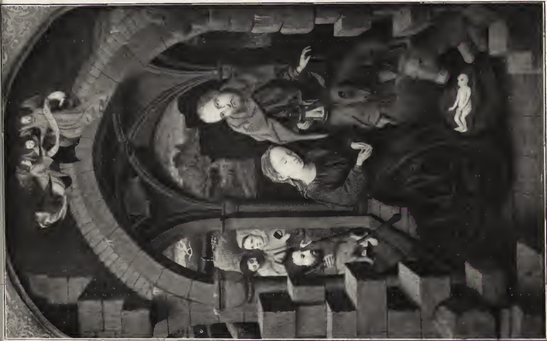
110. — KOFFERMANS (Marcellus).