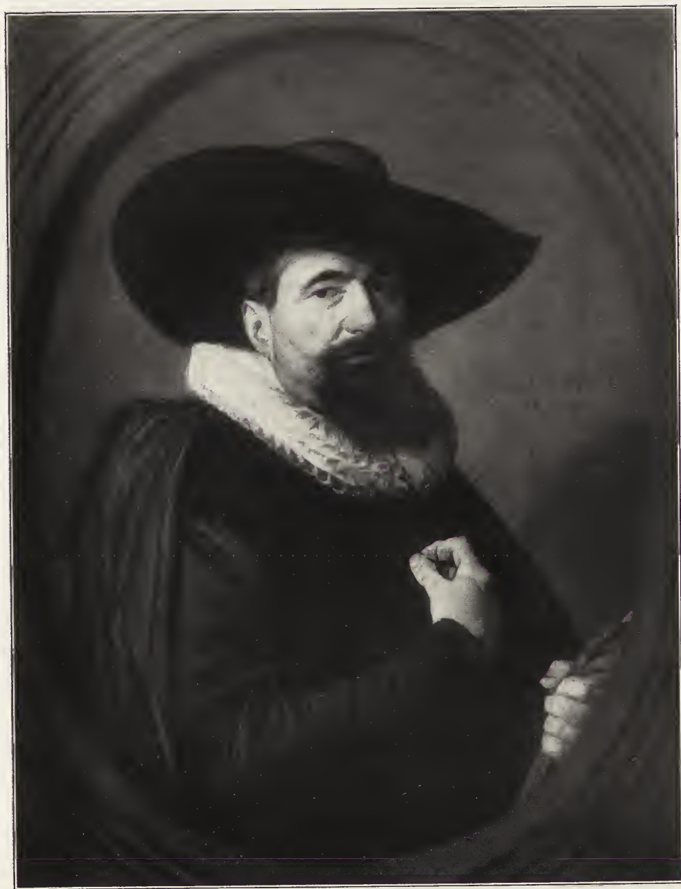
28. — HALS (Frans).