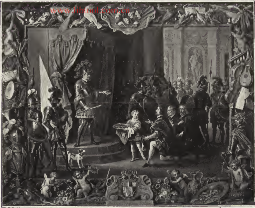
98. — TENIERS the younger (David).