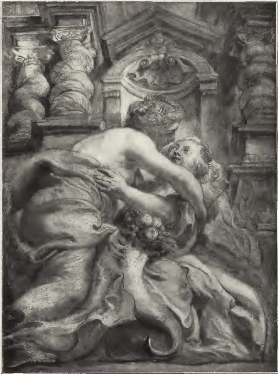
93. — RUBENS (Petrus Paulus).