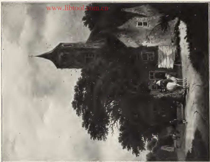
81. — Vries (Roelof van).