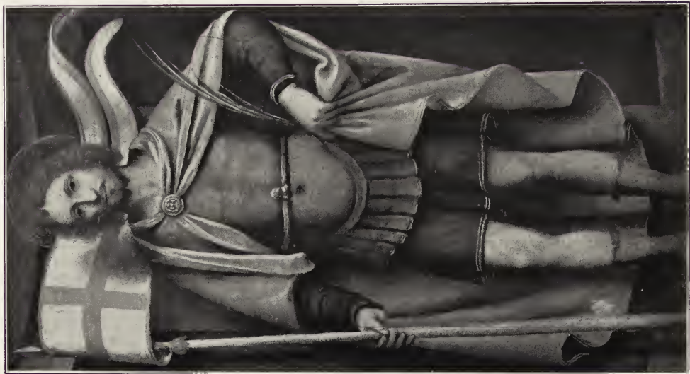
131. — Luini (Bernardino).