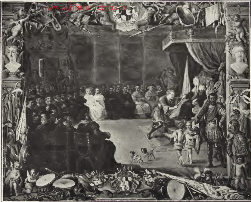
96. — TENIERS the younger (David).