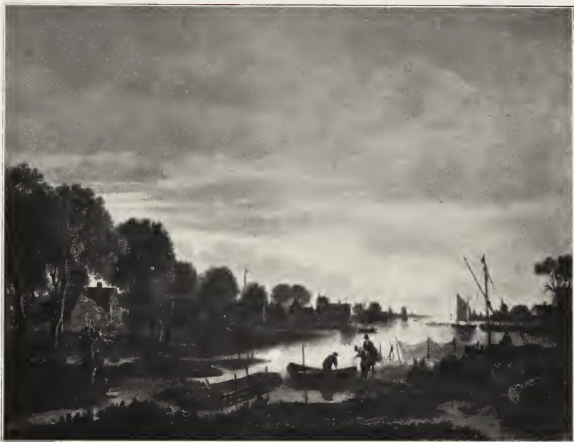
47. — NEER (Aert van der).