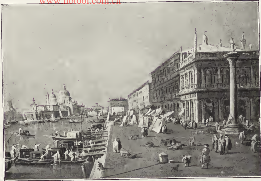
136. — GUARDI (Francesco).