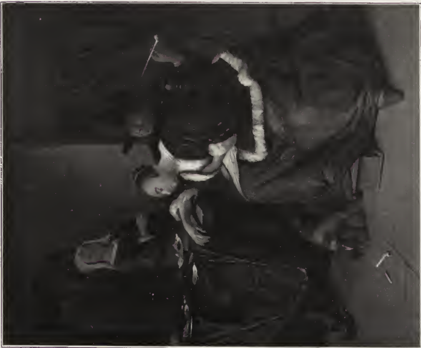
74. — STEEN (Jan).