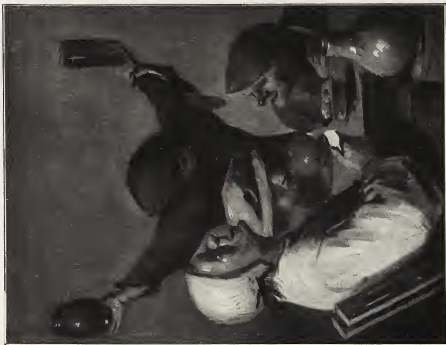
7. — Brouwer (Adriaen).