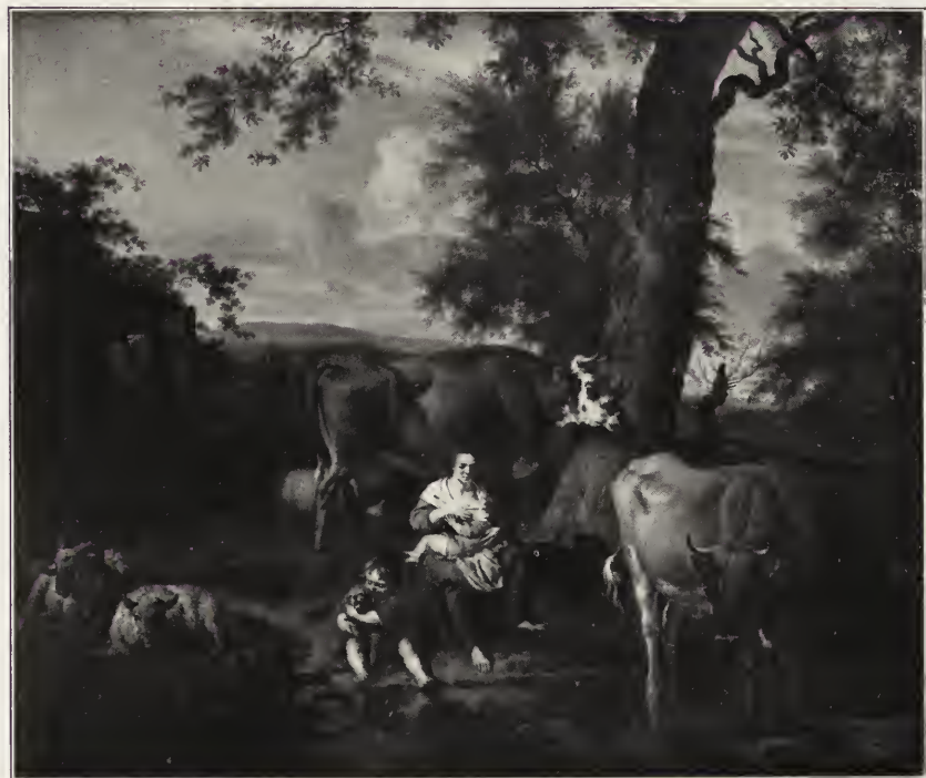
78. — VELDE (Adriaen van de).