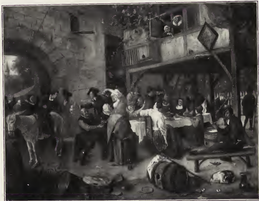
72. — STEEN (Jan).