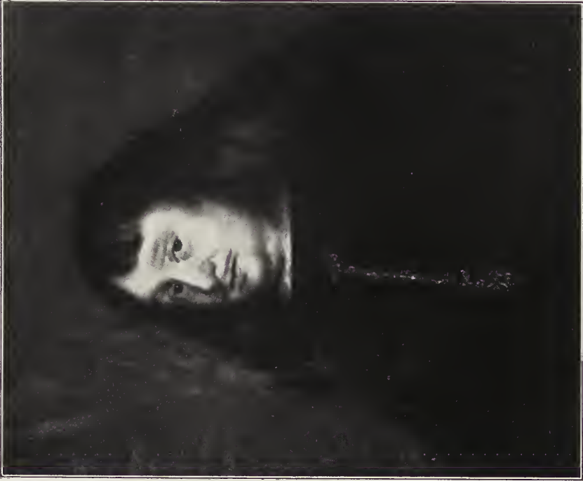
141. — CARREÑO DE MIRANDA (D. Juan).