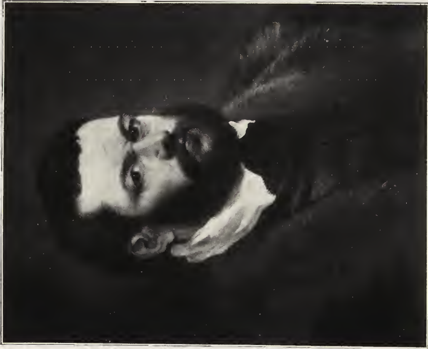
92. — RUBENS (Petrus Paulus).