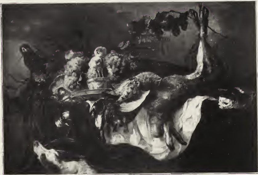
87. — Fyt (Jan).