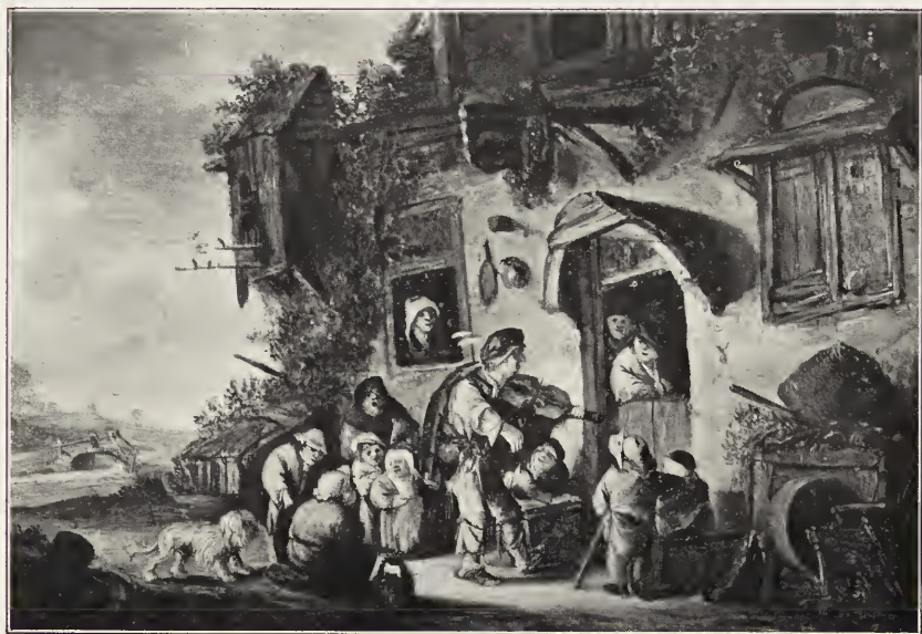
57. — OSTADE (Isack van).