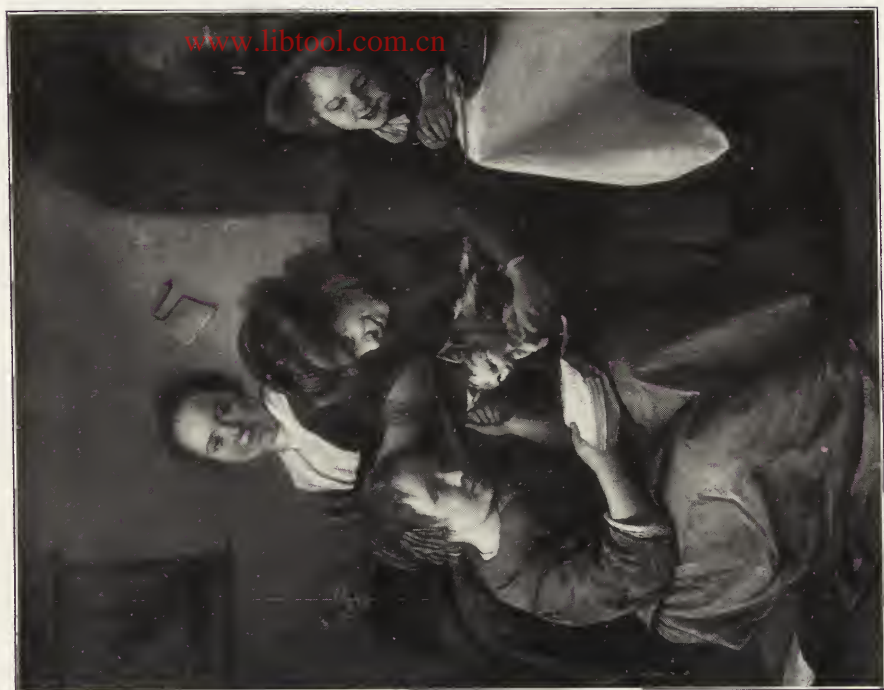
71. — STEEN (Jan).