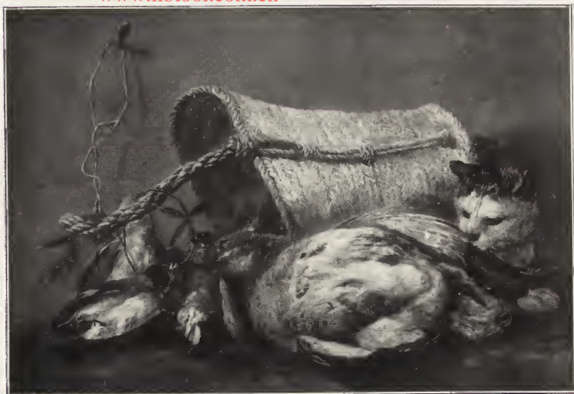
88. — FYT (Jan).