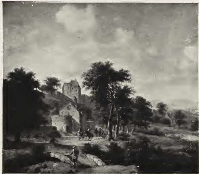
32. — HEYDEN (Jan van der).