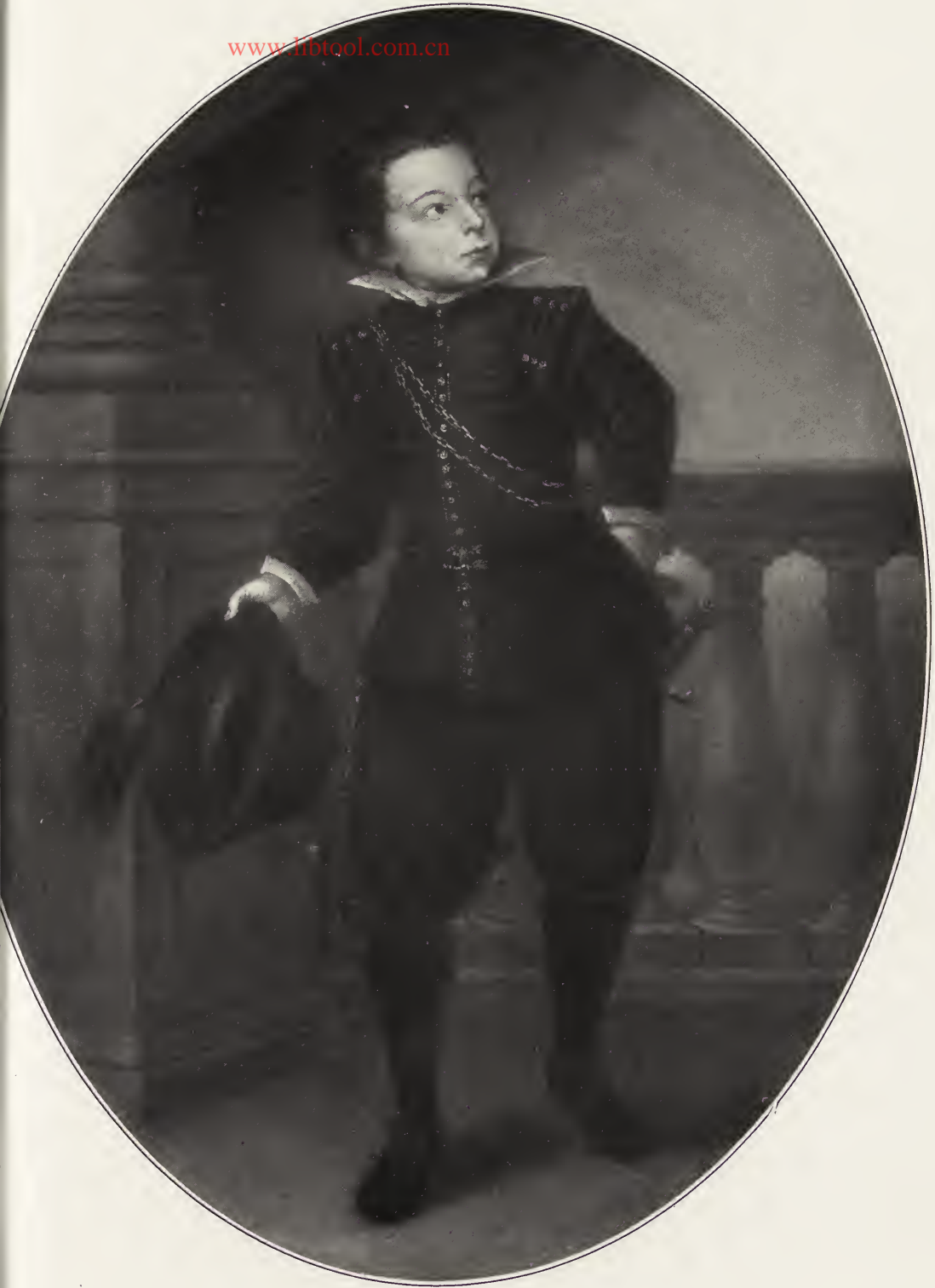
103. — VAN DYCK (Antonius).