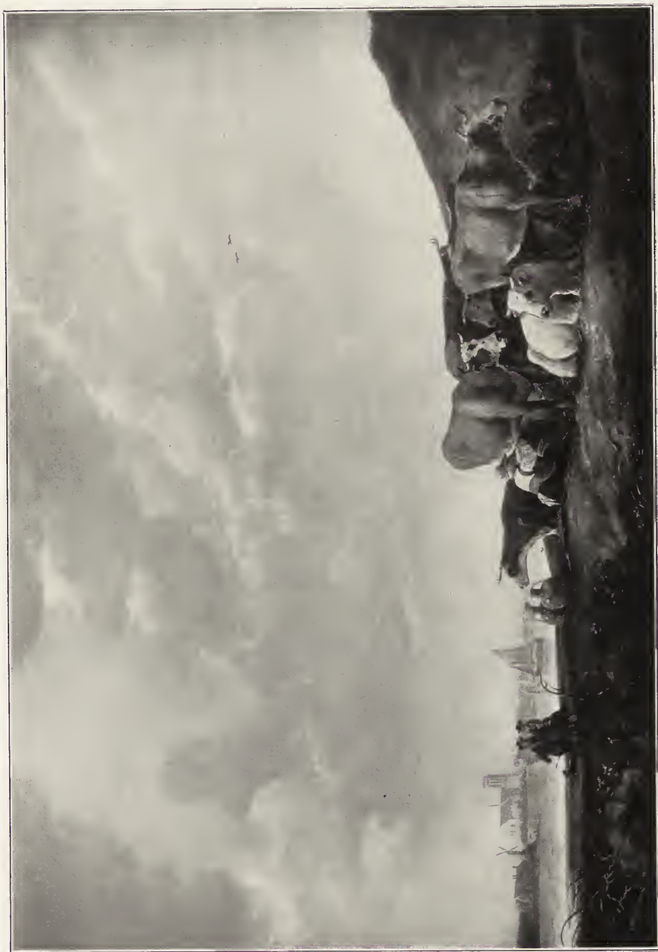
13. — CuyP (Aelbert).