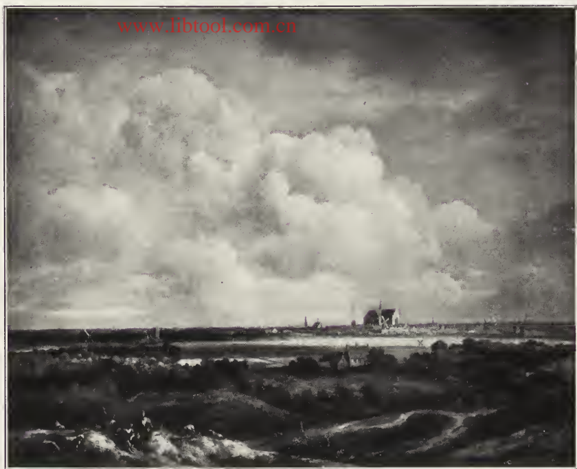
63. — RUISDAEL (Jacob van).