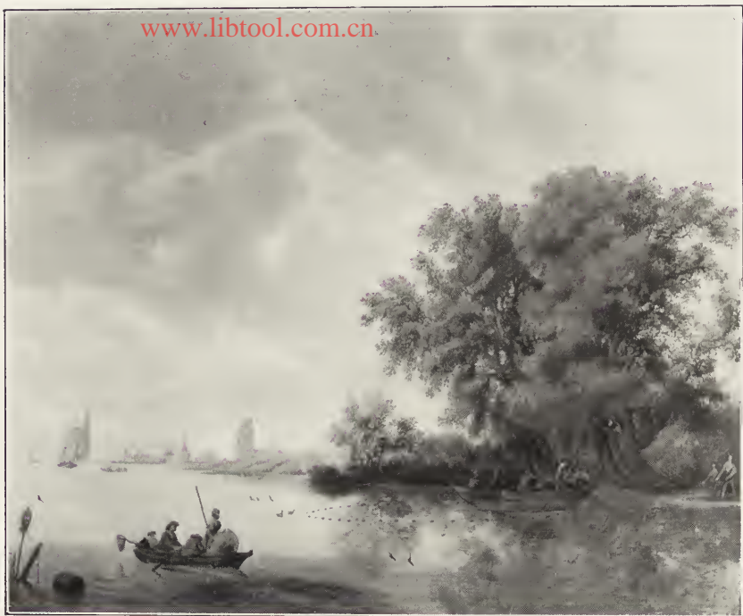
67. — RUYSDAEL (Salomon van).