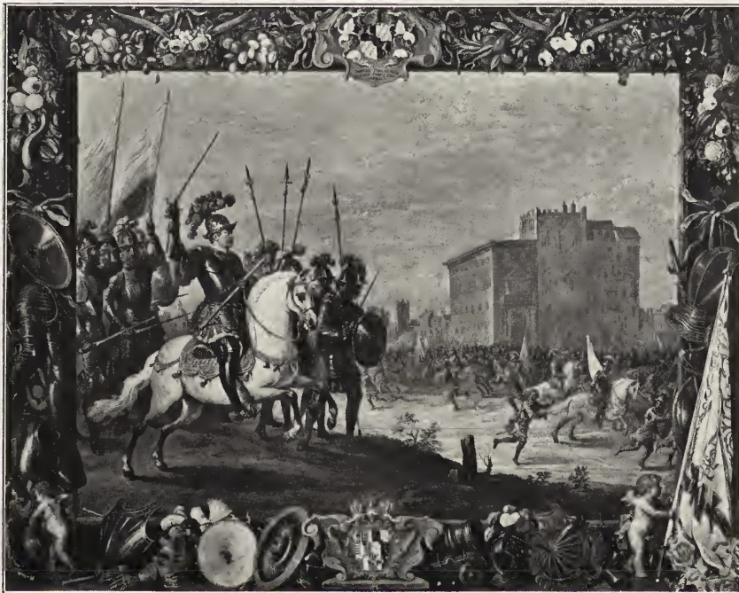
97. — TENIERS the younger (David).