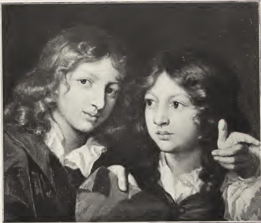
49. — NETSCHER (Caspar).