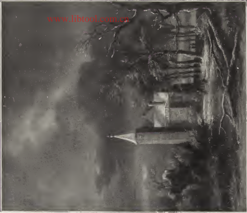
61. — RUISDAEL (Jacob van.)