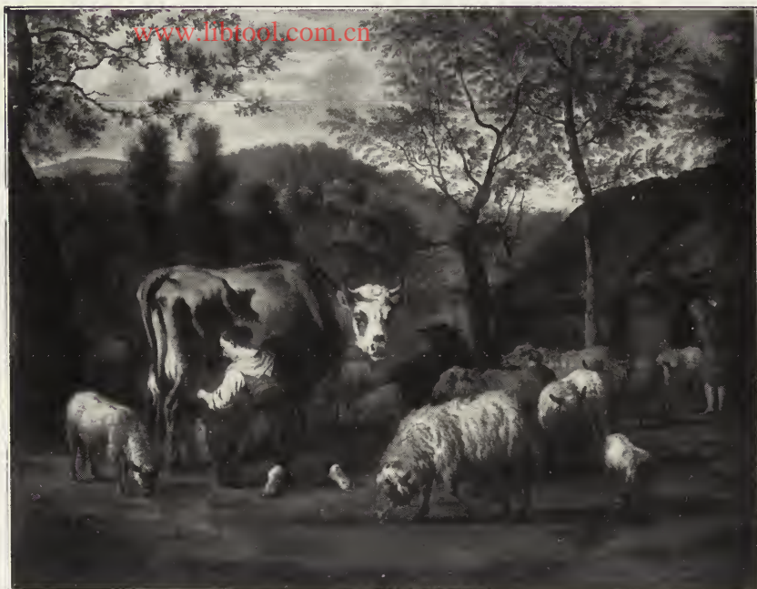
77. — VELDE (Adriaen van de).