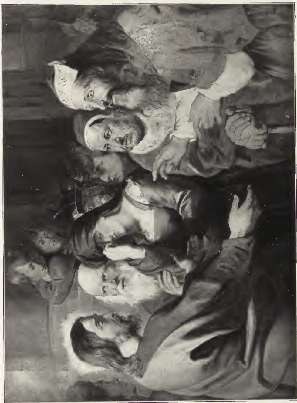
90. — RUBENS (Petrus Paulus).