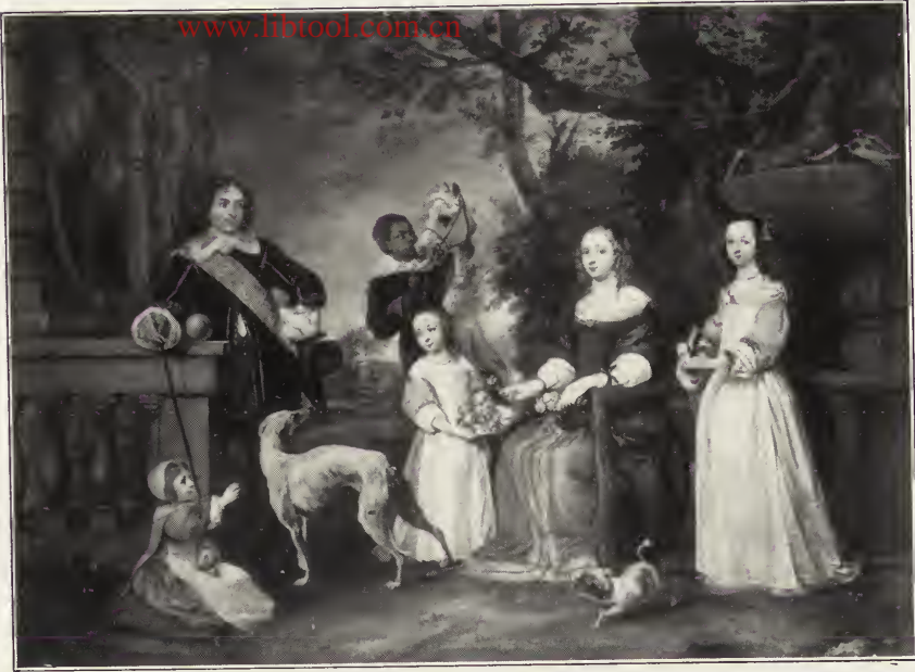
86. — Cocques (Gonzales).