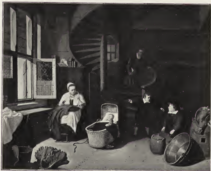
70. — SLINGELAND (Pieter Cornelisz van).