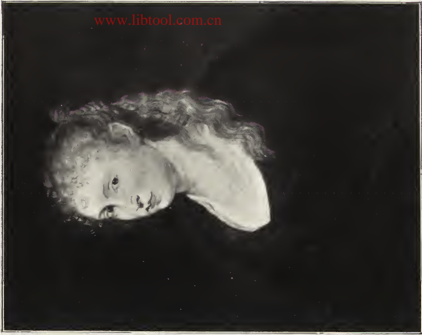
91. — RUBENS (Petrus Paulus).