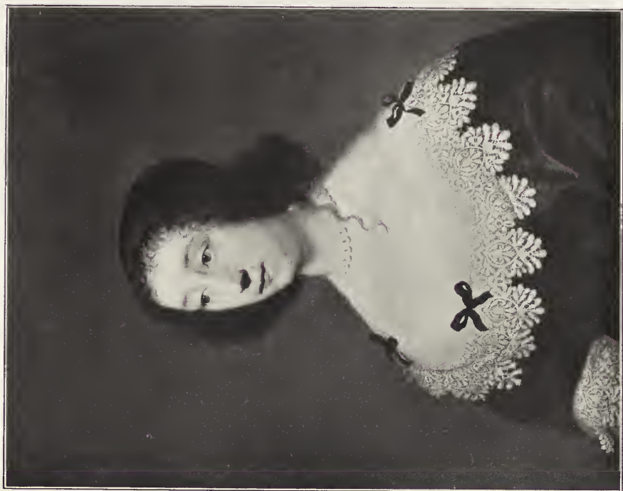
39. — JANSSENS VAN CEULEN (Cornelis).