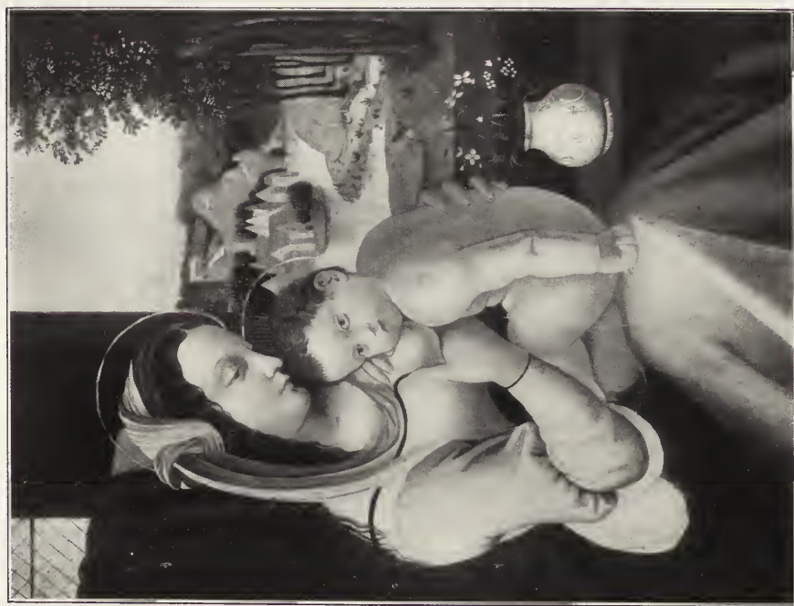
128. — BERNARDINUS DE COMITE.