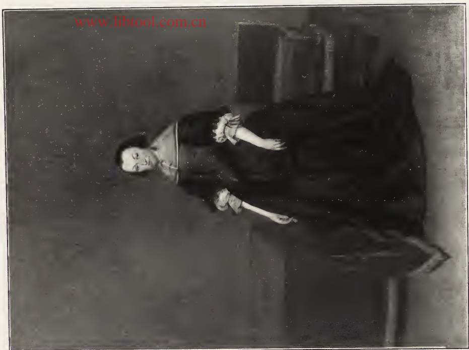
75. — TERBURG (Terborch Gerard).