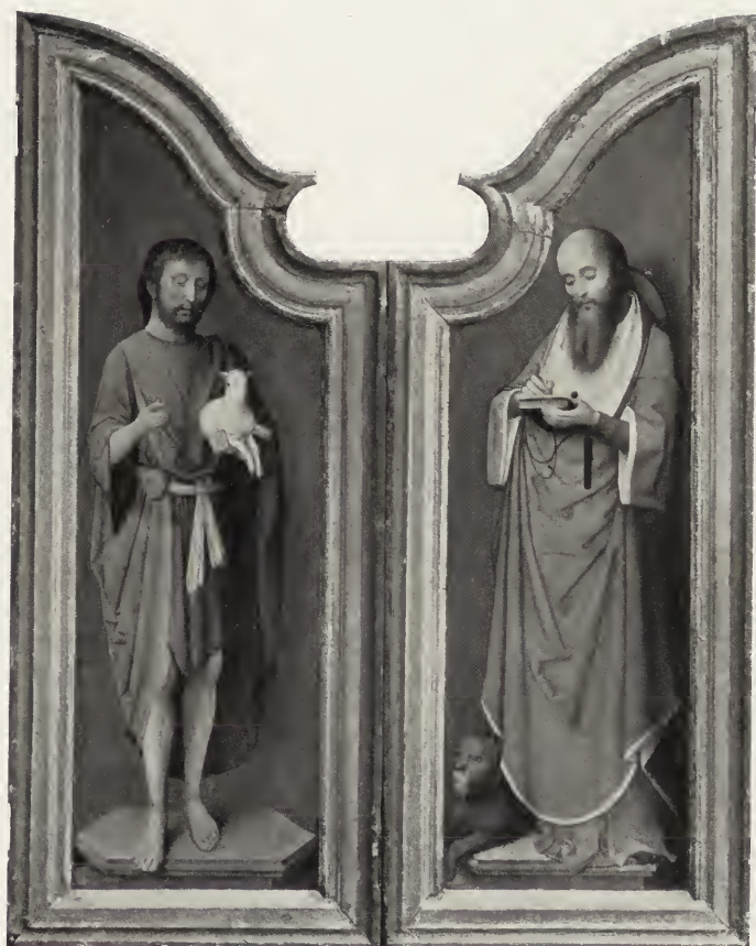
117. — YSENBRANDT (Adriaen).