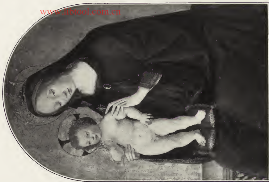
125. — ANTONIAZZO ROMANO.