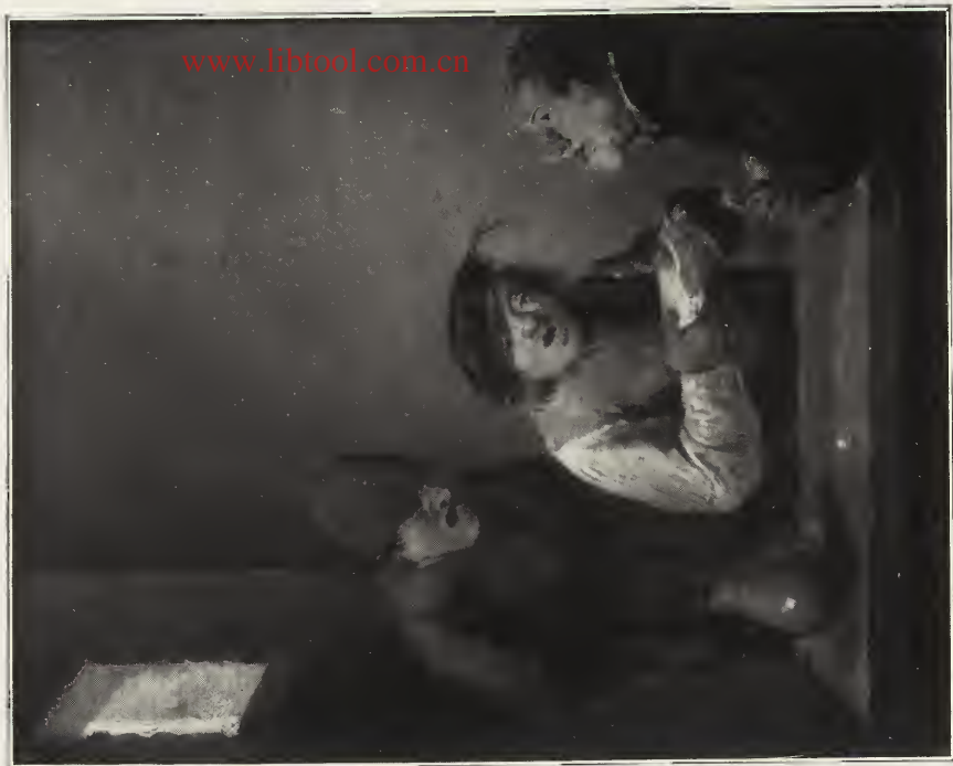
6. — Brouwer (Adriaen).