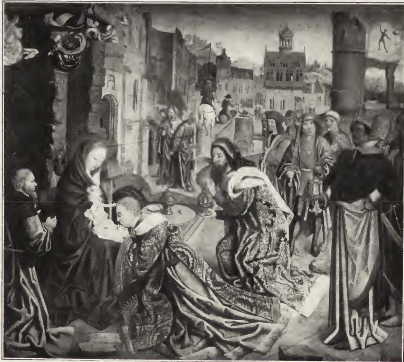
123. — MASTER OF THE HOLY KINSHIP.