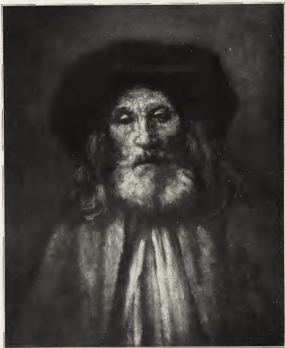
58. — REMBRANDT HARMENSZ VAN RIJN.