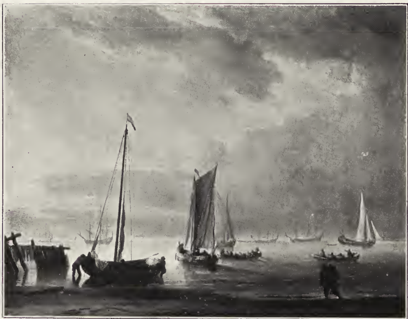
80. — VELDE the younger (Willem van de).