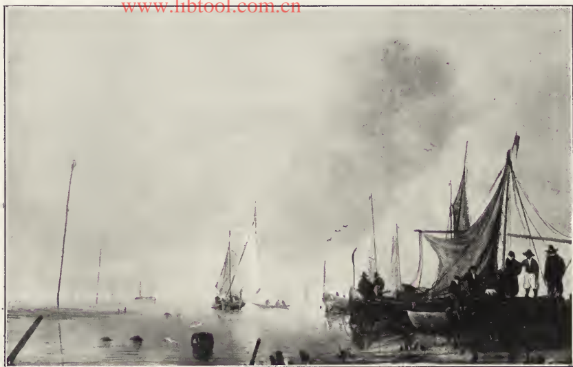
10. — CAPPELLE (Johannes van de).