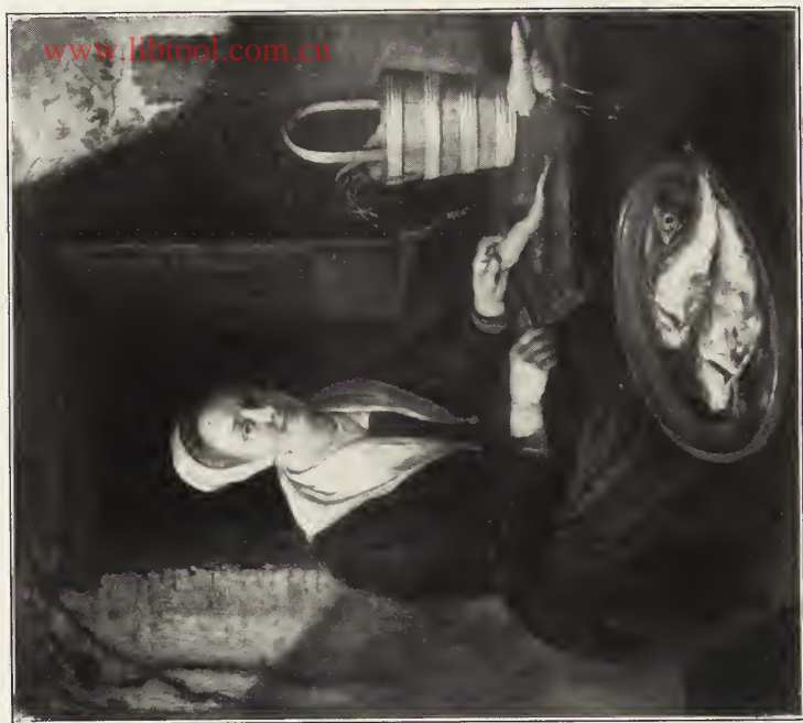
42. — Metsu (Gabriel).