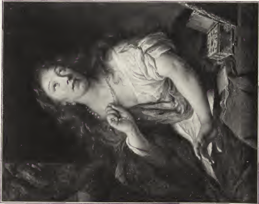
22. — FLINCK (Govert).