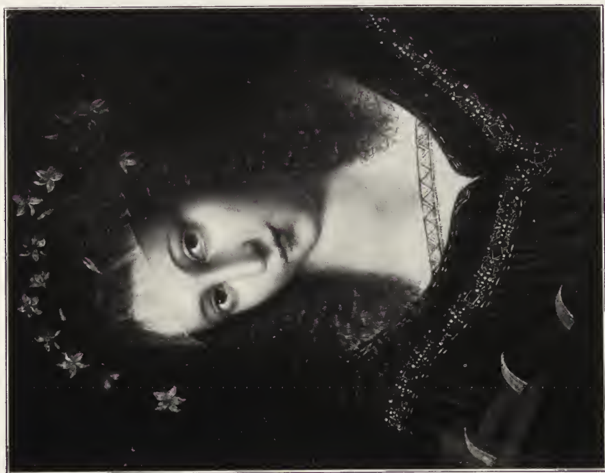
135. — BARTOLOMMEO VENETO.