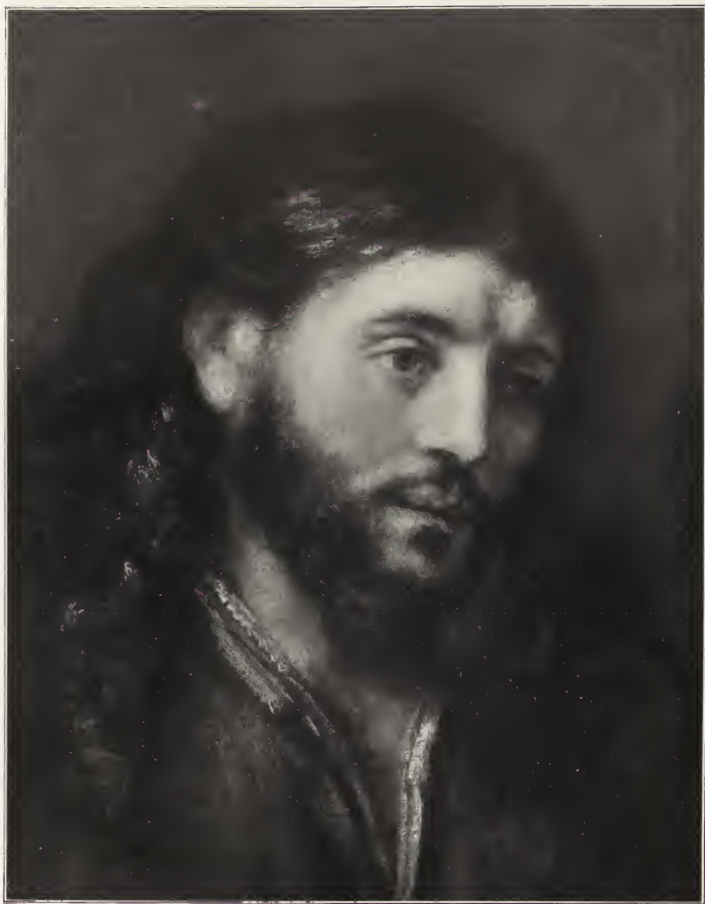
59. — REMBRANDT HARMENSZ VAN RIJN.