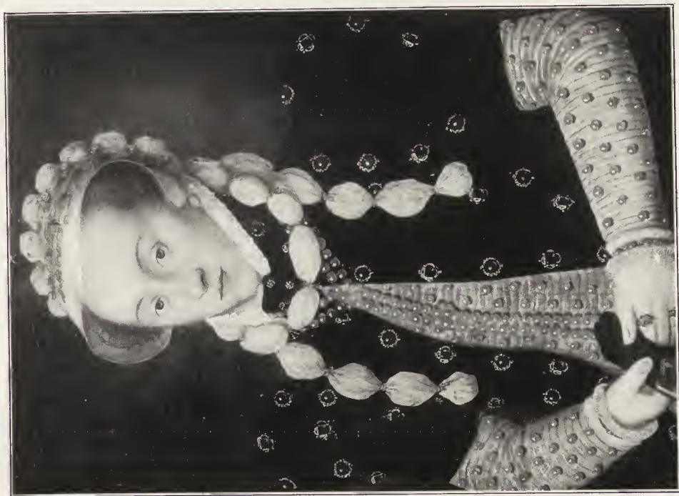
114. — Pourbus the elder (François).