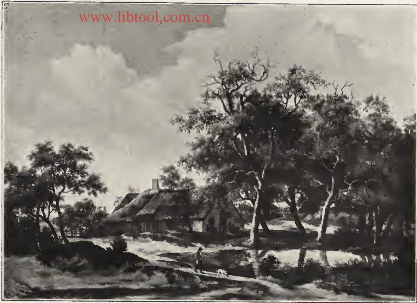
34. — HOBBEEMA (Meindert).