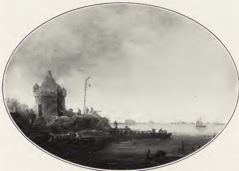
24. — GOYEN (Jan van).