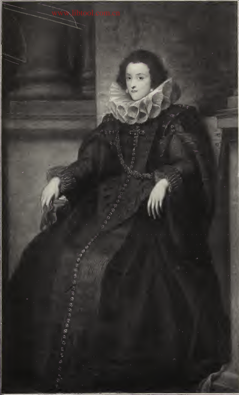
102. — VAN DYCK (Antonius).