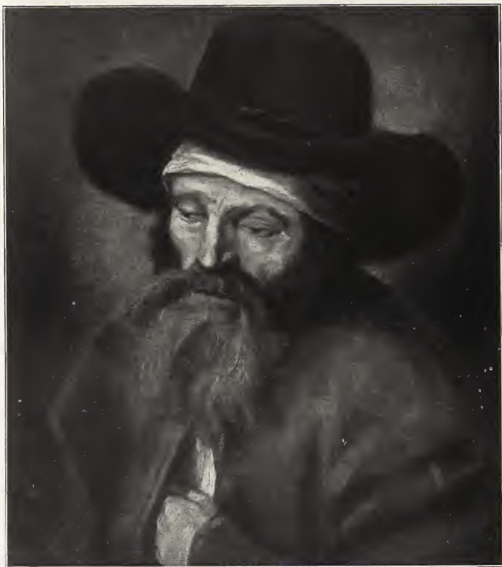
60. — REMBRANDT HARMENSZ VAN RIJN.