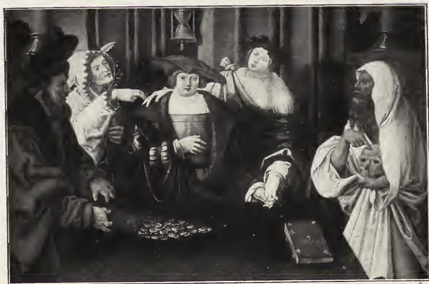
85. — LEYDEN (Lucas van).