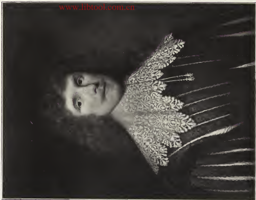
38. — JANSSENS VAN CEULEN (Cornelis).