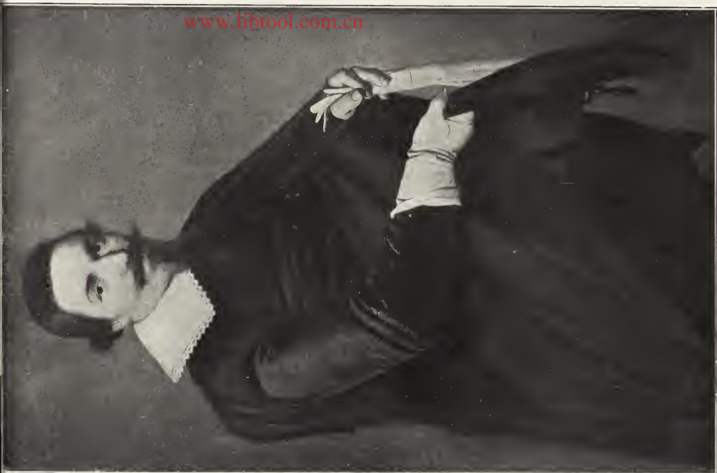
40. — KEYSER (Thomas de).