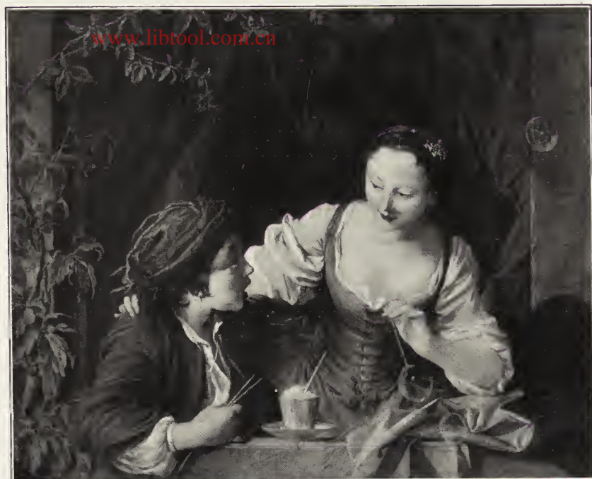
147. — BOUCHER (François).