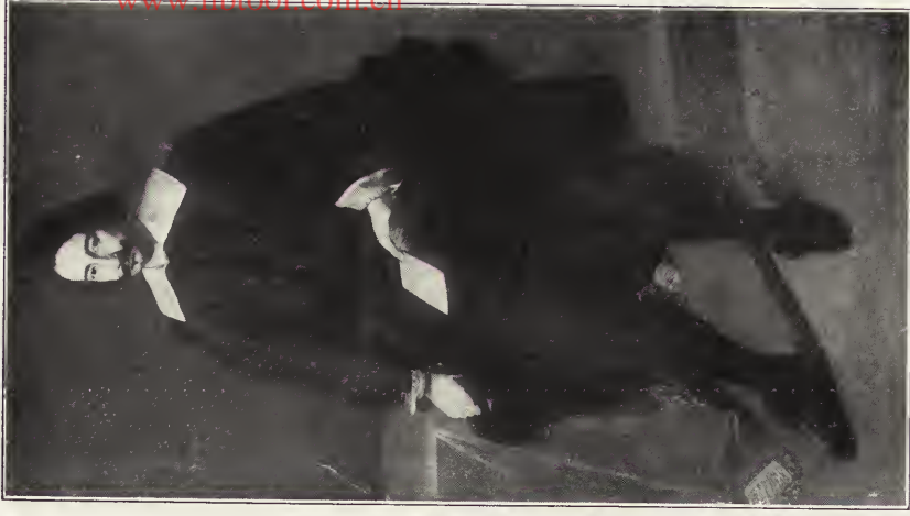
140. — CARREÑO DE MIRANDA (D. Juan).