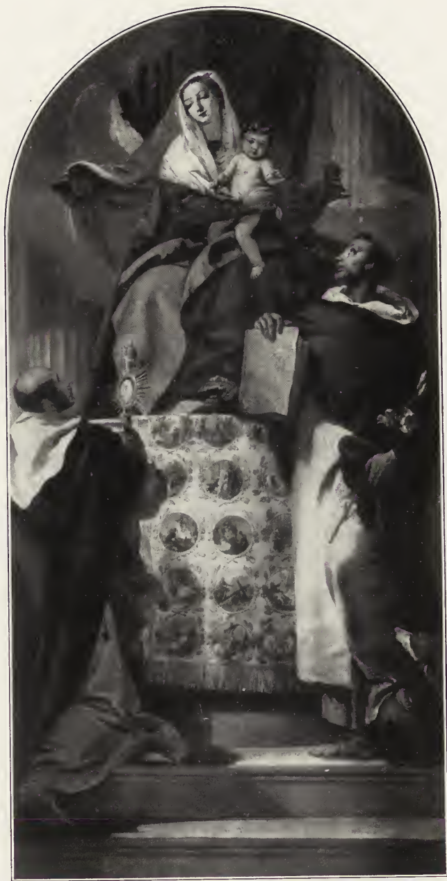
138. — TIEPOLO (Giovanni Battista).