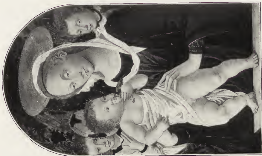
133. — PISANELLO PISANO (Vittore).