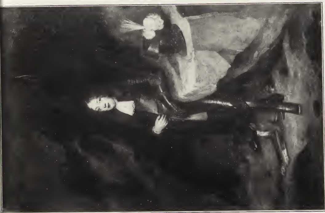
76. — TERBURG (Terborch Gerard).