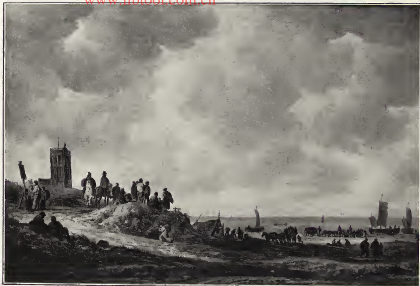
23. — GOYEN (Jan van).