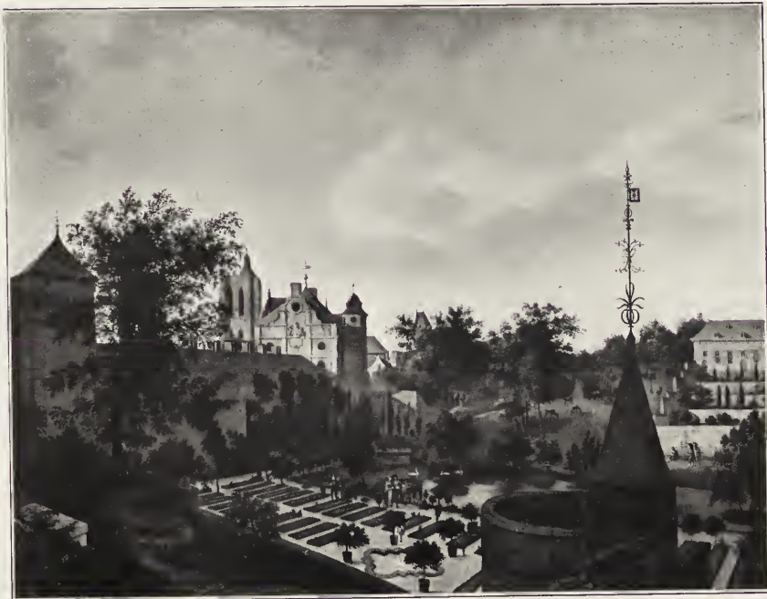
30. — HEYDEN (Jan van der).