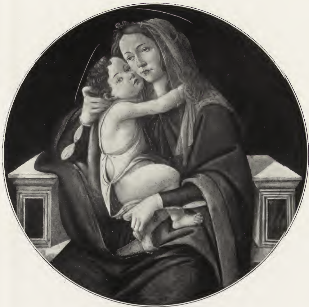
129. — BOTTICELLI-FILIPPI (Sandro).