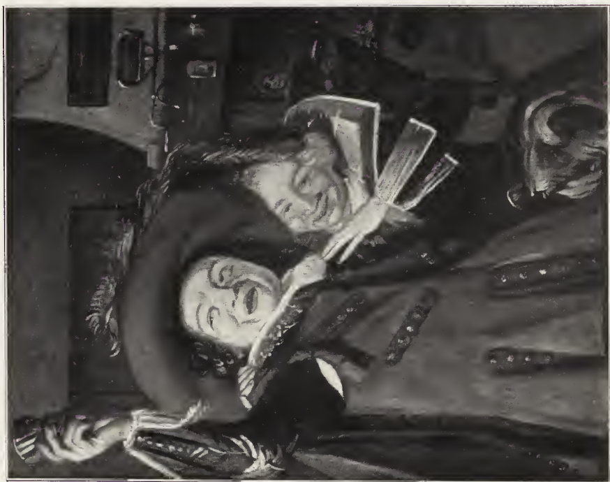
41. — LEYSTER (Judith).