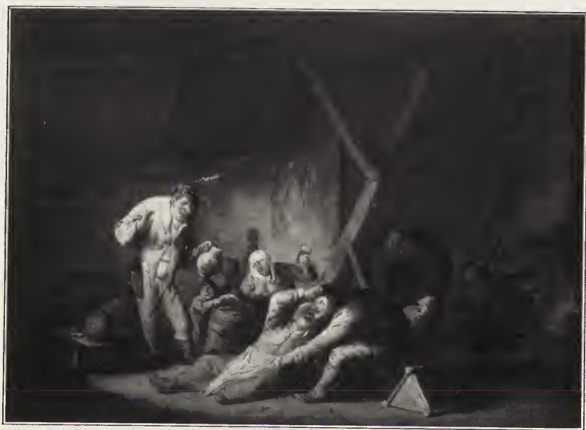
53. — OSTADE (Adriaen van).