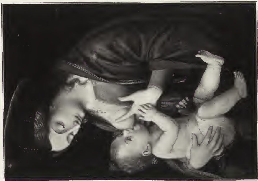
132. — LUINI (Bernardino).