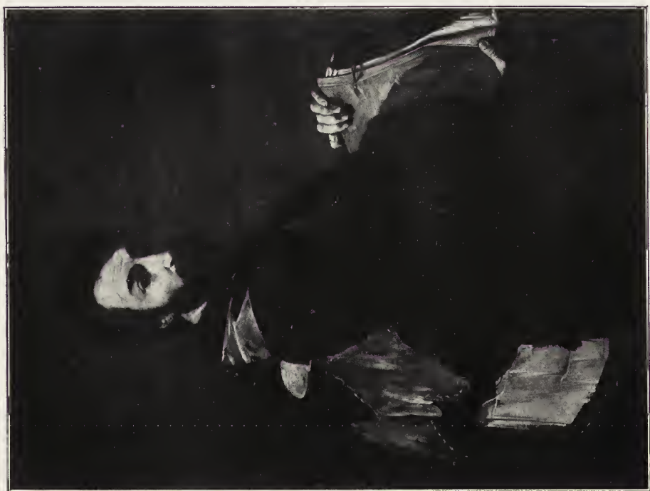
144. — RIBERA (José de).