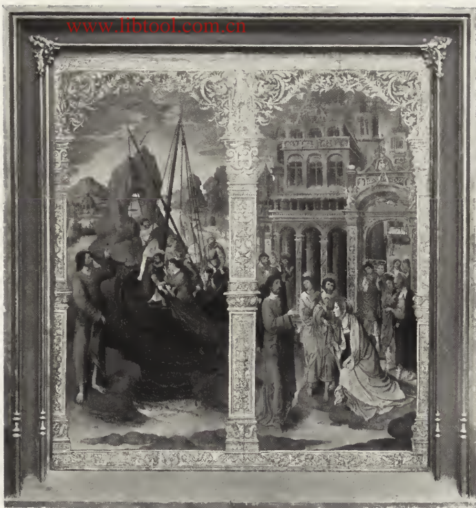
107. — BLONDEL (Lancelot).