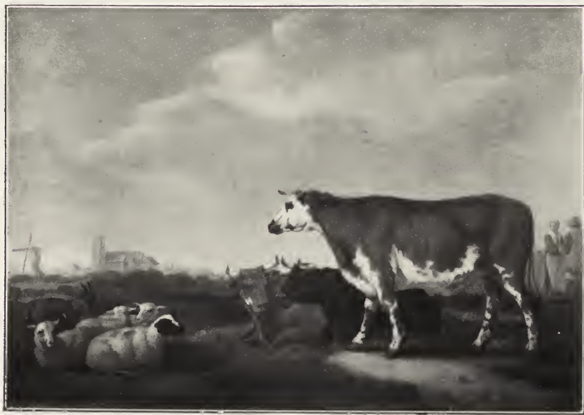
11. — CUYF (Aelbert).