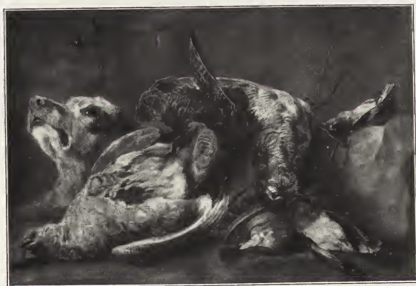
89. — FYT (Jan).