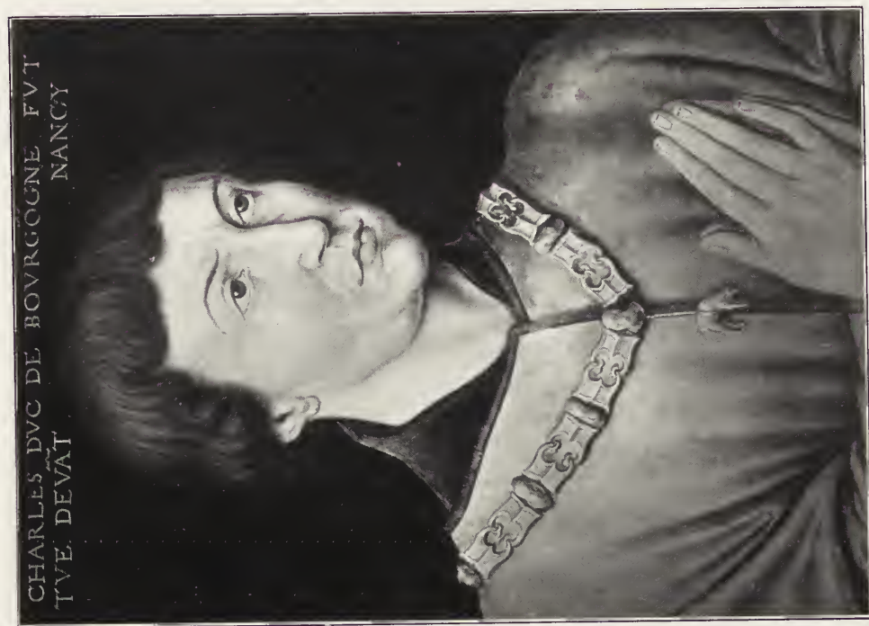
146. — ANCIENT FRENCH SCHOOL.