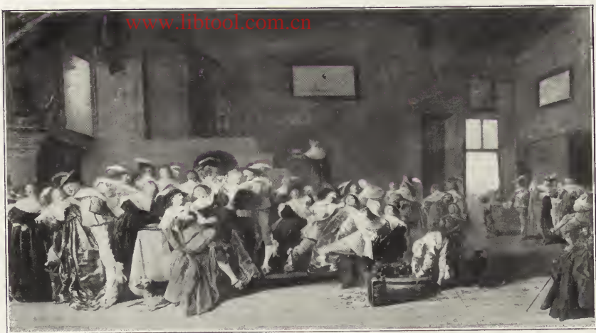
26. — HALS (Dirck).