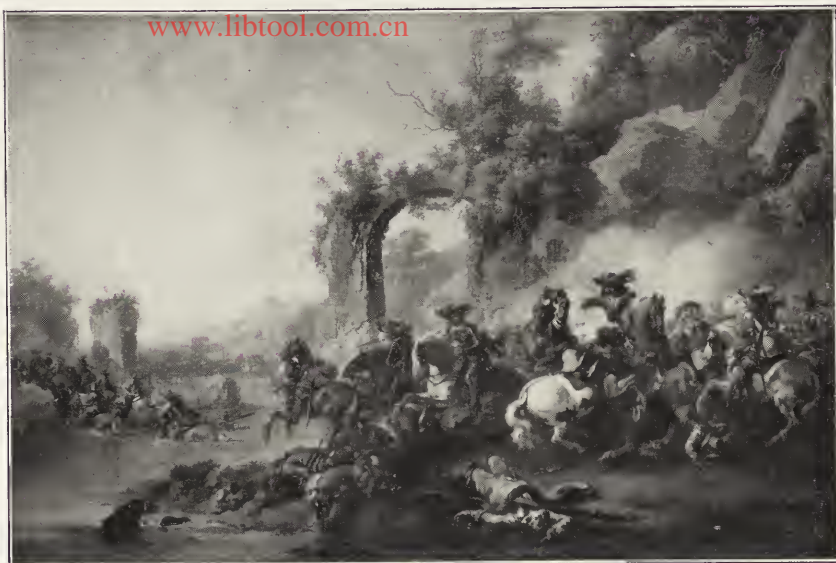
1. — BERCHEM (Claes Pietersz).