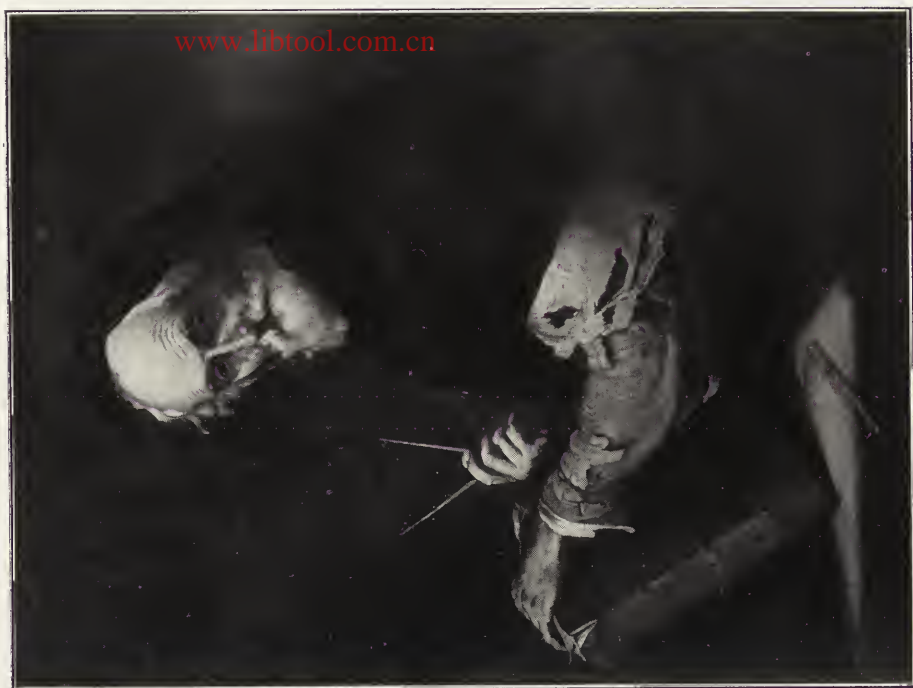
143. — RIBERA (José de).