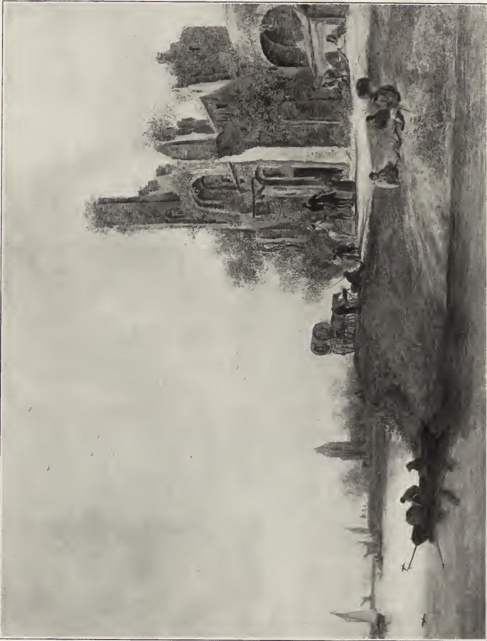
25. — GOVEN (Jan van).