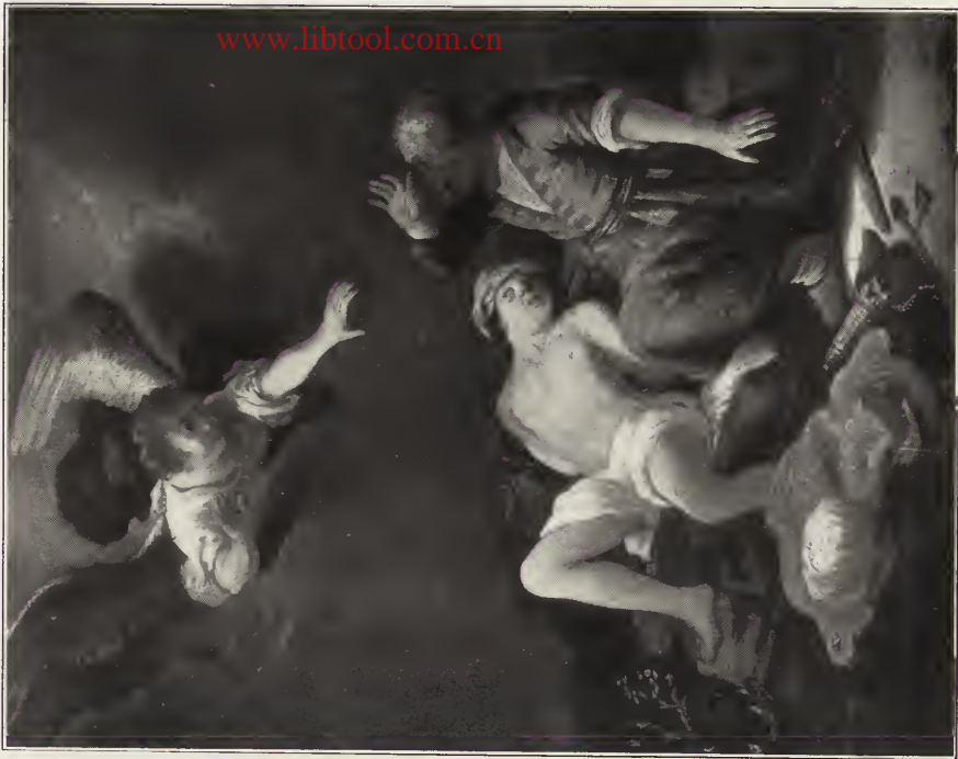
21. — FLINCK (Govert).