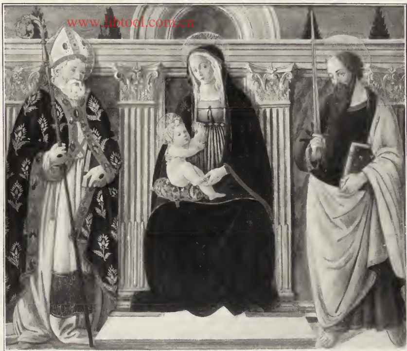
127. — BALDOVINET II (Alesso).