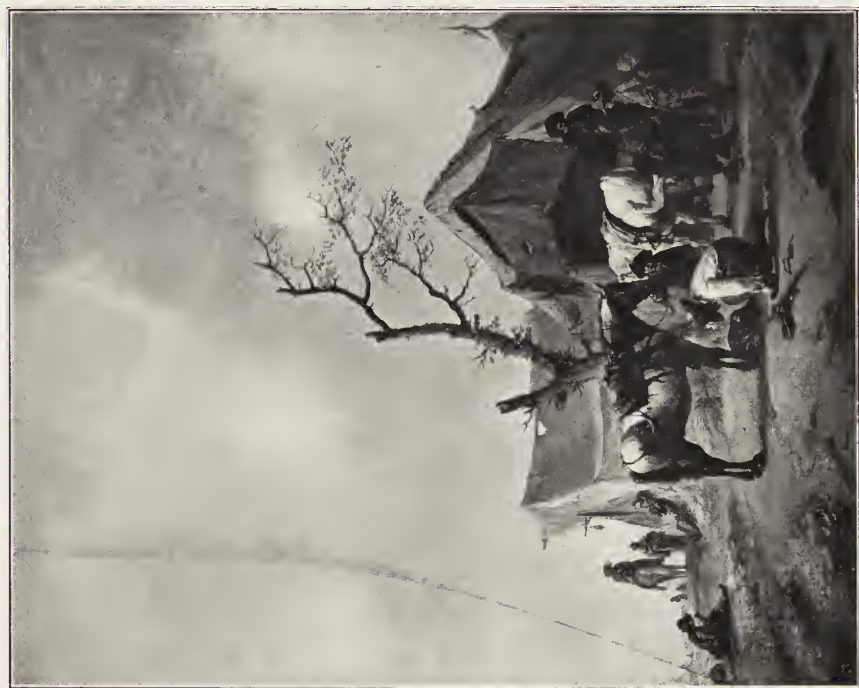
82. — WOUWERMAN (Philips).