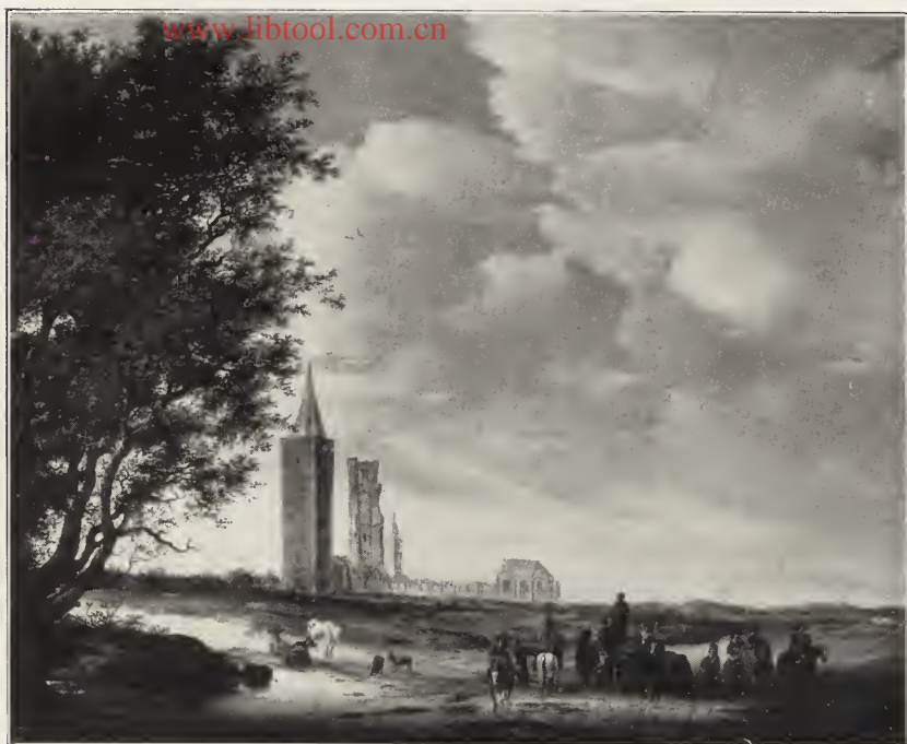
65. — RUYSDAEL (Salomon van).