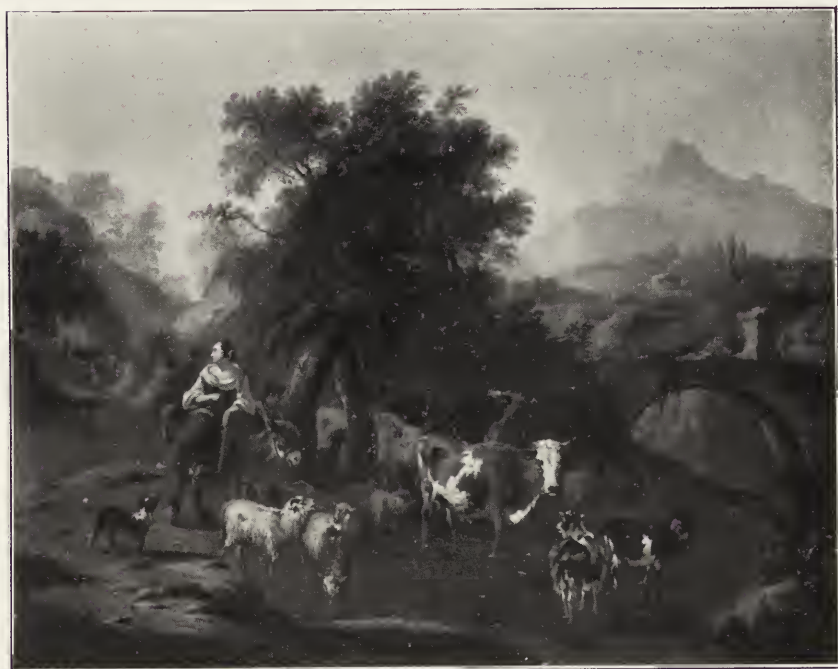
2. — BERCHEM (Claes Pietersz).