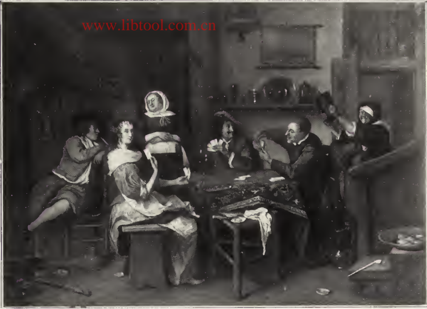
73. — STEEN (Jan).