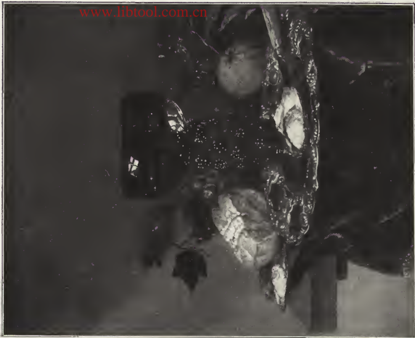
3. — BEYEREN (Abraham Hendriksz van).