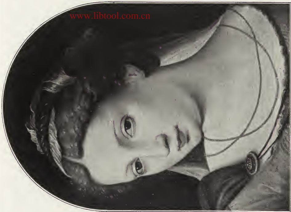
111. — ORLEY (Bernard van).