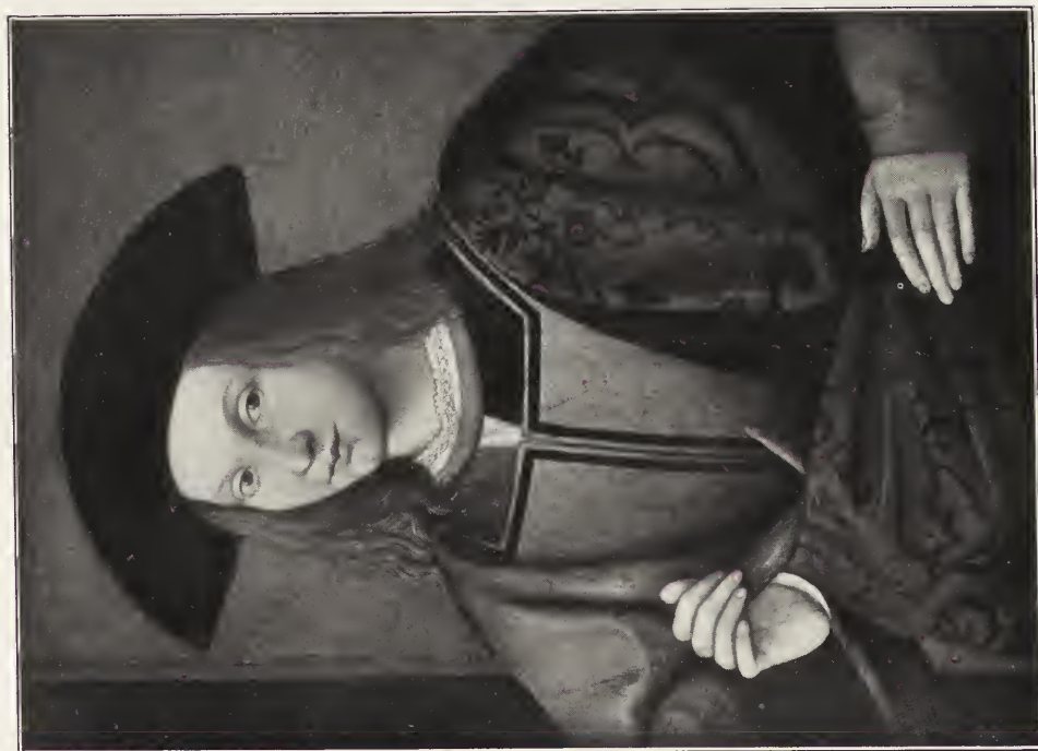
126 — ASPERTINI. (Amico).