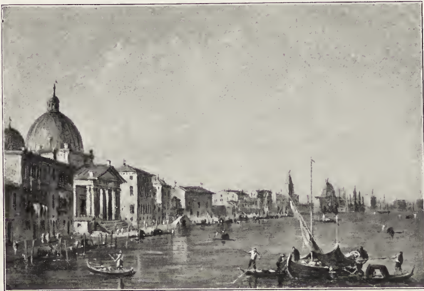
137. — GUARDI (Francesco).