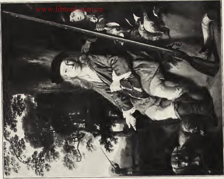
15. — Cruy (Aelbert).