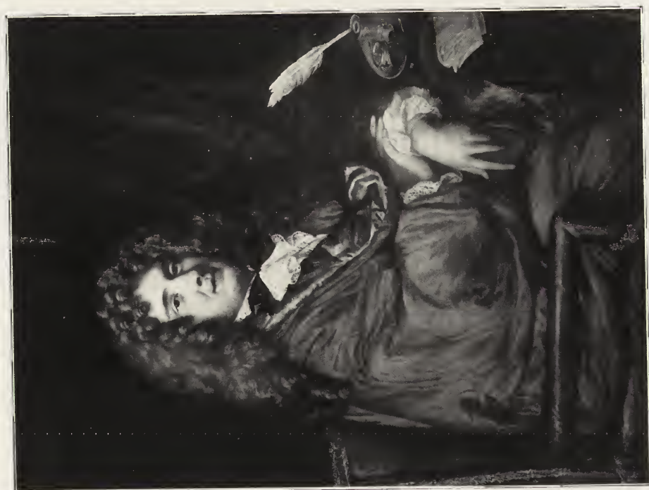
148. — BOURDON (Sébastien).