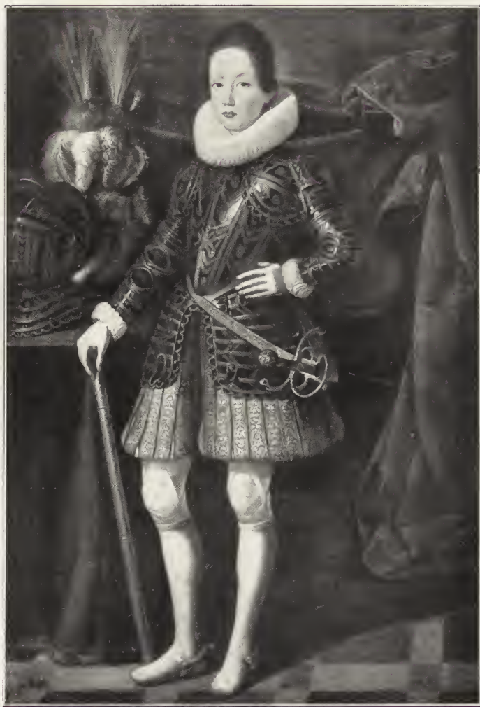
104. — SUTTERMANS (Justus).