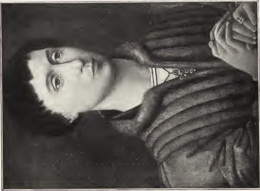
116. — WEYDEN (Roger van der).