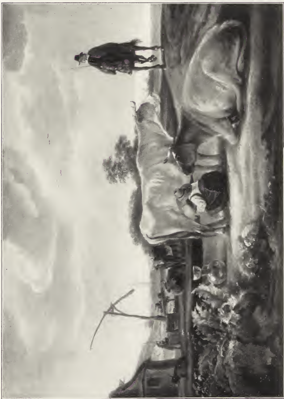
12. -- CuyP (Aelbert).