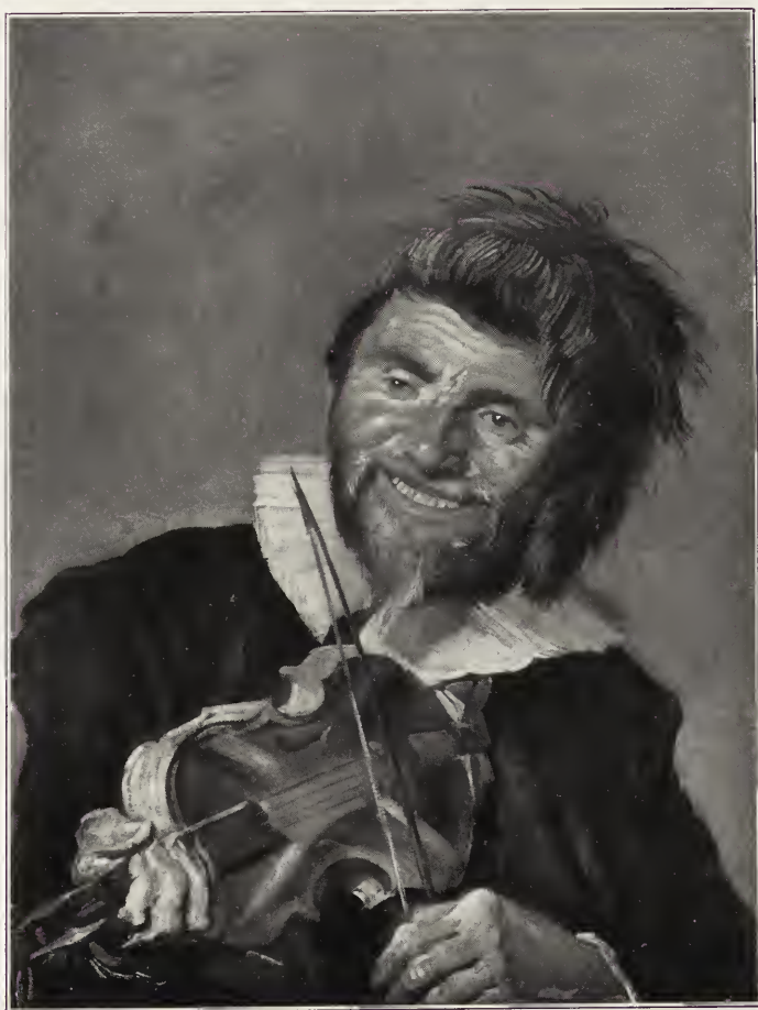
27. — HALS (Frans).