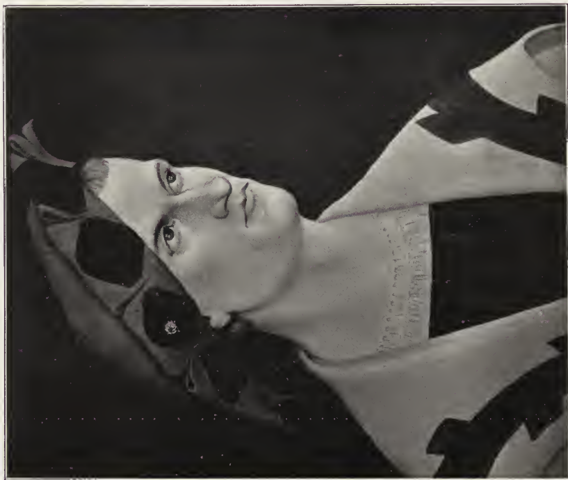
119. — BALDUNG-GRIEN (Hans).