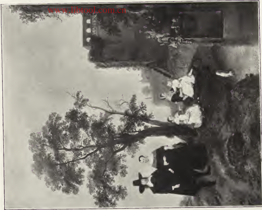
48. — NETSCHER (Caspar).