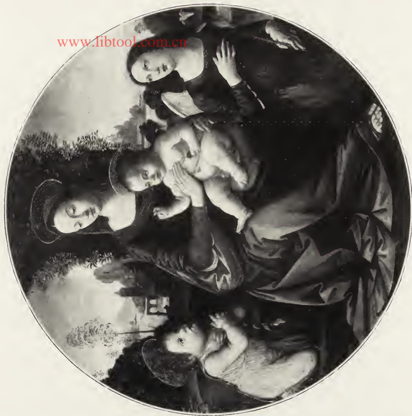
134. — RAFFAELLINO DEL GARBO.