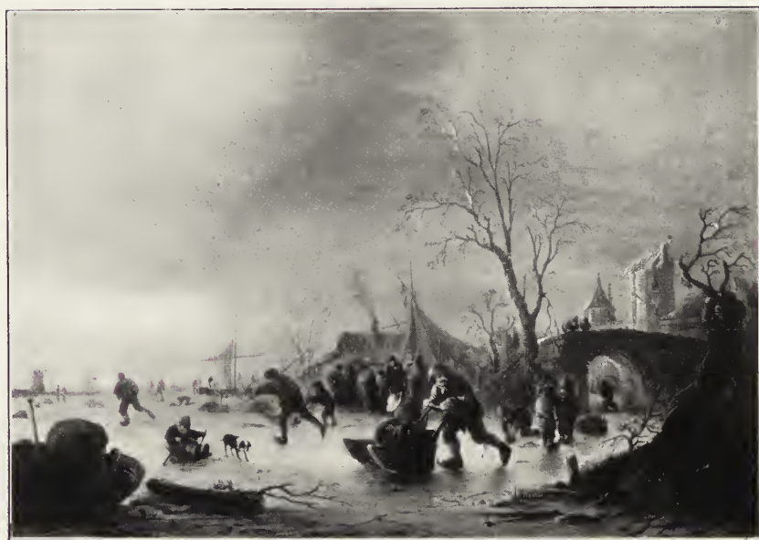
55. — OSTADE (Isack van)