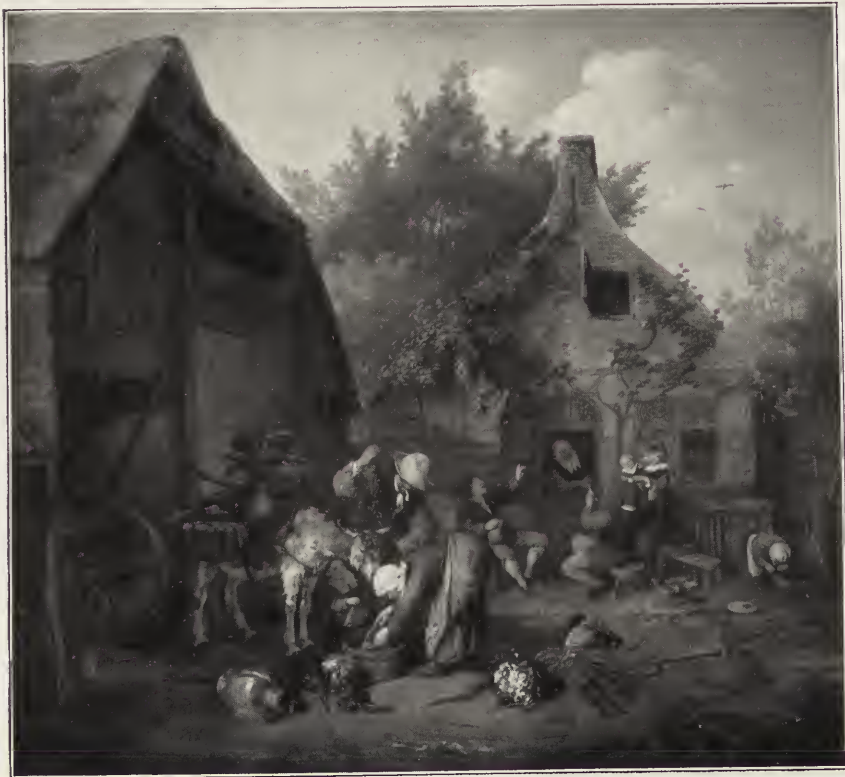
20. — DUSART (Cornelis).