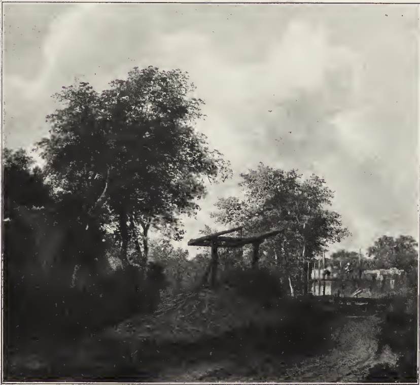
62. — RUISDAEL (Jacob van).