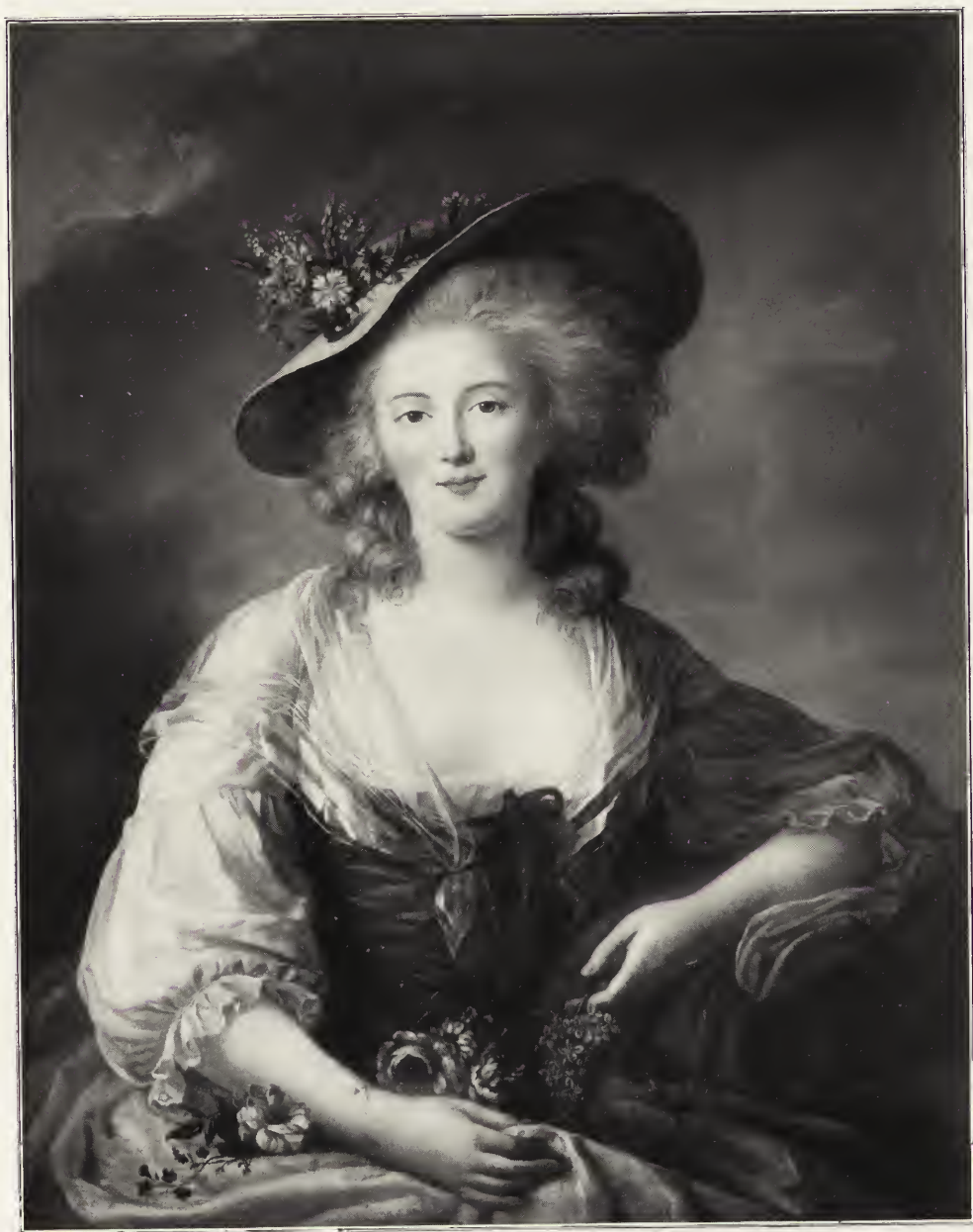
150. — VIGÉE LEBRUN (Louise-Élisabeth).