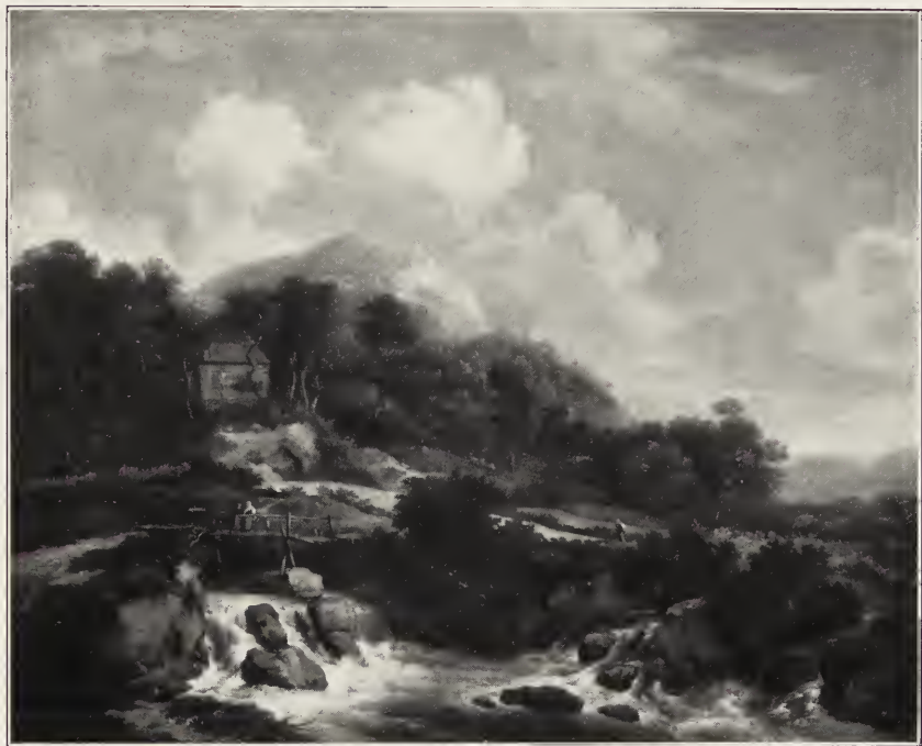
64. — RUISDAEL (Jacob van).