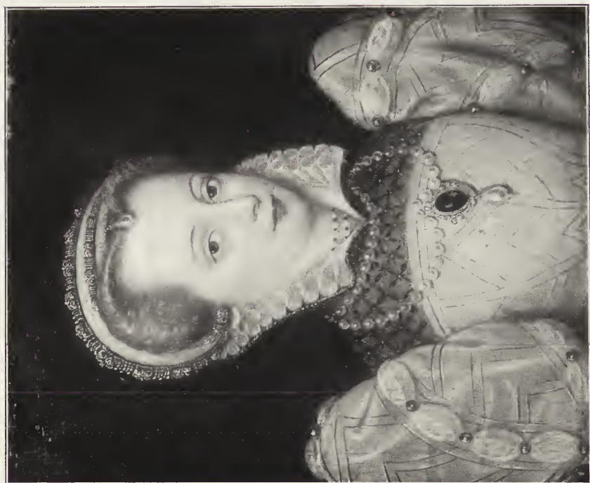
112. — POURBUS the elder (François).