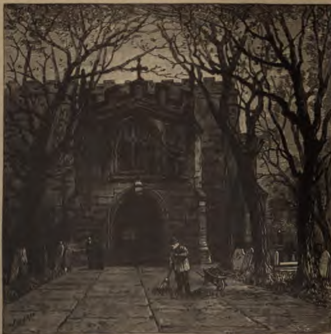
THE PORCH OF STRATFORD CHURCH.