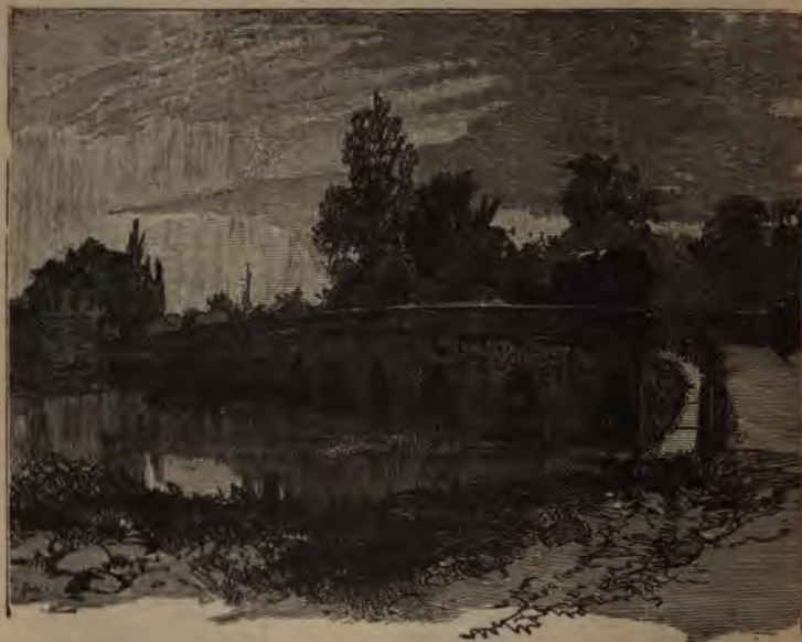
OLD BRIDGE AT STRATFORD.