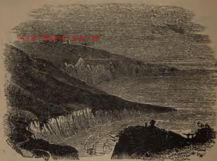
DOVER CASTLE IN THE TIME OF ELIZABETH.