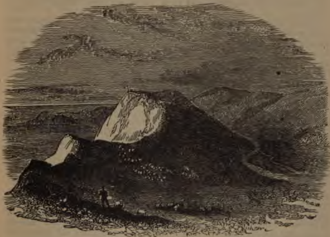
COUNTRY NEAR DOVER.