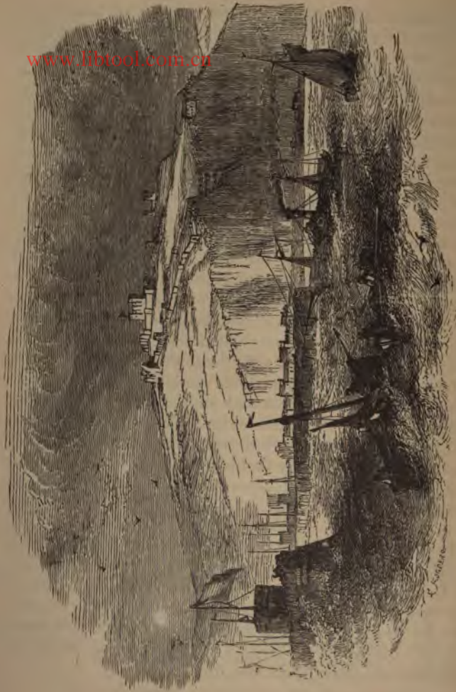
DOVER IN OUR DAY.