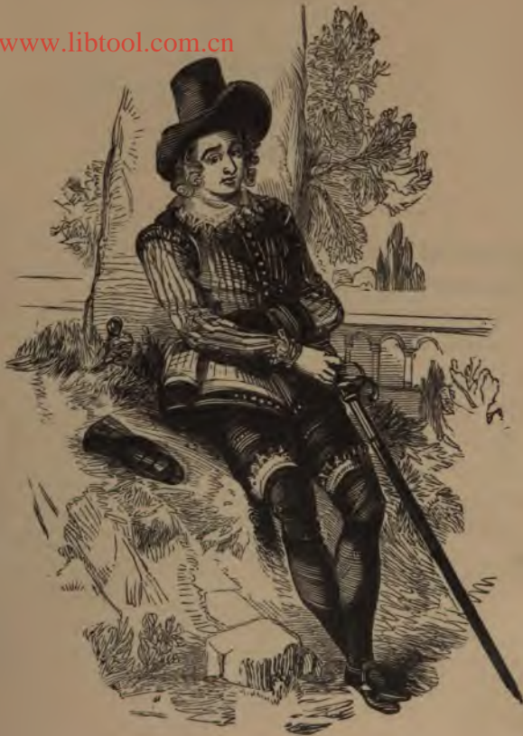
SIR PHILIP SIDNEY (p. 14).