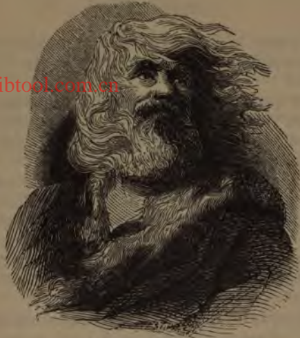
LEAR (AFTER SIR JOSHUA REYNOLDS).