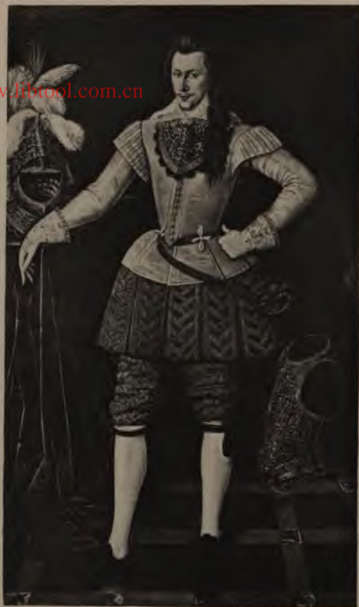
Henry Wriothesley, third Earl of Southampton. from the original picture at Welbeck Abbey.