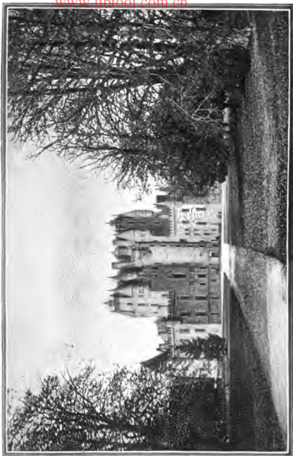
GLAMIS CASTLE (From a Photograph)